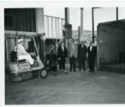
4 men looking at drums being unloaded (1983.63.172)