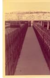
Rows of drums AEC (1983.63.30)