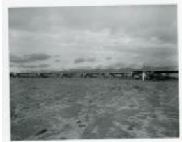
Seven survey airplanes on Ground Walker Field + 2 copies (1983.63.196)