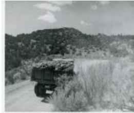
Back of truck with ore load (1983.63.93)