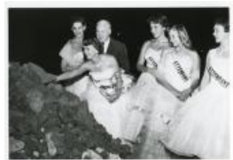
Miss Atomic Energy + 1 copy (1983.63.236)