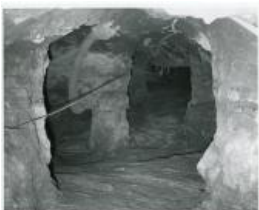
Pillar supported stopes in an underground Uranium mine. Pillars and ore will be extracted in retreat mining. (1983.63.181)