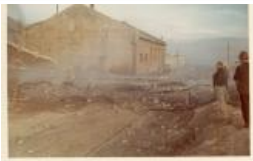
Old Sugar Beet Building (Photo) (1983.63.60)