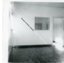
Office in Lab (Photo) (1983.63.66)