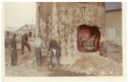
Base of stack (1983.63.50)