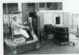
"Last Load" Hyster unloading drum - + 6 copies (1983.63.168)