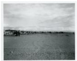
Eight survey airplanes on Ground Walker Field (1983.63.195)