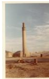
Start blasting (1983.63.52)