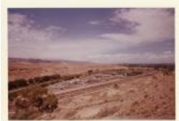
AEC Grand Junction Compound from Reservoir Hill (July 1963) (1983.63.197)