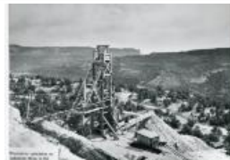
Worcester Operation on Atkinson Mesa in the Uruvan mineral belt (1983.63.74)