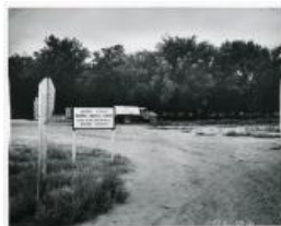
United States Atomic Energy Com. Colo. raw materials office sign in front of Cemetery (1983.63.215)