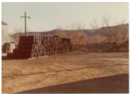
Stack of Drums (1983.63.217)