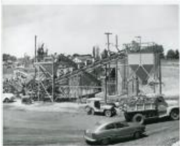
Government ore-buying station and sampling plant at Monticello, Utah (1983.63.185)