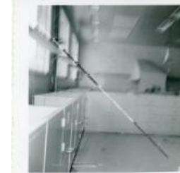
Cabinets in lab (Photo) (1983.63.65)