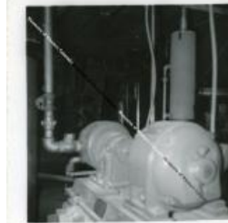
Large pump in laboratory (Photo) (1983.63.67)