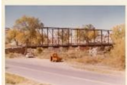
Black Bridge over Gunnison River + Negative (1983.63.199)