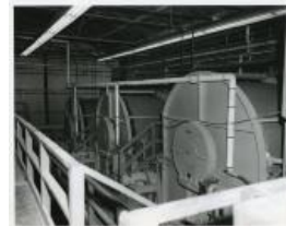
Pilot Plant - Grand Junction (1983.63.133)