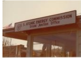
U.S. Atomic Energy Commission, Grand Junction, CO Office sign by gate entrance (1983.63.226)