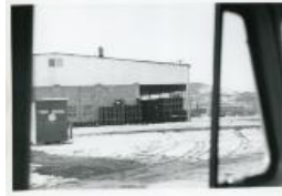
Sampling plant with drums (1983.63.148)