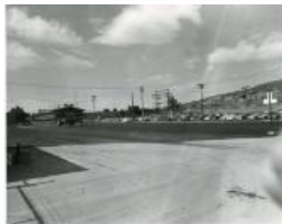
Grand Junction Compound paving parking lot (9 July 1957) [Duplicate] (1983.63.108)