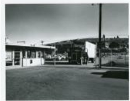
Garrett Truck coming into compound + 1 copy (1983.63.174)