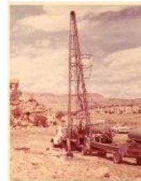
Uranium Drilling (Photo) (1983.63.85)