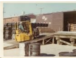
Hyster operator carrying two drums up ramp for loading in freight car (1983.63.34)