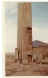
Climax uranium stack demolition 24 Nov 1970 (old sugar factory area) (1983.63.49)