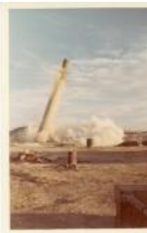
Stack starting to fall (Photo) (1983.63.54)