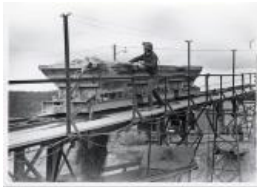
North Alice Mine Photograph (1981.267.5)