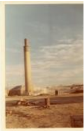
Blasting (Photo) (1983.63.53)