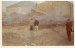
Stack down on ground (Photo) (1983.63.57)