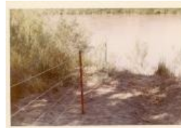
Barbwire to river AEC Compound + negative (1983.63.205)