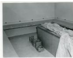
AEC balance room Analytical Lab (25 June 1957) (1983.63.110)