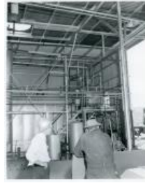
Inside new boiler house AEC Compound (26 Sep 1956)