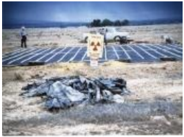
AEC uranium ore test anomaly at Walker Field Airport (1983.63.21)