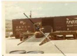
Loading DF car long view can #65215 (1983.63.47)