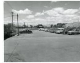
Grand Junction Compound parking lot prior to black topping (18 June 1957) (1983.63.100)