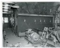
AEC Air Handling Equipment (25 June 1957) (1983.63.111)