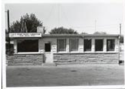
AEC Office Grand Junction Photograph (2008.24.5)