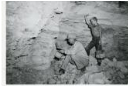
Man and boy looking for uranium (1983.63.71)