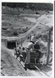
North Alice Mine Photograph (1981.267.3)