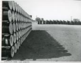
Picture of Concentrate drums GJ Compound (1983.63.2)