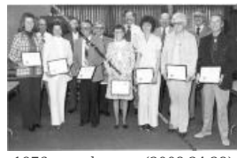
1976 award group (2008.24.28)