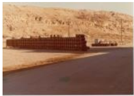
Stack of drums (1983.63.218)