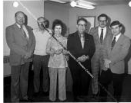
1976 service award group (2008.24.31)