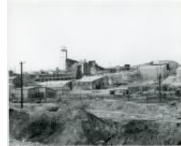
Uranium processing mill at Monticello, Utah. This is the only government owned uranium mill. (1983.63.188)