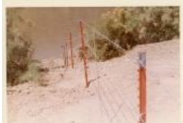
Barbwire fence going down to river - AEC Compound (1983.63.198)