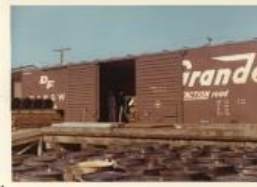
Rio Grande DF car being loaded with concentrate for shipment to Fernald, Ohio (1983.63.43)