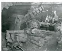
Underground dumping ore from diesel dump truck into Granby type car (1983.63.183)