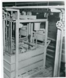
Pilot Plant - Grand Junction (1983.63.135)