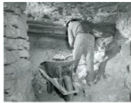
Hand loading ore into a wheelbarrow (1983.63.73)