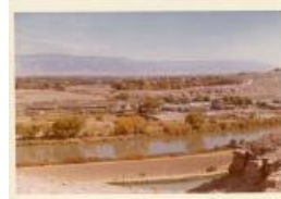
AEC Compound from the West + negative (1983.63.209)