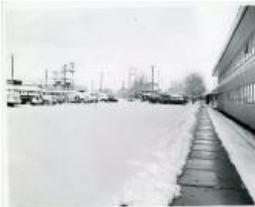
Snow storm at AEC Compound Grd. Jct. Cleaned Walk (1983.63.118)