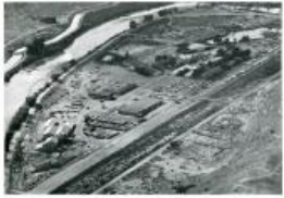
Aerial photo view of AEC Compound (1983.63.123)