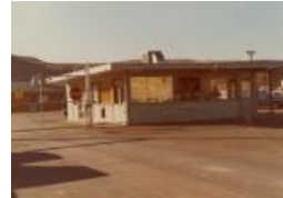
South gate building AEC (1983.63.216)