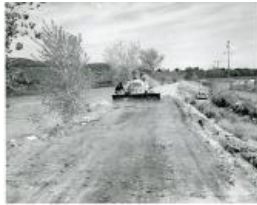
Two CAT bulldozers working on dike (1983.63.10)