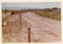
Barbwire along dike + negative (1983.63.202)