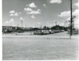
Grand Junction Compound parking lot prior to black topping (18 June 1957) (1983.63.102)