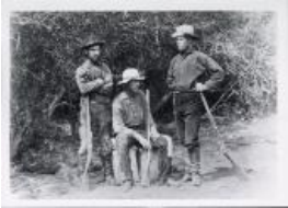
1875 Grand River Division Photograph (1981.186.2)