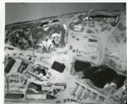
Aerial view of AEC Compound (1983.63.19)