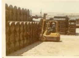
Picking up drum East of Sample plant AEC (1983.63.45)