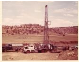
Uranium Drilling (Photo) (1983.63.86)