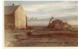
Stack base in pile, building (Photo) (1983.63.58)