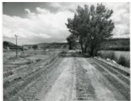
Dike along river looking South (1983.63.16)