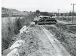
CAT bulldozer pushing riprap into river bank (1983.63.7)