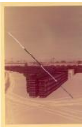
Rows of Drums (1983.63.36)