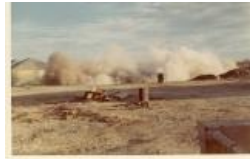
Stack down (Photo) (1983.63.55)