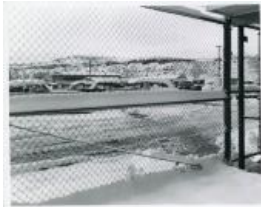
Snow storm at AEC Compound Grd. Jct. (1983.63.117)