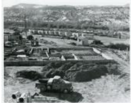
AEC New Foundation (1983.63.128)