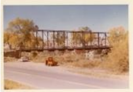
Black Bridge over Gunnison River + negative (1983.63.206)