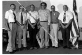
1977 award group (2008.24.25)