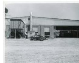
AEC Sampling Plant Expansion site (23 Jul 1956) (1983.63.140)