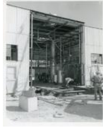
New boiler house outside looking in (1956) (1983.63.114)