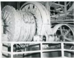
5' x 6' EIMCO Ball Mill - Pilot Plant - Grand Junction (1983.63.138)