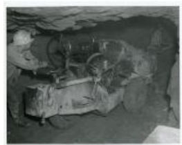
Underground low frontend loader (1983.63.182)