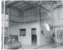
New boiler house building (1956) (1983.63.113)