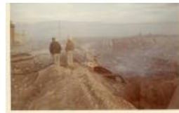
Mill site looking East (Photo) (1983.63.61)