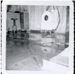
Refinery Photograph (1982.171.40)