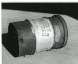
This corroded drum requires only a light blow with a screwdriver to pierce the metal and tear (1983.63.161)