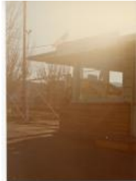
Gate Entrance (1983.63.225)