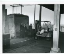
Men standing in back of truck watching the drums unload (1983.63.171)