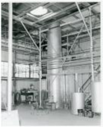
Grand Junction AEC Compound Boiler house inside (26 Sep 1956) (1983.63.116)