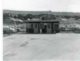
AEC Compound First Aide Station (1983.63.99)