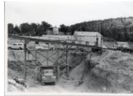
North Alice Mine Photograph (1981.267.6)