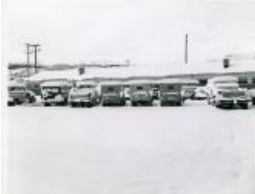
Snow storm at AEC Compound Grd. Jct. (1983.63.121)