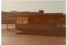
South gate building AEC (1983.63.214)