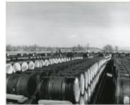
Vanadium storage closeup view looking Northwest (Copy of 158) (1983.63.159)