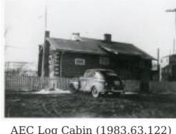
AEC Log Cabin (1983.63.122)