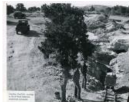
Mining, Slick Rock (Photo) (1983.63.90)