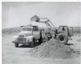
Loading uranium ore into truck at government ore-buying station and sampling plant (1983.63.190)