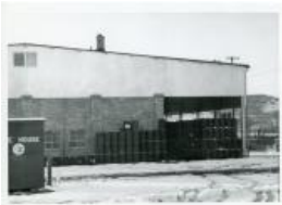
Sampling plant with drums (1983.63.149)