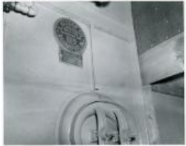
Grand Junction boiler House AEC Compound (1983.63.112)