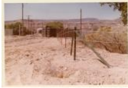
Barbwire on dike + negative (1983.63.211)