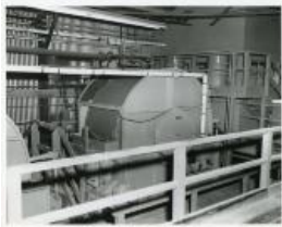
Pilot Plant - Grand Junction (1983.63.134)