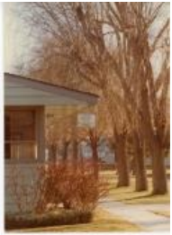
Manager's Office (1983.63.220)