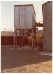
Silo with drums in background (1983.63.231)