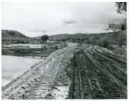
Dike between compound and Gunnison River (1983.63.5)