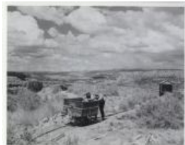
Men Pushing Mine Cart Photograph (1982.171.74)