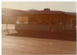
South Gate building (1983.63.228)