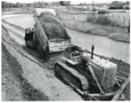
Dump truck unloading fill on dike (1983.63.4)