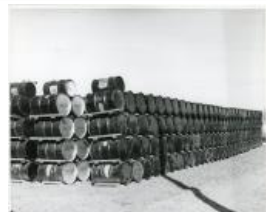
Vanadium storage looking Northwest - 55 drums comparatively new (note rust on bottom and stacking arrangement) (18 Feb 1958) (1983.63.160)