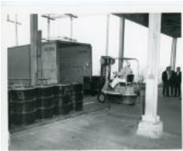
Hyster unloading drums men in background (1983.63.170)