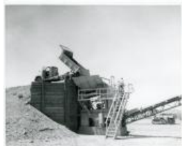
Uranium ore truck dumping into bin at government ore-buying station (1983.63.186)