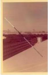
Drum storage stack at AEC (1983.63.29)