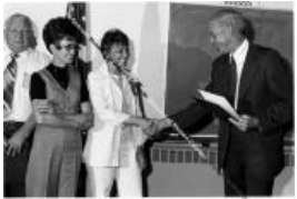
Malan award to group (2008.24.23)