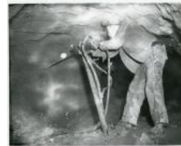
Drilling blast holes in a Colorado Plateau uranium mine. Miner is using a Jack-let type percussion drill. (1983.63.180)