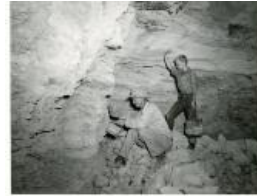
Prospecting for uranium in an old vanadium mine (1983.63.95)