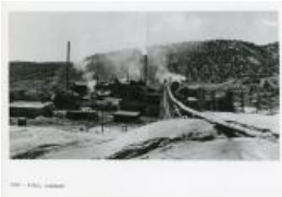
UCNC - Rifle Mill (1983.63.235)