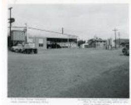
AEC Sampling Plant Expansion site (23 Jul 1956) (1983.63.143)