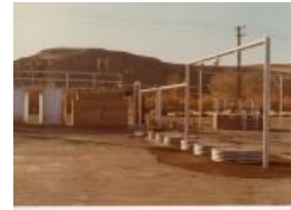
Loading docks (1983.63.223)