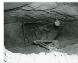
Drilling blast holes in thin-bedded uranium ore, with scraper in foreground (1983.63.177)