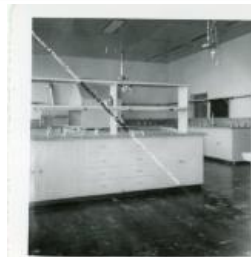
AS & R Co. Laboratory (Photo) (1983.63.63)