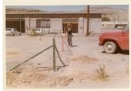
Barbwire corner East side + negative (1983.63.207)