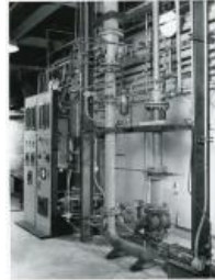
Pilot Plant - Grand Junction (1983.63.131)