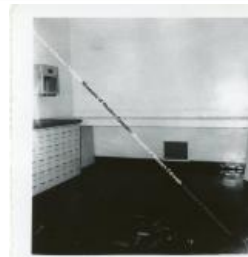
Interior of building #20 AEC Compound AS & R C. Laboratory 19 Dec 1952 (Photo) (1983.63.62)