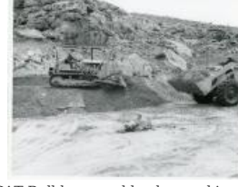
CAT Bulldozer and loader working on fill (1983.63.13)