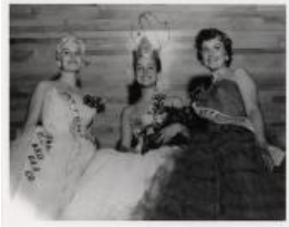
Miss Atomic Energy (1990.71)