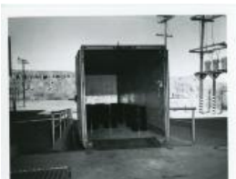
Drums in trailer last load+ 1 copy (1983.63.164)