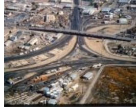
GJ Railroad yards (2008.24.1)