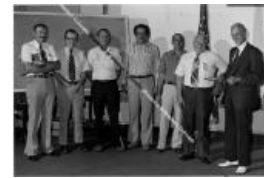
1977 award ceremony (2008.24.19)