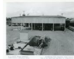
AEC view of South dock area prior to sampling plant expansion (23 Jul 1956) (1983.63.144)