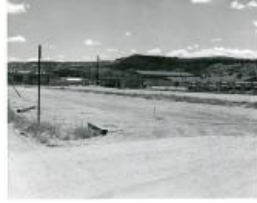
Grand Junction Compound parking lot prior to black topping (18 June 1957) [Duplicate] [Duplicate] (1983.63.104)