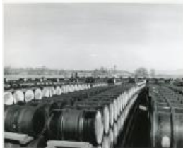
Vanadium storage closeup view looking Northwest (1983.63.158)