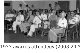
1977 awards attendees (2008.24.26)