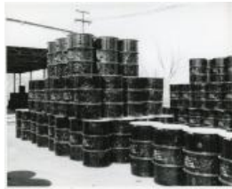
Stack of damaged drums (1983.63.233)