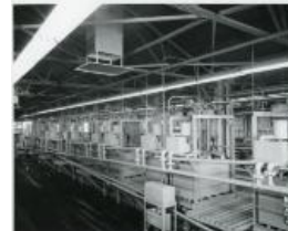
Resin-in-Pulp Equipment - Pilot Plant (1983.63.137)