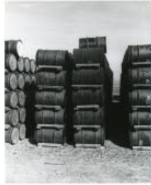
Vanadium drums looking North - older drums (18 Feb 1958) (1983.63.157)