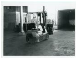
Forklift with drums + 1 copy (1983.63.165)