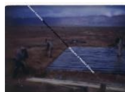
Slide: Anomaly at Walker Field Airport (1983.63.22)