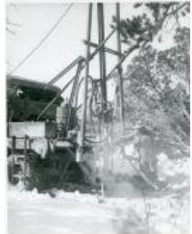
Dry hole text drilling Slick Rock (1983.63.97)