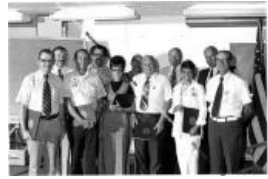
1977 award group (2008.24.24)