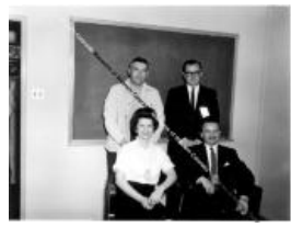
DOE employees (2008.24.17)