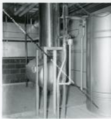
Tank in laboratory (Photo) (1983.63.64)