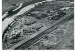
Aerial photo view of AEC Compound (1983.63.124)