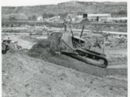
CAT Bulldozer pushing up fill across road (1983.63.12)