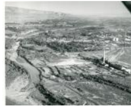
Climax mill in mid 1950s Grand Junction (1983.63.234)