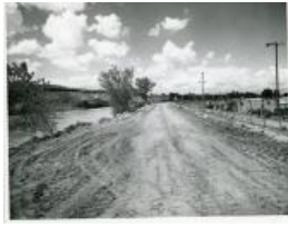
Dike along Gunnison River (1983.63.14)