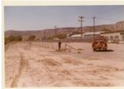
Barbwire East side of AEC Compound + negative (1983.63.204)