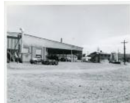
AEC Sampling Plant Expansion site (23 Jul 1956) (1983.63.139)