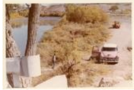
Black Bridge area + Negative (1983.63.210)