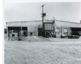
AEC Sampling Plant Expansion site (23 Jul 1956) (1983.63.142)