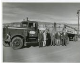
Only time AEC bonus for 10,000 was collected for 20 tons of ore more than 20% U 3 O 8 was collected April 9, 1958 by Lisbon Uranium Corp. consisted of 22.25 dry tones averaging 22.92% uranium worth $61,016.72 per