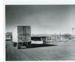
Garrett Truck in compound + 1 copy (1983.63.173)