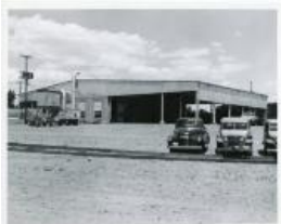
AEC Sampling Plant Expansion site (23 Jul 1956) (1983.63.141)