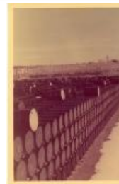
AEC Compound uranium concentrate drum storage (1983.63.35)