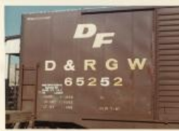
DF car #65252 ready for first load of concentrate to Fernald, Ohio (1983.63.42)