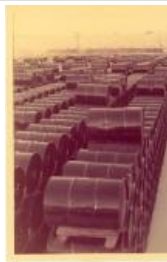
Drum storage at AEC (1983.63.26)