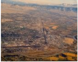
GJ aerial 1992-93 (2008.24.2)