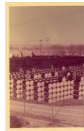
Rows of drums looking North (1983.63.39)