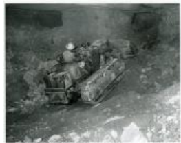
Frontend type tractor loader in large open stope of uranium mine (1983.63.179)