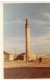
Stack standing with buildings (1983.63.51)