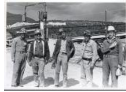
North Alice Mine Photograph (1981.267.2)