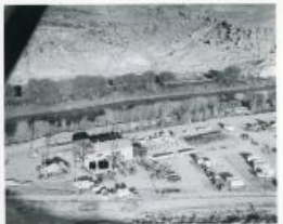
Aerial view AEC Compound South end of compound (1983.63.130)