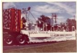
AEC Float in Foresight Parade (18 May 1963) (1983.63.213)