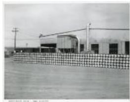
Concentrate drums Grand Junction Compound