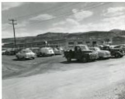
Grand Junction Compound paving parking lot (9 July 1957) (1983.63.107)