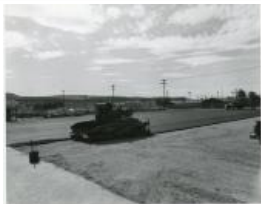
Grand Junction Compound paving parking lot (9 July 1957) (1983.63.106)