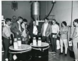
High school science students view "yellow cake jars" (1983.63.150)