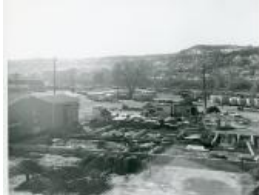
AEC Compound with trailer houses (1983.63.98)