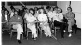
1977 awards attendees (2008.24.27)