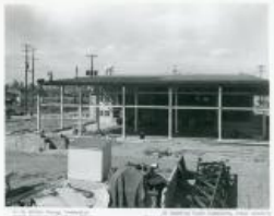
Starting construction SS Sampling plant expansion south dock showing new concrete slab (4 Sep 1956) (1983.63.145)