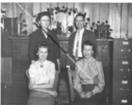
DOE employees (2008.24.16)