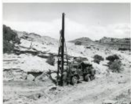
Exploratory drilling for uranium with truck-mounted pneumatic percussion drill (1983.63.189)