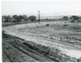
Gunnison Bridge and dike (1983.63.9)