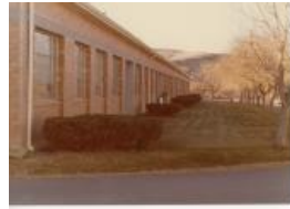
Lucius Pitkin Mining Division Building (1983.63.222)