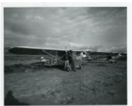
Two survey single engine airplanes on ground AEC Section at Walker Field, Grand Junction, CO +1 copy (1983.63.193)