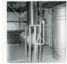
Tank in AS & R Co. Laboratory (Photo) (1983.63.69)