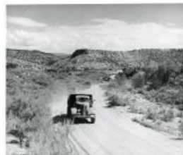
Dump Truck (1983.63.94)