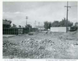
Getting sampling plant expansion slab area ready for pour (1983.63.146)