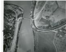
Air view of Gunnison Bridge (1983.63.8)