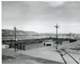
Overall view of vanadium storage looking Northwest (18 Feb 1958) (1983.63.156)