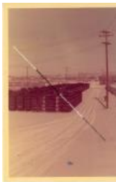
Drums in snow (1983.63.37)