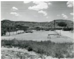
Grand Junction Compound parking lot prior to black topping (18 June 1957) [Duplicate] [Duplicate] [Duplicate] (1983.63.105)