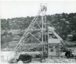
Steel headframe and ore bins at Colorado Plateau. Vertical Shaft operations. (1983.63.176)