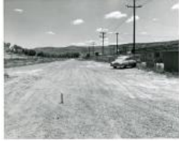
Grand Junction Compound parking lot prior to black topping (18 June 1957) [Duplicate] (1983.63.103)