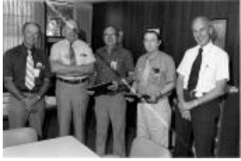
1977 award group (2008.24.30)