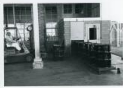
"Last Load" drums on pallet - + 1 copy (1983.63.169)