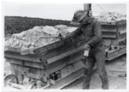
North Alice Mine Photograph (1981.267.4)