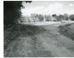
Gunnison River Bridge and dike (Black Bridge) (1983.63.17)