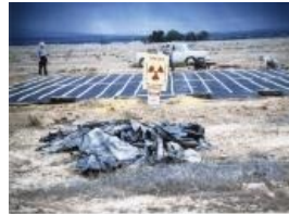
AEC uranium ore test anomaly at Walker Field Airport [Negative] (1983.63.77)