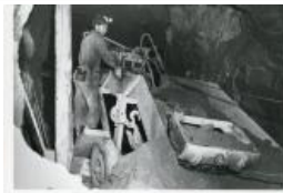
Man operating drag buckets in a mine (Photo) (1983.63.75)