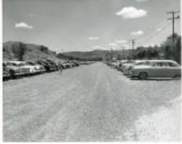
Grand Junction Compound parking lot prior to black topping (18 June 1957) (1983.63.101)