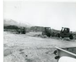
Yard of Government ore-buying station at Monticello, Utah (1983.63.184)