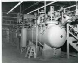
Alkaline Leach Autoclave - Pilot Plant, Grand Junction (1983.63.136)