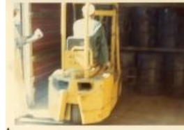
Finishing loading of car for shipment to Fernald, Ohio (1983.63.44)