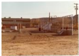
Loading docks [Duplicate] (1983.63.224)