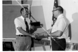
1977 award ceremony (2008.24.21)