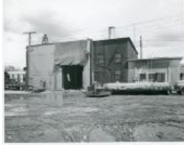
AEC Heating Plant (May 1957) (1983.63.125)