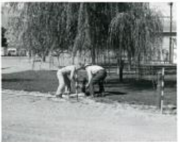
AEC Fire Hydrant (Oct 1957) (1983.63.127)