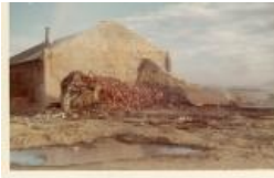
Large pile of rubble (Photo) (1983.63.59)