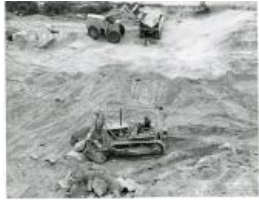
Loader loading rock into truck (1983.63.15)