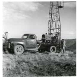
Johnson and Youran Drilling Co., Naturita, CO Drilling rig (1983.63.96)