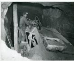
In Colorado Plateau Uranium Mine, scraping up ore on moveable scraper loading slide into mine car (1983.63.175)