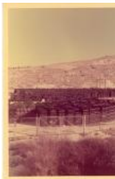
View of drums from dike (1983.63.33)