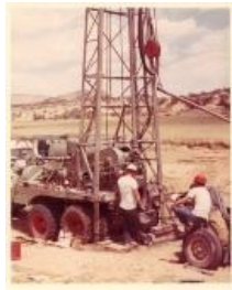
Uranium Drilling closeup (Photo) (1983.63.87)