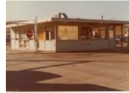
South Gate building and gate (1983.63.227)