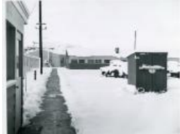
Snow storm at AEC Compound Grd. Jct. (1983.63.120)