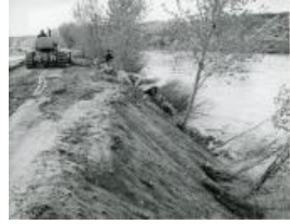
Photo of CAT Bulldozer working on dike along Gunnison River (1983.63.3)