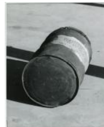
A typical old drum found to be corroded to the point it was leaking (18 Feb 1958) (1983.63.162)