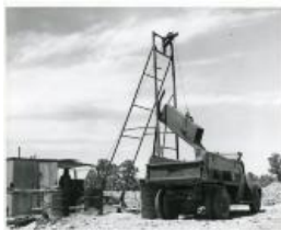
Headframe and skip hoist at small uranium mine. This is an inclined shaft mine. (1983.63.187)