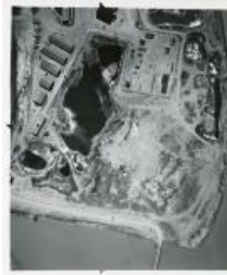
Aerial view of AEC Compound (1983.63.18)