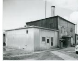
AEC Electric Shop (May 1957) (1983.63.126)