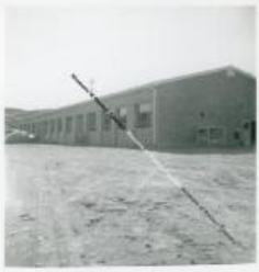
Outside of building AEC (Photo) (1983.63.68)