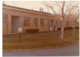
Lucius Pitkin Mining Division Building (1983.63.221)