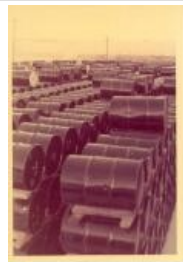
Drum storage at AEC (1983.63.27)