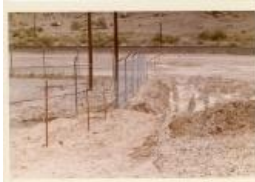
Chain link fence Southeast end + negative (1983.63.200)