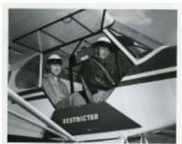
Two men in open restricted airplane (1983.63.194)