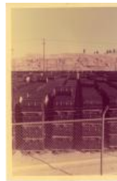
Rows of drums looking East (1983.63.38)