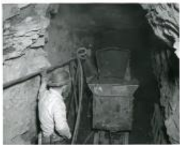
Loading car in uranium mine. Scoop dumping ore into car in part of a mechanical loader operated on compressed air brought into the mine by the pipe at left. (1983.63.178)