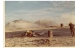
Stack down lots of dust (Photo) (1983.63.56)