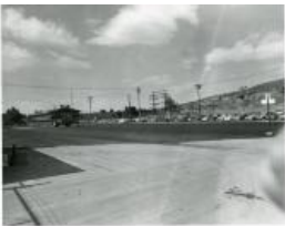
Grand Junction Compound paving parking lot (9 July 1957) [Duplicate] [Duplicate] (1983.63.109)