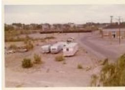
Trailers with drums in background + negative (1983.63.208)