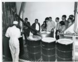
Students observed taking a sample of Uranium concentrate from metal drum (1983.63.153)