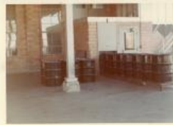
Interior of building with last drums from U3 08 (1983.63.20)