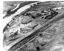
AEC Compound 1960s (2008.24.3)