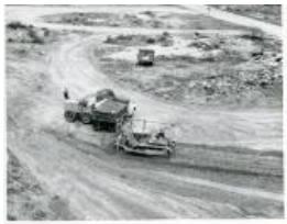
Loading fill for dike across road from AEC compound (1983.63.11)