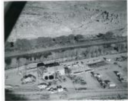
Aerial view AEC Compound looking West (1983.63.129)