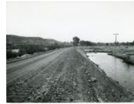
Dike along Gunnison River (1983.63.6)