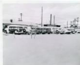
Snow storm at AEC Compound Grd. Jct. Cars covered (1983.63.119)