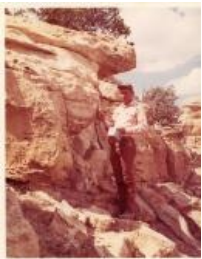
Man looking for uranium (1983.63.76)