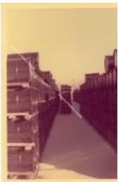
Closeup of drum at AEC (1983.63.32)