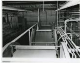
Pilot Plant - Grand Junction (1983.63.132)