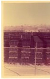
Rows of drums looking Northeast (1983.63.40)