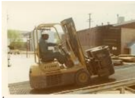
Rio Grande DF car being loaded with Hyster (1983.63.46)