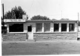
GJ AEC Office (2008.24.4)