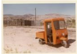
Three wheeler in front of RR Track and drums + negative (1983.63.203)