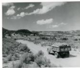
Dump truck, ore load (1983.63.91)