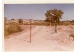
Barbwire across dike + negative (1983.63.201)