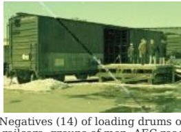
Negatives (14) of loading drums on railcars, groups of men, AEC road signs (1983.63.48)