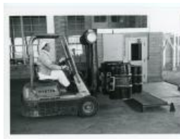
Last load forklift moving drums - + 1 (1983.63.166)