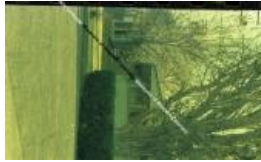
Negatives: 13 strips (1-49) (1983.63.237)