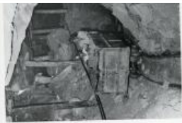
Two men with ore cart in a mine (1983.63.72)