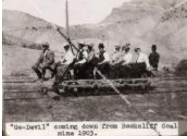
Passengers on the Go Devil (1982.0.20)