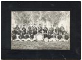
Teller Institute Band (F473.2)