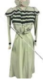
2 piece dress with detachable collar (1982.220.17)