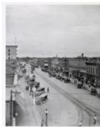
Photograph of Downtown Grand Junction (F827.2)