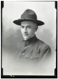
Portrait of a Soldier (2023.40.33)