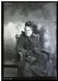
Portrait of an Older Woman (2023.40.29)