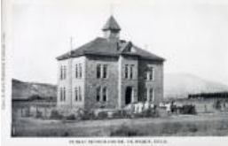
de Beque Public Schoolhouse (2022.25.1)