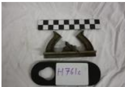
Woodworkers Plane (H761C)