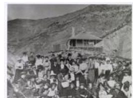
Carpenter excursion (F515.3)