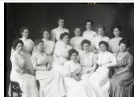
Group of ladies portrait (2023.40.6)