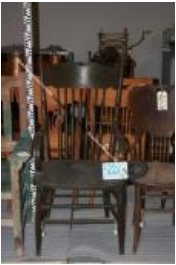
IOOF Chair (1983.162.4)