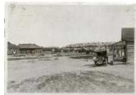
Photo of log structures with automobile (1990.8.21)