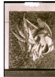
Trout from Cebolla, CO (2023.40.28)