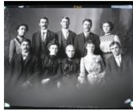
Portrait of a family (2023.40.12)