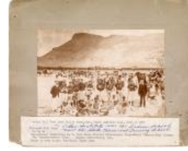
Photograph of Teller Institute Baseball Team vs Palisade (1979.23.12)