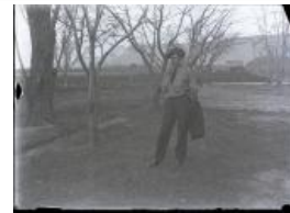
Woman dressed androgynously (2023.40.43)