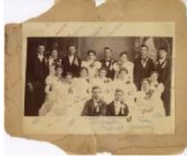
Washington Friends Academy (1982.202.9)