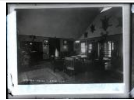
Interior of the Uintah Hotel (2023.40.47)