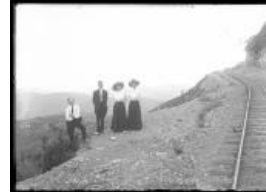
Group near tracks on Baxter Pass (2023.40.51)