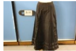
Lady's Petticoat (B121)