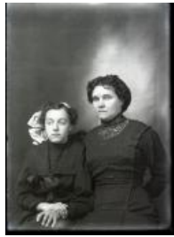
Portrait of Mother and Daughter (2023.40.34)