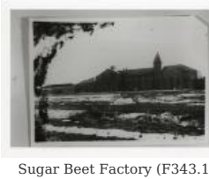
Sugar Beet Factory (F343.1)