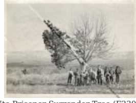
Ute Prisoner Surrender Tree (F230.1)