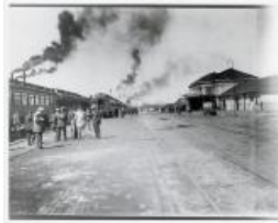
Grand Junction Railroad Station & Yards, 1900-1920 (F720.57)