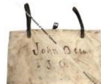
Saddle Bag (1994.25.3)