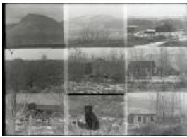
Composite of 9 farm pictures (2023.40.39)