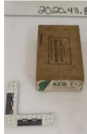
Sensitized Postcard Paper (2020.43.8)