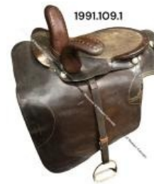
1991.109.1 Sidesaddle (1991.109.1)