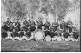
Teller Indian School Band (2006.0076)