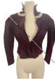
Maroon Blouse (A923)