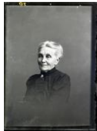
Portrait of an older woman (2023.40.30)