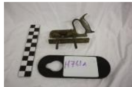
Woodworkers' Plane (H761A)