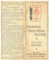
"Interesting Facts about Sugar" (2006.43.4)