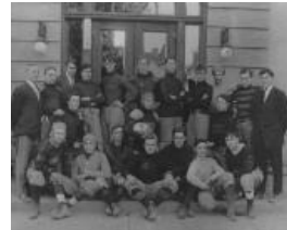
GJHS football team (2004.44.820)