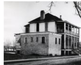
Teller Institute: Old Hospital (1979.66.2)