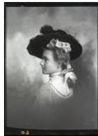
Portrait of a young woman (2023.40.31)