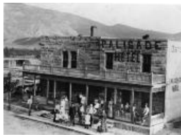
Palisade Hotel (2004.44.908)