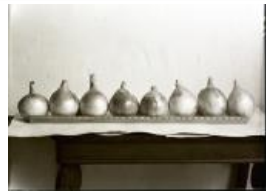
Onions from the Mile High Seed Co. (2023.40.26)