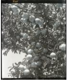
Apple Scene (2023.40.9)