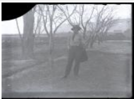
Woman dressed androgynously (2023.40.44)