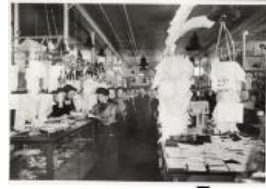
Photo and negative, Interior of the Fair Store (1999.8.35)