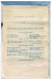
Abstract of Title (2001.49.1)