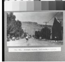
Palisade street scene (1980.115.45)