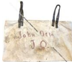
Saddle Bag (1994.25.2)