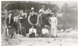
Travelers next to their vehicle (1983.77.52)