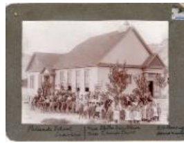
Photo of Palisade School and Students (1979.23.7)