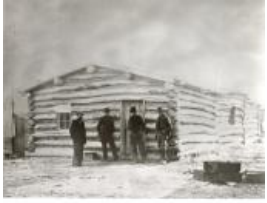
Lowell school / jail (F0520)