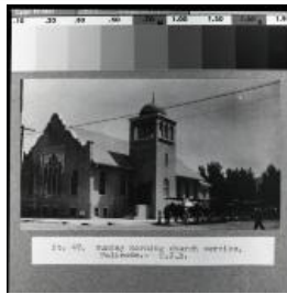
Methodist Church in Palisade (1980.115.47)