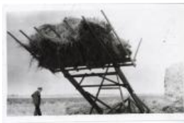
Wheat Stacker (1980.169.1)