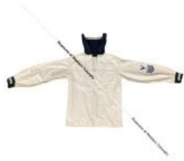
Navy Jacket (2023.42.83)