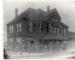
Grand Junction Railroad Station (F720.59)