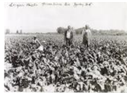
Sugar Beet Field (1980.169.2)