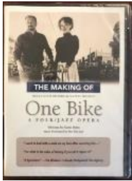
The Making of "One Bike" Opera (2021.22.1)