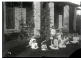
Group of young girls outside of URY office (2023.40.45)