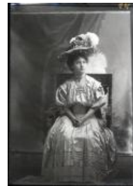
Portrait of a young woman (2023.40.32)