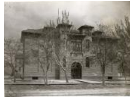
Lowell School (1991.52.5)