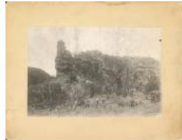
Scene in Unaweep Canyon (2019.16.2)