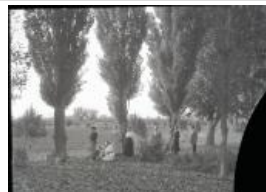
A group of people and their dog (2023.40.7)