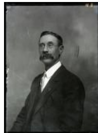
Portrait of an Unidentified Man (2023.40.40)