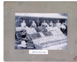
Photo of the John Baisch Fruit Farm Fruit Stand (1979.23.82)