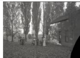
A group of people and their dog (2023.40.8)