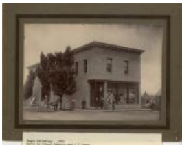
Photo of the Hugus Building in 1903 (1979.23.97)