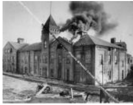
Sugar beet factory (2004.44.771)