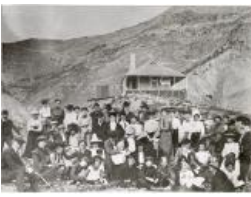
Carpenter excursion (F515.5)