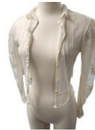
Ladies Blouse (A939.1)