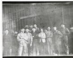
Photo of 16 unidentified individuals (1990.8.23)