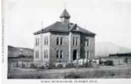
de Beque Public Schoolhouse (2022.25.2)