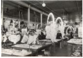
Photo and negative, Interior of the Fair Store (1999.8.34)