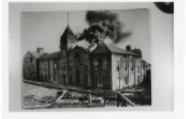
Sugar Beet Factory (F343.2)