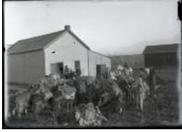
Pack of mules in Mack (2023.40.48)