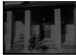
Man with wheelbarrow in front of the Uintah office (2023.40.55)