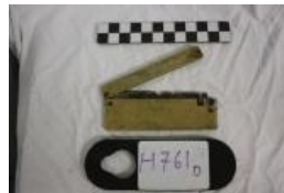
Blade box (H761D)