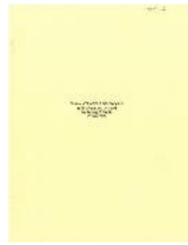
History of the C.D. Smith Company (1997.13.1)