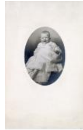
Portrait of a baby (2021.24.37)