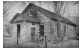
Cardiff School (2004.44.92)