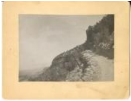
9 Mile Hill in Unaweep (2019.16.1)