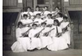
Teller Institute Girls Mandolin Club (F627.1)