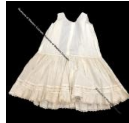
Baby Dress (2014.95.19)