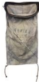
Fowler Picking Sack (CU 1986.40.1)