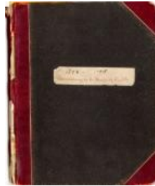
Proceedings of the Board of Health (1983.92.1)