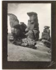
Group in front of large rocks (2021.24.29)