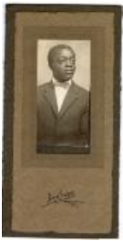
Portrait of an unidentified man (2023.48.21)