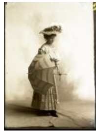
Photo of a young woman (2023.40.25)