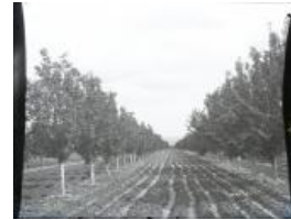
Orchard Scene (2023.40.15)