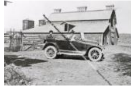
Car outside barn (2HA65)