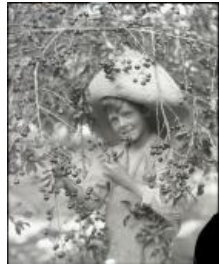
Boy with cherries at Knight's Orchard (2023.40.11)