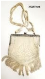
White Purse (X122)