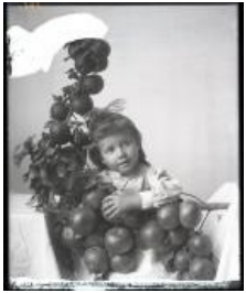
Photo of a girl and her apples (2023.40.10)