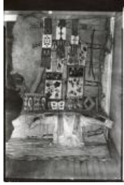
Native American Handmade Artifacts (C557.1)