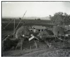
Farm Scene (2023.40.18)