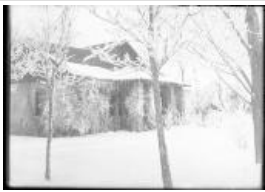
Uintah Railway Office in Winter (2023.40.56)