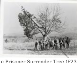
Ute Prisoner Surrender Tree (F230.2)