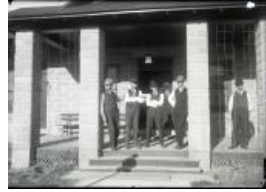
Group of men at the Uintah office (2023.40.49)