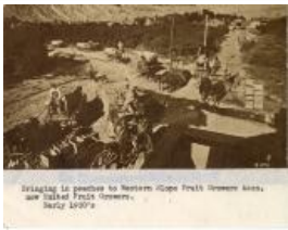
Photo of Farmers Bringing Peaches to Western Slope Fruit Growers Association (1979.23.2)