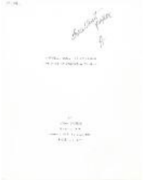
A Canyon, Coal, and A Railroad: The Story of Carpenter, Colorado (1985.114.1)