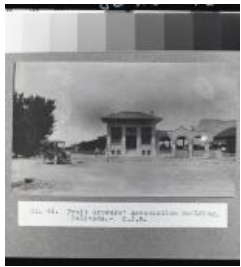
Fruit Growers Association Building in Palisade (1980.115.46)