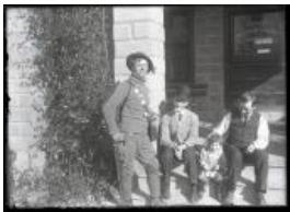
Austrian Man outside Uintah Railway Company (2023.40.52)