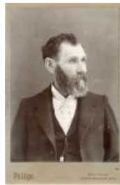
Judge Joseph Ong Portrait (2018.113)