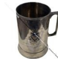
Memorabilia Mug (2023.30.14)