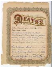
Deaths and Memoranda page from the Butler Family Bible (2023.48.27)