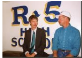
R-5 High School Staff (2004.44.290)