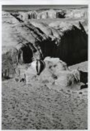
Hot Air Balloon in Desert (2019.63.4)