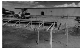
The Daily Sentinel (2004.44.677)