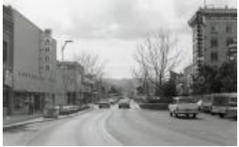
5th & Main Looking West (F380.7)