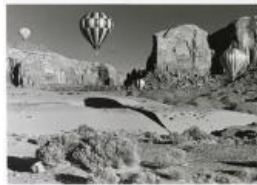
Hot Air Balloons in Bluff Utah (2019.63.2)