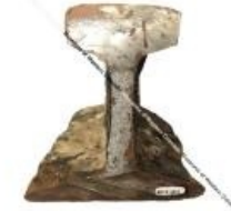
Trolley Tie (2019.65.2)