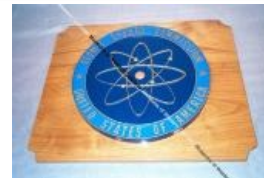
AEC Seal Sign (2002.18.1)