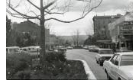
6th & Main Looking West, by Mesa Theater (F380.6)