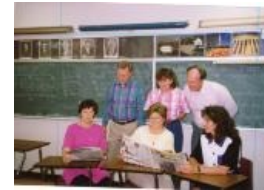
Palisade High School Staff (2004.44.272)