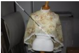
Gown and Cape (1991.57.1)