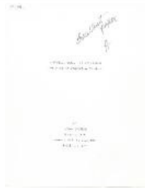
A Canyon, Coal, and A Railroad: The Story of Carpenter, Colorado (1985.114.1)