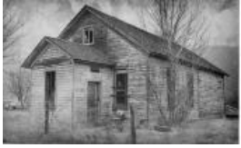
Cardiff School (2004.44.92)