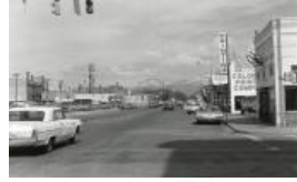
5th & Colorado Looking East (F380.5)