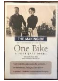
The Making of "One Bike" Opera (2021.22.1)