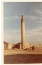
Stack standing with buildings (1983.63.51)