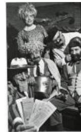
Lions Club Carnies Posing for Photo (1979.116.8)