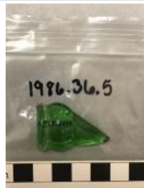
Kerosene Lamp Chimney Fragment (1986.36.5)