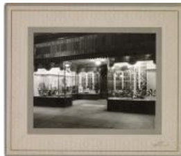
Exterior of Benges's Shoestore (2021.24.6)