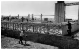
The Daily Sentinel (2004.44.687)