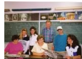
Palisade High School Staff (2004.44.276)