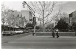
6th & Main Looking East (F380.1)