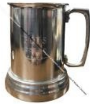
Grand Junction High School Memorabilia Mugs (2022.66.1)