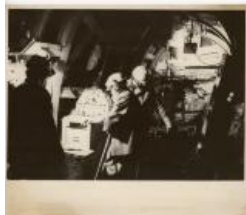
Eisenhower Tunnel (2004.44.169)