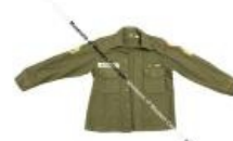
Army Jacket (2023.30.29)