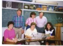
Palisade High School Staff (2004.44.265)