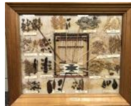
Natural Dye Chart (2022.80.1)