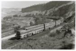
California Zephyr, Denver & Rio Grande Western Railroad (1979.99.1)