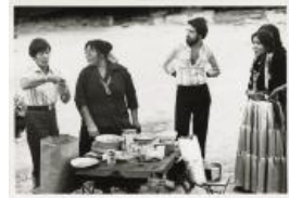
Learning to make Navajo Fry Bread (2019.63.5)