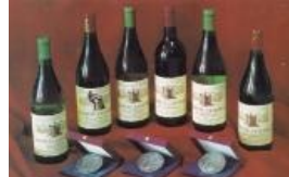
Wine Bottles and Medals (2005.49.35)