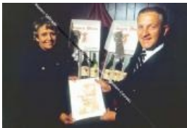
Ivancies and a Certificate (2005.49.40)