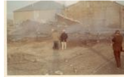
Stack down on ground (Photo) (1983.63.57)