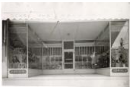
Exterior of the Benges's Shoe store (2021.24.11)