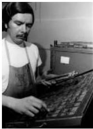
The Daily Sentinel Worker (2004.44.614)