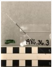
Glass Fragment (1986.36.3)