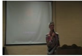
Enstrom Candy Company History (2763.2016)