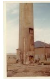
Climax uranium stack demolition 24 Nov 1970 (old sugar factory area) (1983.63.49)