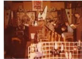
Interior of Benges's Shoe Store (2021.24.82)