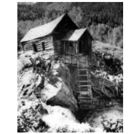
Crystall Mill (2004.44.91)