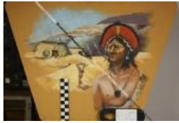
Fremont Village (1980.0.31)