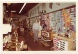
Man in Benges's shoe store (2021.24.77)