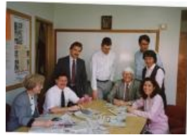
Palisade High School Staff (2004.44.270)