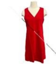
Red Velvet Dress (1999.55.36)