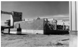
The Daily Sentinel (2004.44.693)