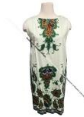
Green Paisley Dress (1999.55.39)