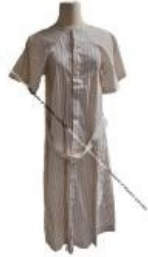
Nurse's Dress (X50.1)