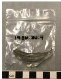
Glass Jar Fragment (1986.36.4)