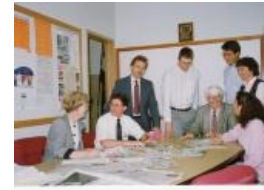
Palisade High School Staff (2004.44.268)