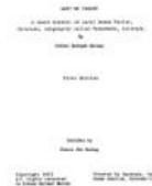
Lest We Forget: A Short History of Early Grand Valley, Colorado, Originally Called Parachute, Colorado

William Chenoweth Collection 1982 14 folders Newspaper Clippings [Duplicate] (1982.171.126)