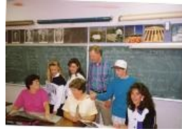
Palisade High School Staff (2004.44.273)