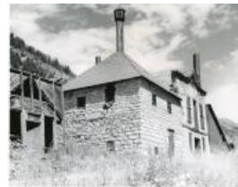
Telluride Brewery (2004.44.90)