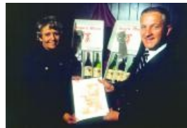
Ivancies and a Certificate (2005.49.41)