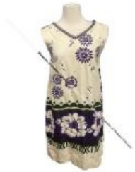
Hawaiian Dress (1999.55.37)