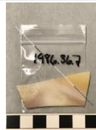
Stained Glass Fragment (1986.36.7)