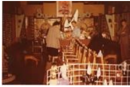
Shoppers in Benges shoe store (2021.24.83)