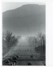
Patterson Road (2004.44.179)