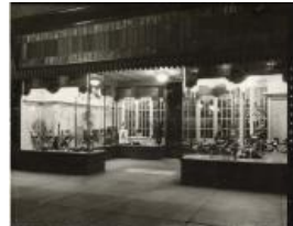
Exterior of Benges's Shoestore (2021.24.8)