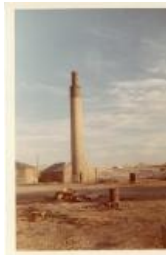
Start blasting (1983.63.52)