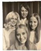
Photo of four unidentified women (2023.7.39)