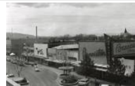
6th & Main Looking North (F380.2)