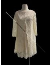
1960s Cocktail Dress or Evening Gown (1989.21.20)