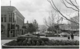
6th & Main Looking West (F380.3)