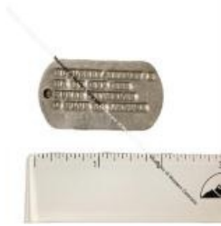
Dog Tag (2023.30.15)