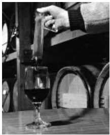
A Glass of Wine (2005.49.44)