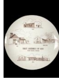
First Assembly of God Church Plate (1995.102.1)

Economics of Nuclear Stimulation, Geonuclear letter, Uranium Ore and Concentrate sampling, mining abstracts (1994.3.1)