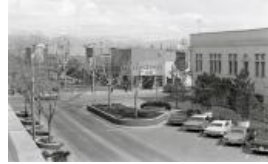
4th & Main Looking East (F380.4)