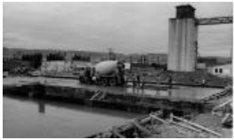
The Daily Sentinel (2004.44.683)