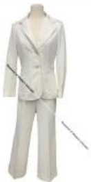
White Pants Suit (1999.55.42)