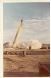
Stack starting to fall (Photo) (1983.63.54)