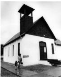
Handy Chapel (2004.44.100)