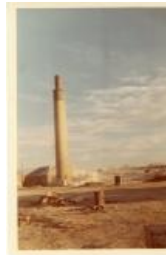
Blasting (Photo) (1983.63.53)