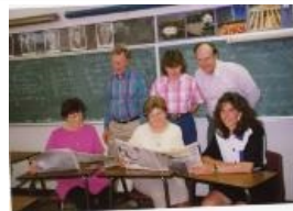
Palisade High School Staff (2004.44.274)