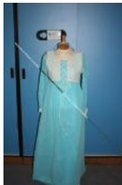
Prairie Style Gown (1991.57.6)