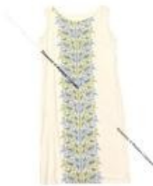
Green and Blue Paisley Dress (1999.55.38)