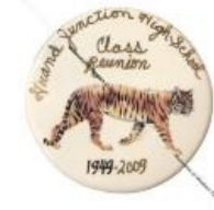
GJHS Class Reunion Magnet (2022.66.3)