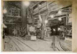
Eisenhower Tunnel (2004.44.171)