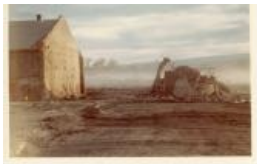
Stack base in pile, building (Photo) (1983.63.58)