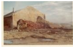
Large pile of rubble (Photo) (1983.63.59)