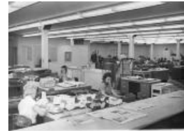
The Daily Sentinel Office (2004.44.611)