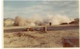
Stack down (Photo) (1983.63.55)