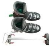
Ski Boot (1990.33.5)