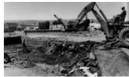
The Daily Sentinel Under Construction (2004.44.676)