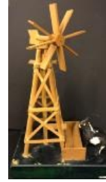
Windmill Carving (1989.53.42)