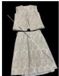
Paisley Vest & Skirt Combo (1984.57.2)