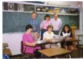
Palisade High School Staff (2004.44.275)