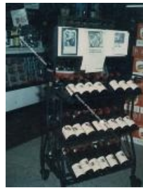
Wine Display (2005.49.42)