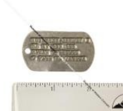
Dog Tag (2023.30.16)