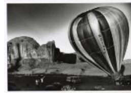
Hot Air Balloon Taking Flight (2019.63.3)