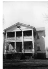
House in Pine Creek Township (1983.55.5)