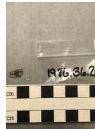
Glass Fragments (1986.36.2)