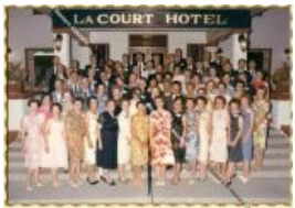
La Court Hotel (2009.30.4)