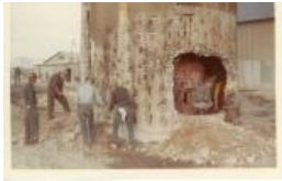
Base of stack (1983.63.50)