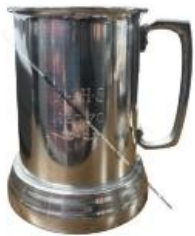
Grand Junction High School Memorabilia Mugs (2022.66.2)