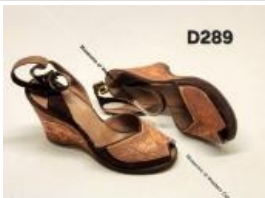
Tooled Leather Sandals (D289)