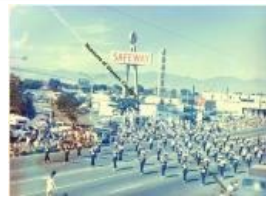
GJ High Band at Days of '47 Parade (1997.62.1)

GJ High Band at Days of '47 Parade [Duplicate] (1997.62.11)