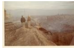
Mill site looking East (Photo) (1983.63.61)