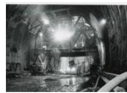
Eisenhower tunnel (2004.44.170)