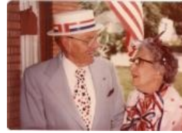
Wayne Aspinall and his wife (1982.135.4)