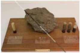
Climax Uranium Ore Display (2006.127.1)