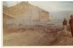
Old Sugar Beet Building (Photo) (1983.63.60)