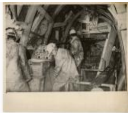
Eisenhower tunnel (2004.44.168)