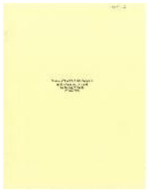
History of the C.D. Smith Company (1997.13.1)