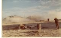
Stack down lots of dust (Photo) (1983.63.56)