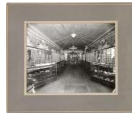
Benge's Shoe Store Interior (2021.24.7)