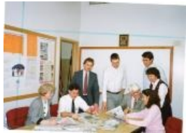
Palisade High School Staff (2004.44.267)