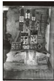
Native American Handmade Artifacts (C557.1)