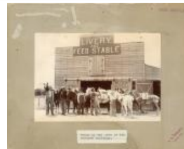
Photograph of a Livery and Feed Stable (1979.23.66)