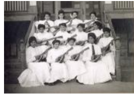
Teller Institute Girls Mandolin Club (F627.1)