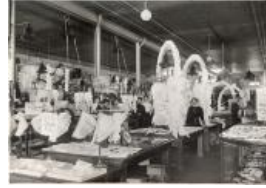
Photo and negative, Interior of the Fair Store (1999.8.34)