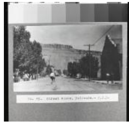
Palisade street scene (1980.115.45)