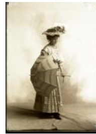
Photo of a young woman (2023.40.25)