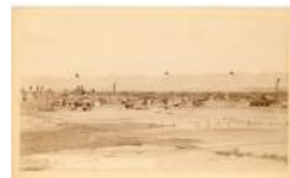
Early day Grand Junction (2004.44.5)