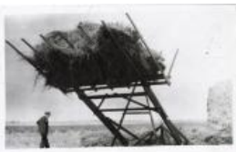
Wheat Stacker (1980.169.1)