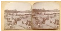
Grand Junction Labor Day Parade, 1902 Stereogram (F196.1)