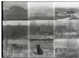
Composite of 9 farm pictures (2023.40.39)