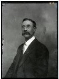
Portrait of an Unidentified Man (2023.40.40)