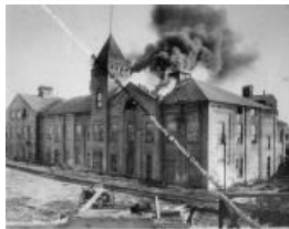
Sugar beet factory (2004.44.771)