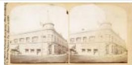
Stereograph of Mesa County Bank (F212.1)