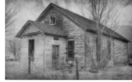
Cardiff School (2004.44.92)