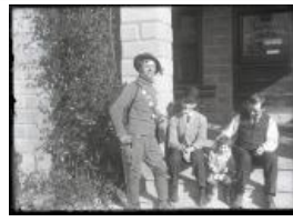
Austrian Man outside Uintah Railway Company (2023.40.52)