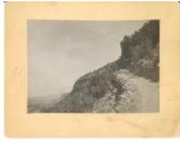
9 Mile Hill in Unaweep (2019.16.1)