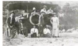
Travelers next to their vehicle (1983.77.52)