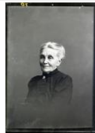
Portrait of an older woman (2023.40.30)