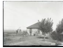
Stewart Cottage, Mack (2023.40.53)