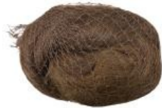
Switch of Hair (2023.42.94)