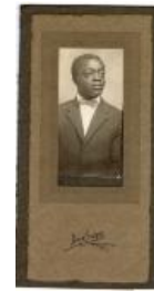
Portrait of an unidentified man (2023.48.21)