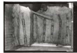
Decorated Hide (C557.2)