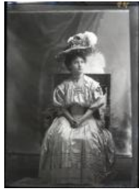
Portrait of a young woman (2023.40.32)