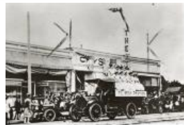
Peach Day Parade (F463.1)