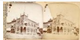
Stereograph of Grand Valley National Bank (F213.2)