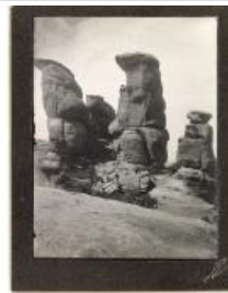
Group in front of large rocks (2021.24.29)