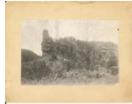
Scene in Unaweep Canyon (2019.16.2)