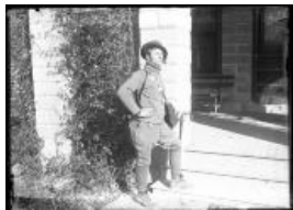
Unnamed Austrian man (2023.40.54)