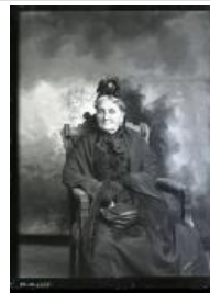
Portrait of an Older Woman (2023.40.29)