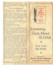
"Interesting Facts about Sugar" (2006.43.4)