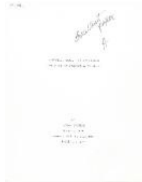
A Canyon, Coal, and A Railroad: The Story of Carpenter, Colorado (1985.114.1)