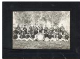
Teller Institute Band (F473.2)