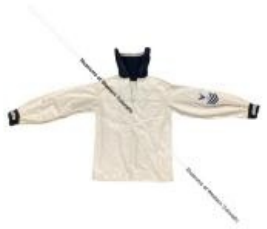
Navy Jacket (2023.42.83)