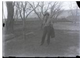
Woman dressed androgynously (2023.40.43)