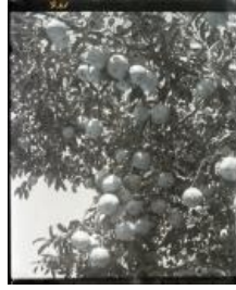
Apple Scene (2023.40.9)