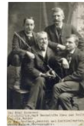
Photograph of the Four Horsemen (2HA17.2)