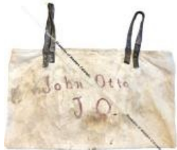
Saddle Bag (1994.25.2)