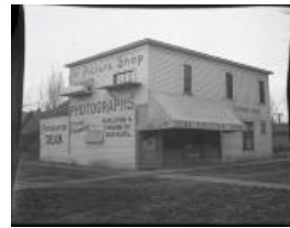
Frank Dean Studio (2023.40.4)