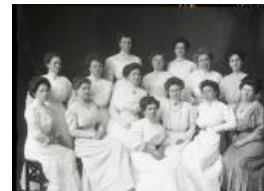
Group of ladies portrait (2023.40.6)