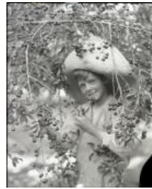
Boy with cherries at Knight's Orchard (2023.40.11)