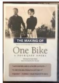
The Making of "One Bike" Opera (2021.22.1)