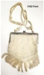
White Purse (X122)