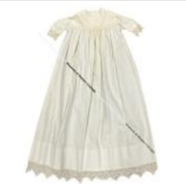
Baby Dress (B497.3)