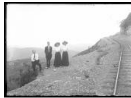
Group near tracks on Baxter Pass (2023.40.51)