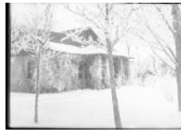
Uintah Railway Office in Winter (2023.40.56)