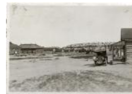
Photo of log structures with automobile (1990.8.21)