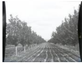
Orchard Scene (2023.40.15)