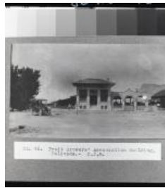
Fruit Growers Association Building in Palisade (1980.115.46)