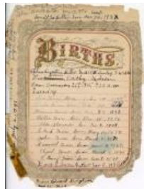
Births and Marriages page from the Butler Family Bible (2023.48.26)