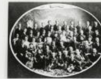
Ross Business College Class Photo (F471.1)