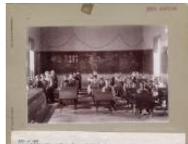
Photo of Palisade Classroom circa 1900 (1979.23.8)