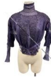
Lady's Blouse (B80)