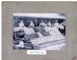
Photo of the John Baisch Fruit Farm Fruit Stand (1979.23.82)