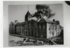
Sugar Beet Factory (F343.2)