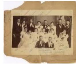
Washington Friends Academy (1982.202.9)