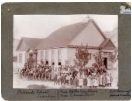
Photo of Palisade School and Students (1979.23.7)