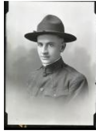
Portrait of a Soldier (2023.40.33)