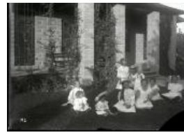
Group of young girls outside of URY office (2023.40.45)