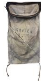
Fowler Picking Sack (CU 1986.40.1)