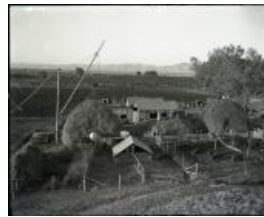
Farm Scene (2023.40.18)