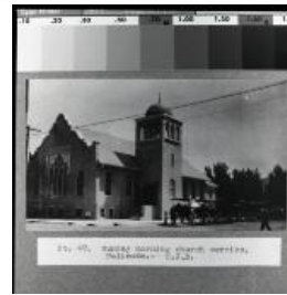
Methodist Church in Palisade (1980.115.47)