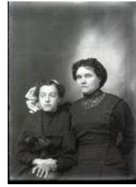
Portrait of Mother and Daughter (2023.40.34)