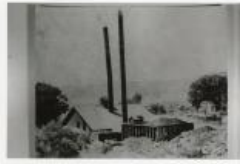
Grand Junction City Pumping Plant, c. 1902 (F521.1)