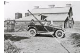
Car outside barn (2HA65)