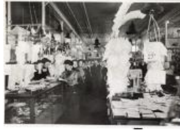
Photo and negative, Interior of the Fair Store (1999.8.35)