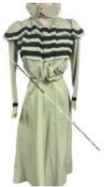
2 piece dress with detachable collar (1982.220.17)