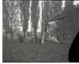
A group of people and their dog (2023.40.8)