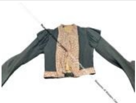
Lady's Blouse (B44)