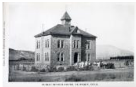
de Beque Public Schoolhouse (2022.25.1)