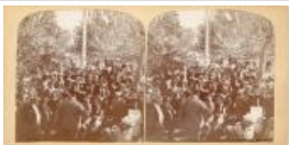
1902 Labor Day Stereogram (F197.1)