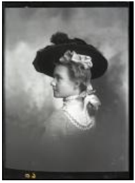
Portrait of a young woman (2023.40.31)