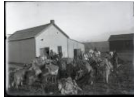
Pack of mules in Mack (2023.40.48)