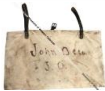
Saddle Bag (1994.25.3)