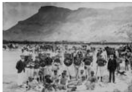
Teller Institute baseball team (2004.44.826)