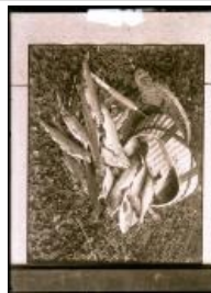
Trout from Cebolla, CO (2023.40.28)