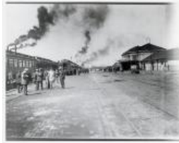
Grand Junction Railroad Station & Yards, 1900-1920 (F720.57)