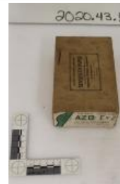
Sensitized Postcard Paper (2020.43.8)