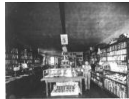
Progress Grocery Interior (2007.57.6)