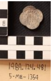
Metal Token. The Tibbs Cigar Co. Grand Junction Colo. (1989.124.481)