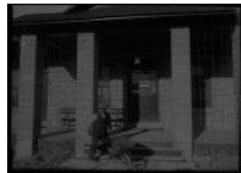
Man with wheelbarrow in front of the Uintah office (2023.40.55)