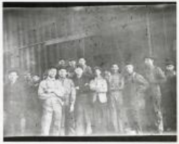
Photo of 16 unidentified individuals (1990.8.23)