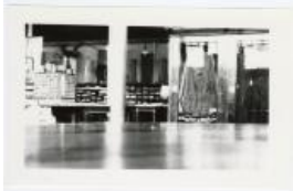
Fair Store Merchandise (1999.8.114)