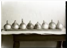
Onions from the Mile High Seed Co. (2023.40.26)