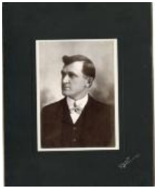
Unidentified man (2021.24.35)