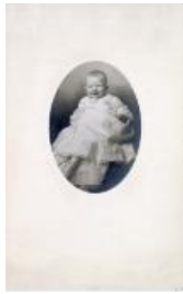
Portrait of a baby (2021.24.37)