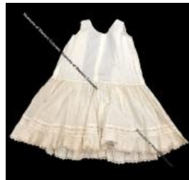
Baby Dress (2014.95.19)