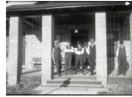
Group of men at the Uintah office (2023.40.49)