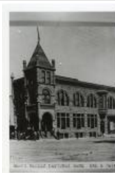
Grand Valley National Bank (F213.1)