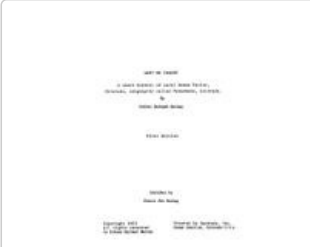
Lest We Forget: A Short History of Early Grand Valley, Colorado, Originally Called Parachute, Colorado