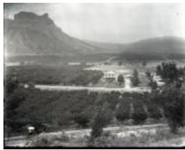
Agriculture Scene of Valley (2023.40.5)