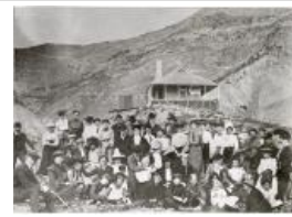
Carpenter excursion (F515.5)