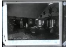
Interior of the Uintah Hotel (2023.40.47)