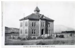
de Beque Public Schoolhouse (2022.25.2)