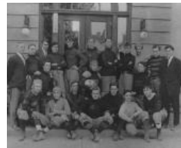
GJHS football team (2004.44.820)