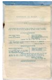
Abstract of Title (2001.49.1)