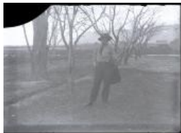
Woman dressed androgynously (2023.40.44)