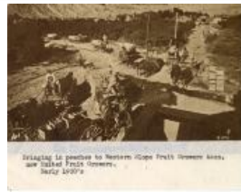
Photo of Farmers Bringing Peaches to Western Slope Fruit Growers Association (1979.23.2)