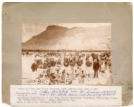
Photograph of Teller Institute Baseball Team vs Palisade (1979.23.12)