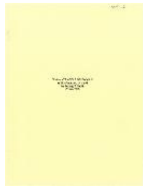
History of the C.D. Smith Company (1997.13.1)