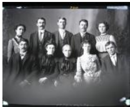
Portrait of a family (2023.40.12)