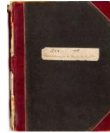
Proceedings of the Board of Health (1983.92.1)