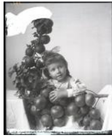
Photo of a girl and her apples (2023.40.10)