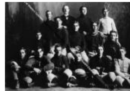
GJHS football team (2004.44.834)