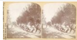
Grand Junction Labor Day Sports, 1902 Stereogram (F196.2)