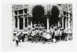
Teller Institute Band in Doorway of Grand Valley National Bank (F473.1)