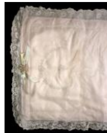
Baby Blanket (2014.95.32)