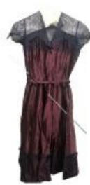
Wine colored dress (2014.95.3)