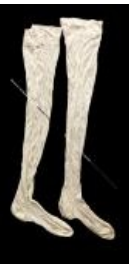
Cream stockings (2014.95.28)