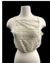
Net corset cover (2014.95.26)