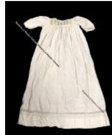
Christening Gown (2014.95.16)