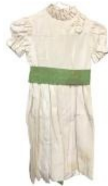
Flower Girl Dress (2014.95.15)