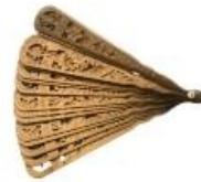
Wooden fan (2014.95.40)