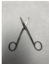
Sewing Scissors (2014.95.54)