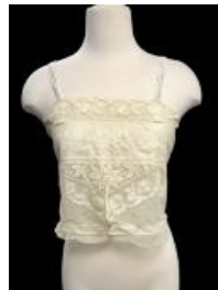
Net Brassiere (2014.95.25)