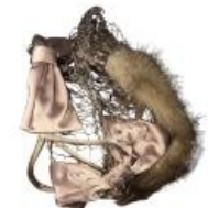
Fur-lined netted headband (2014.95.45)