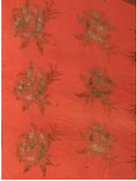
Red Shawl (2014.95.33)