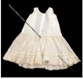
Baby Dress (2014.95.19)