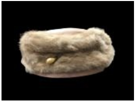
Fur lined hat (2014.95.46)