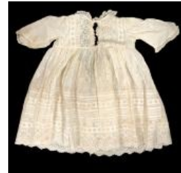
Child's Dress (2014.95.18)