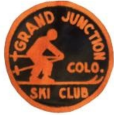
Ski Club Patch (2014.95.35)