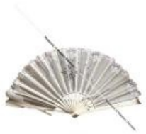
Hand fan (2014.95.42)