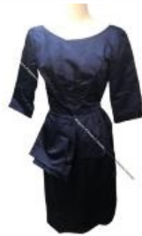
1960 Blue Dress (2014.95.4)