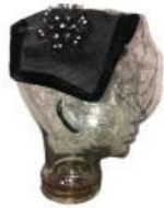
Black hat with net (2014.95.47)