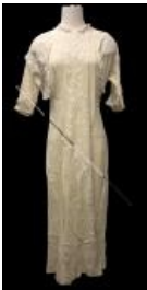
Beige dress (2014.95.1)