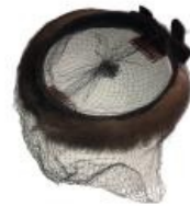
Fur-lined hat (2014.95.44)