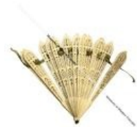
Hand fan (2014.95.41)