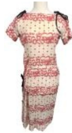
Embroidered dress (2014.95.11)