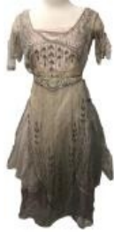
Gray and Pink tulle "Trousseau Dress" (2014.95.2)