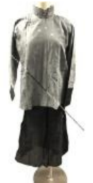
Chinese long shirt or Cheongsam and skirt (2014.95.13)