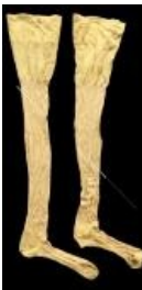
Yellow stockings (2014.95.29)