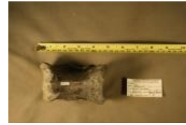
Allosaurus sp. (6711)