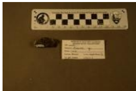
Allosaurus sp. (4234)