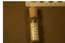
Allosaurus sp. (6660)