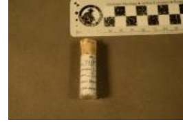
Camarasaurus sp. (7315)