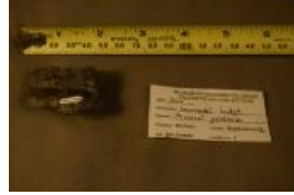
Sauropoda? indet. (7303)