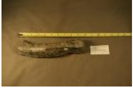
Allosaurus sp. (9357)