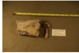
Dinosauria indet. (6519)