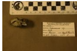
Camarasaurus sp. (4303)