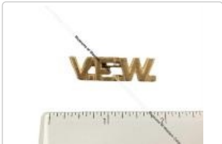
VFW Lapel Pin (2023.30.17)