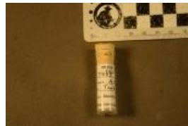
Allosaurus sp. (7333)