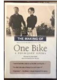
The Making of "One Bike" Opera (2021.22.1)