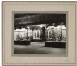
Exterior of Benge's Shoestore (2021.24.6)