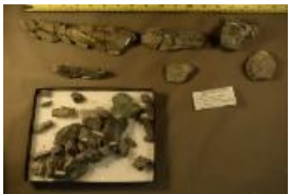
Sauropoda indet. (6646)