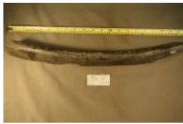
Sauropoda indet. (7398)