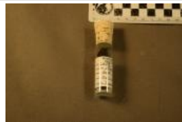
Allosaurus sp. (6658)