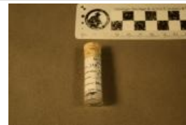
Diplodocidae indet. (7381)