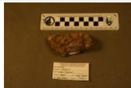
Reptilia indet. (6780)