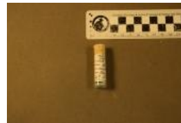
Allosaurus sp. (4313)