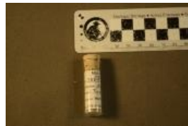
Allosaurus sp. (7334)