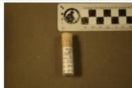
Allosaurus sp. (7359)