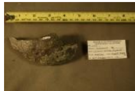
Apatosaurus sp. (6650)