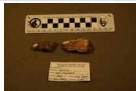
Reptilia indet. (6779)