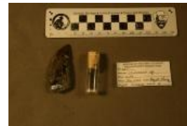
Ceratosaurus sp. (6811)