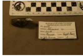
Allosaurus sp. (6699)