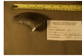
Apatosaurus sp. (7392)