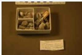
Dryosaurus altus (6510)