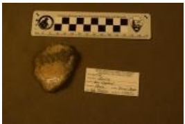
Reptilia indet. (6774)