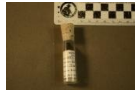
Allosaurus sp. (7357)