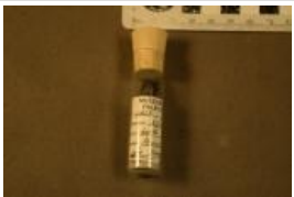
Allosaurus sp. (6813)