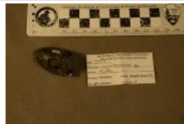
Camarasaurus sp. (7377)