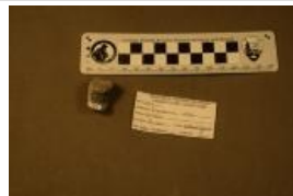
Dryosaurus altus (6514)