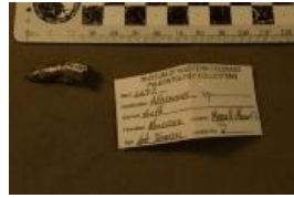
Allosaurus sp. (6697)