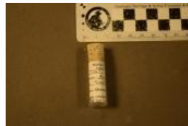
Allosaurus sp. (7367)