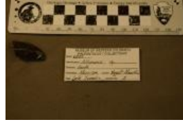
Allosaurus sp.a (6805)