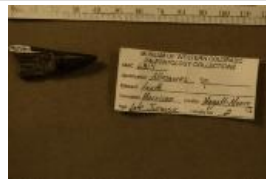
Allosaurus sp. (6815)