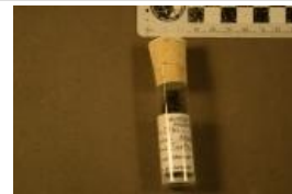
Allosaurus sp. (7361)