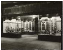
Exterior of Benge's Shoestore (2021.24.8)