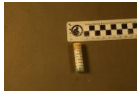
Allosaurus sp. (4305)