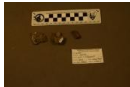
Reptilia indet. (6775)