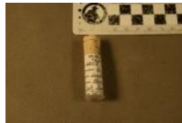
Diplodocus sp. (6809)