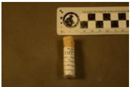
Ceratosaurus sp. (7332)