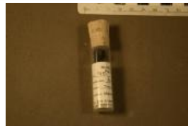
Allosaurus sp. (7351)