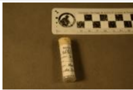
Diplodocidae indet. (8230)