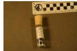
Allosaurus sp. (7369)