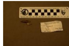
MWC 6777 - Phytosaur tooth (6777)