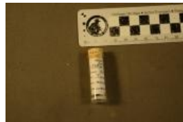
Allosaurus sp. (7356)