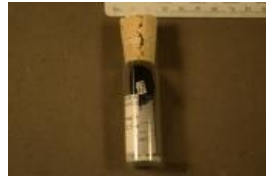
Allosaurus sp. (7363)