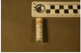
Diplodocidae indet. (7342)