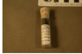
Diplodocidae indet. (7344)