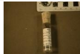
Allosaurus sp. (7341)