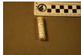
Dryosaurus altus (6515)