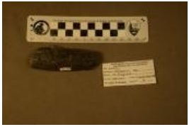
Allosaurus sp. (6663)