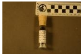
Allosaurus sp. (7340)