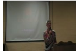
Enstrom Candy Company History (2763.2016)