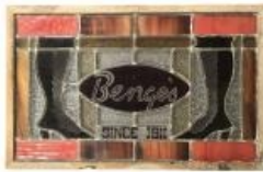
Benge's Stained Glass (2021.24.2)