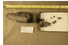
Sauropoda indet. (6652)