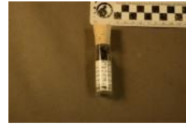
Allosaurus sp. (6603)