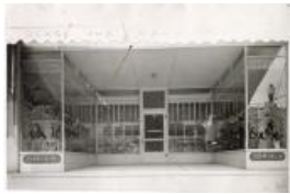
Exterior of the Benge's Shoe store (2021.24.11)