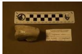
Dryosaurus altus (6511)