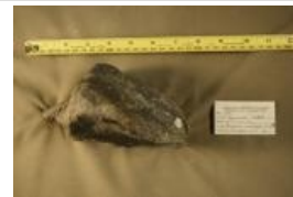
Sauropoda indet. (7281)