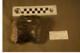
Allosaurus sp. (7304)