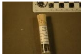
Allosaurus sp. (7360)