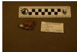
Phytosauridae indet. (6776)