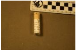
Dryosaurus altus (6518)