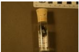
Allosaurus sp. (7358)