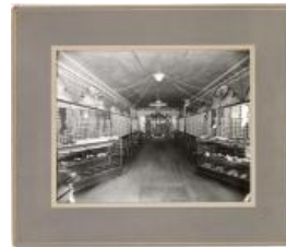
Benge's Shoe Store Interior (2021.24.7)