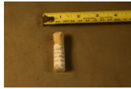
Vertebrata indet. (7387)