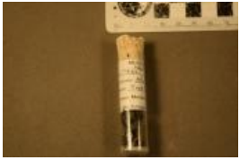
Allosaurus sp. (7362)