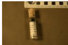
Diplodocus sp. (6659)