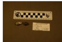
Rauisuchia indet. (6781)