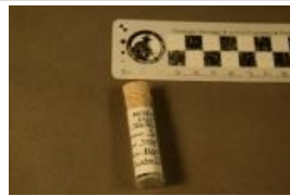
Diplodocidae indet. (8232)