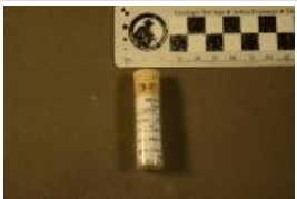
Allosaurus sp. (7370)