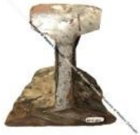
Trolley Tie (2019.65.2)