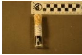
Lingual side of tooth crown after molding. (7364)