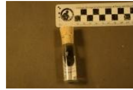
Allosaurus sp. (7365)