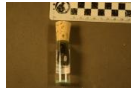
Allosaurus sp. (7335)