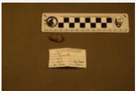
Rauisuchia indet. (6778)