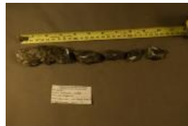
Sauropoda indet. (6649)