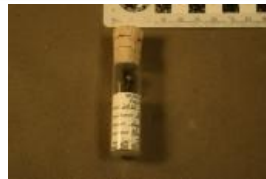
Allosaurus sp. (6810)