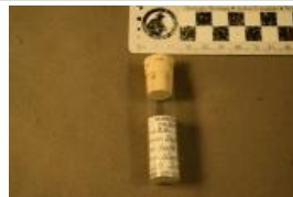
Diplodocus sp. (6816)