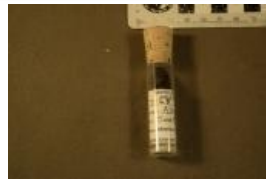
Allosaurus sp. (7368)