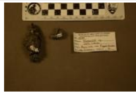
Allosaurus sp. (8233)