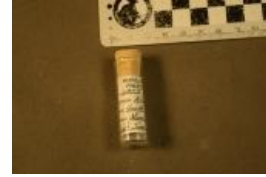
Allosaurus sp. (6807)