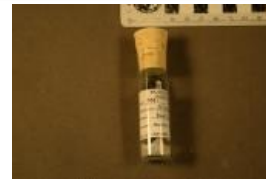
Allosaurus sp. (7991)