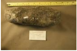
Sauropoda indet. (7300)