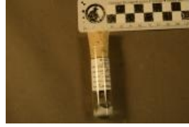
Allosaurus fragilis (950)