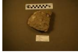
Reptilia indet. (6784)