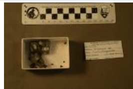
Allosaurus sp. (7374)