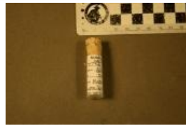
Allosaurus sp. (7732)