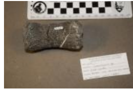
Camarasaurus sp. (6551)