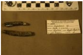
Diplodocus sp. (6808)