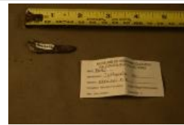
Othnielia sp. (8693)