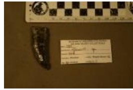
Allosaurus sp. (7385)