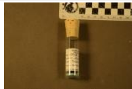
Allosaurus sp. (7338)