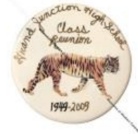
GJHS Class Reunion Magnet (2022.66.3)