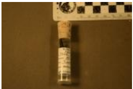
Allosaurus sp. (7366)