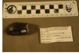
Camarasaurus sp. (7343)