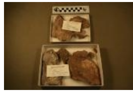
Reptilia indet. (7628)