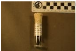
Allosaurus sp. (6657)