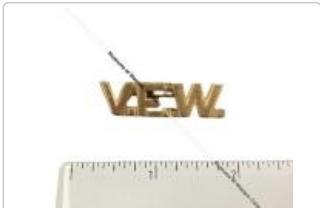
VFW Lapel Pin (2023.30.18)