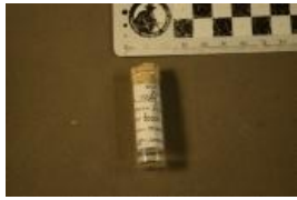
Allosaurus sp. (7384)