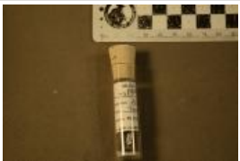
Allosaurus sp. (7337)