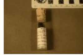
Diplodocidae indet. (7347)