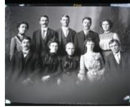
Portrait of a family (2023.40.12)