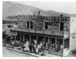
Palisade Hotel (2004.44.908)