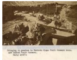
Photo of Farmers Bringing Peaches to Western Slope Fruit Growers Association (1979.23.2)