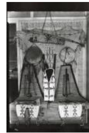
Native American Handmade Artifacts (C557.4)