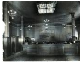
the Daily Sentinel (2004.44.1120)