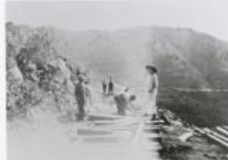
Bridge and building crew. (1987.39.25)