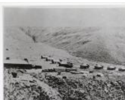
Scene of the town of Atchee, CO with train (1987.39.38)