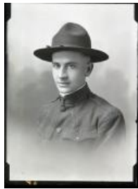
Portrait of a Soldier (2023.40.33)