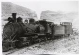
Engine #30 derailed at Rainbow Junction, Utah (1987.39.18)