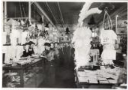
Photo and negative, Interior of the Fair Store (1999.8.35)