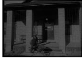
Man with wheelbarrow in front of the Uintah office (2023.40.55)