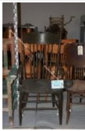
IOOF Chair (1983.162.4)