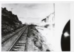
Uintah crossing bridge into Watson, Utah (1987.39.3)