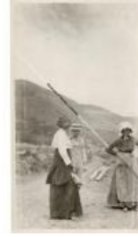
Women and a man outdoors (2007.74.11)