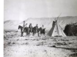
Ute Camping Trip (F347.1)