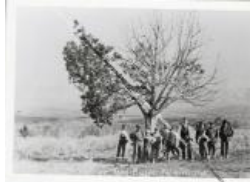
Ute Prisoner Surrender Tree (F230.2)