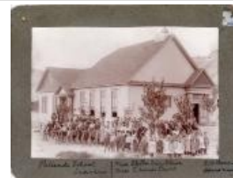
Photo of Palisade School and Students (1979.23.7)