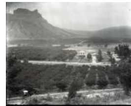
Agriculture Scene of Valley (2023.40.5)