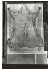
Decorated Hide (C557.3)