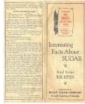
"Interesting Facts about Sugar" (2006.43.4)