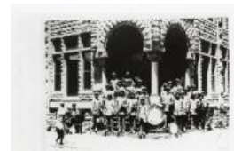
Teller Institute Band in Doorway of Grand Valley National Bank (F473.1)