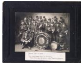
Photo of the First Uniformed Palisade Band (1979.23.13)