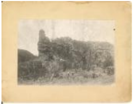
Scene in Unaweep Canyon (2019.16.2)