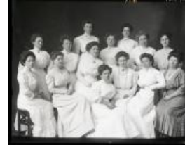
Group of ladies portrait (2023.40.6)