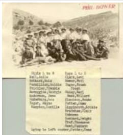
Photo of Palisade Picnic (1979.23.23)