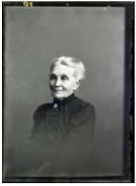
Portrait of an older woman (2023.40.30)