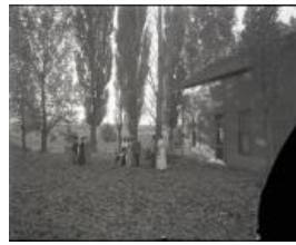
A group of people and their dog (2023.40.8)