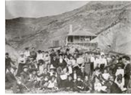
Carpenter excursion (F515.5)