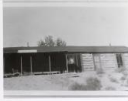
Watson Hotel at Watson, Utah (1987.39.28)