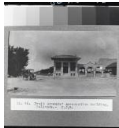
Fruit Growers Association Building in Palisade (1980.115.46)