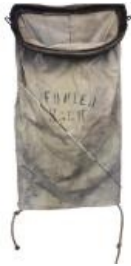
Fowler Picking Sack (CU 1986.40.1)