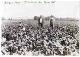
Sugar Beet Field (1980.169.2)