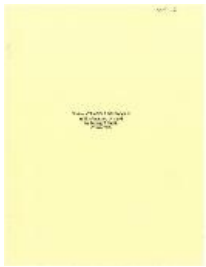
History of the C.D. Smith Company (1997.13.1)