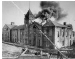
Sugar beet factory (2004.44.771)