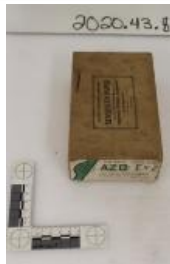
Sensitized Postcard Paper (2020.43.8)