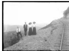
Group near tracks on Baxter Pass (2023.40.51)