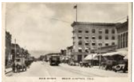
Main Street Postcard (1999.8.40)