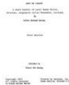
Lest We Forget: A Short History of Early Grand Valley, Colorado, Originally Called Parachute, Colorado