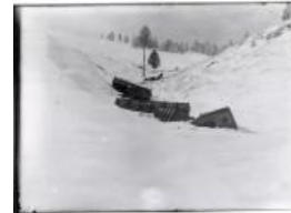
Uintah Train in Snow Wreck (1991.11.8)