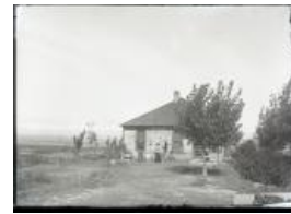
Stewart Cottage, Mack (2023.40.53)