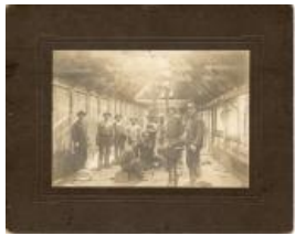
Inside of Carey Salt Plant (E144.7)