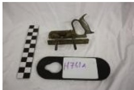
Woodworkers' Plane (H761A)