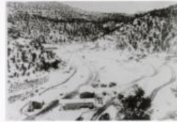
Dragon mine near Dragon, Utah. (1987.39.13)