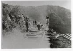
Rebuilding the Tracks (1987.39.24)