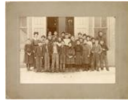
Class Photo of Class, "Fruita 7th Grade" (2019.8.48)