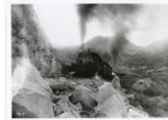
Train descending into Baxter Pass. (1987.39.8)