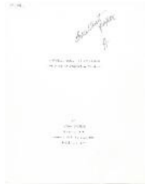
A Canyon, Coal, and A Railroad: The Story of Carpenter, Colorado (1985.114.1)

Marriage Records Mesa County, Colorado (1984.9.1)