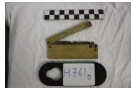
Blade box (H761D)