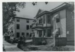
La Court Hotel, c. 1925 (F592.1)