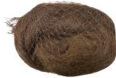
Switch of Hair (2023.42.94)