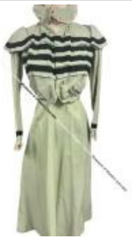
2 piece dress with detachable collar (1982.220.17)