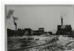
Grand Junction Smelter (F387.1)