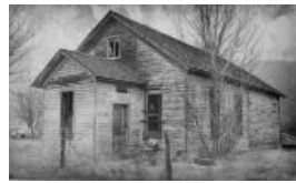
Cardiff School (2004.44.92)