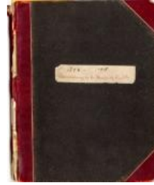
Proceedings of the Board of Health (1983.92.1)