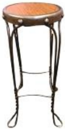
Dean Studio Table (2022.3.1)