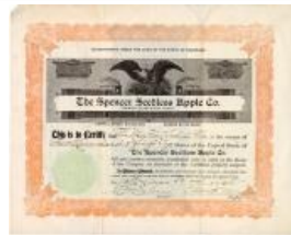
Stock Certificate for the Spencer Seedless Apple Co. (2023.28.1)