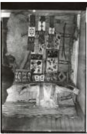
Native American Handmade Artifacts (C557.1)