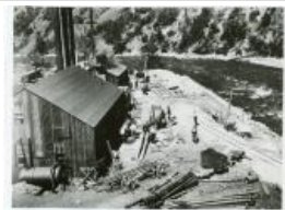
Gunnison Tunnel in Black Canyon (2004.44.81)