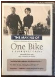
The Making of "One Bike" Opera (2021.22.1)