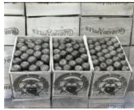
Mt. Lion Apples (2023.40.2)