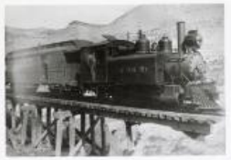
The Uintah Train (1987.39.19)