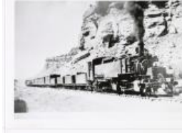
Mallet #51 north of Cooley (1987.39.11)