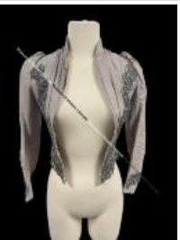
Lady's Blouse (B40)