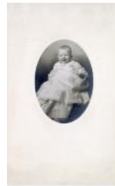
Portrait of a baby (2021.24.37)