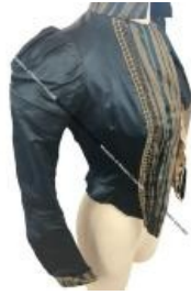
Lady's Bodice (B65)