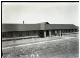
Uintah Hotel, Mack CO (2023.40.50)