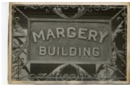
Margery Building (2004.44.98)