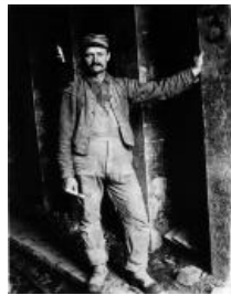
Man in Gunnison Tunnel (2004.44.77)