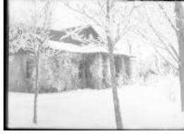
Uintah Railway Office in Winter (2023.40.56)