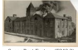
Sugar Beet Factory (F343.3)