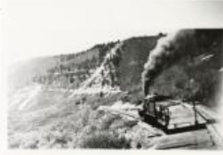
Train ascending Baxter Pass. (1987.39.10)