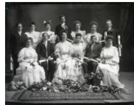
Graduating class of 1905 (GJHS) (2023.40.3)