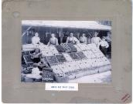
Photo of the John Baisch Fruit Farm Fruit Stand (1979.23.82)