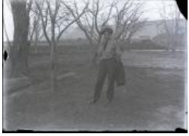
Woman dressed androgynously (2023.40.43)