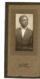
Portrait of an unidentified man (2023.48.21)