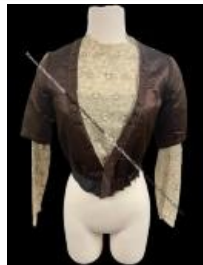
Lady's Blouse (B104)