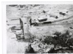
Dragon Mine near Dragon, Utah (1987.39.4)