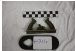
Woodworkers Plane (H761C)