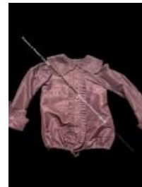
Child's Blouse (B369)