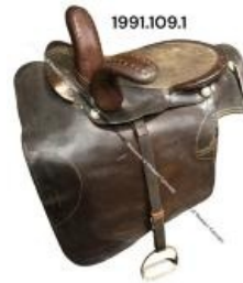
1991.109.1 Sidesaddle (1991.109.1)