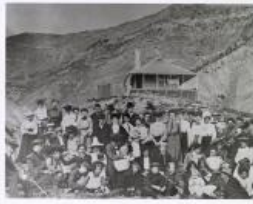
Carpenter excursion (F515.3)