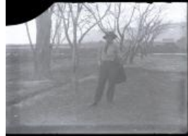
Woman dressed androgynously (2023.40.44)