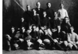
GJHS football team (2004.44.834)