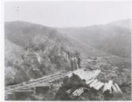
Bridge and building crew of three individuals on Pass. (1987.39.27)