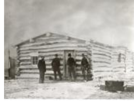
Lowell school / jail (F0520)