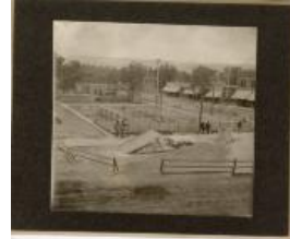
Fair Store Construction (1999.8.37)