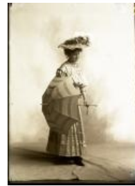
Photo of a young woman (2023.40.25)