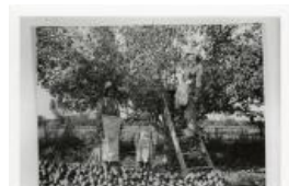
MVB Page Ranch (F460.1)