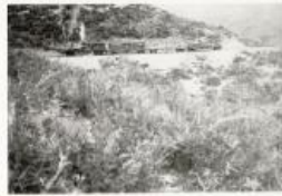
Train traveling between Columbine and McAndrews Lake (1987.39.14)