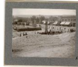
Fair Store Construction (1999.8.38)