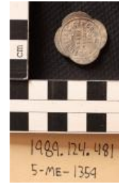
Metal Token. The Tibbs Cigar Co. Grand Junction Colo. (1989.124.481)