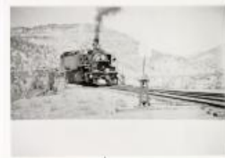
Mallet #51 crossing bridge into Atchee. (1987.39.15)