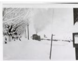
Uintah Train in the snow (1987.39.36)