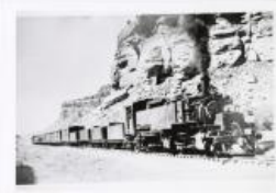
Uintah railroad locomotive (1987.39.2)