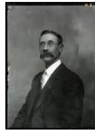
Portrait of an Unidentified Man (2023.40.40)