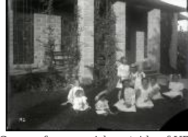
Group of young girls outside of URY office (2023.40.45)