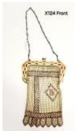
Metal Mesh Purse (X124)