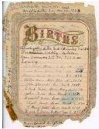
Births and Marriages page from the Butler Family Bible (203.48.26)