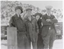
Two couples gathered at Atchee, Colorado. (1987.39.23)