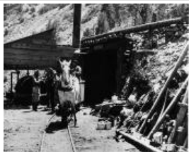
Gunnison Tunnel (2004.44.80)