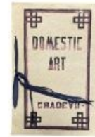
Domestic Art Booklet (2023.42.64)