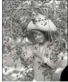
Boy with cherries at Knight's Orchard (2023.40.11)