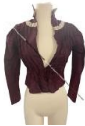
Maroon Blouse (A923)