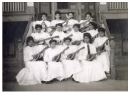
Teller Institute Girls Mandolin Club (F627.1)