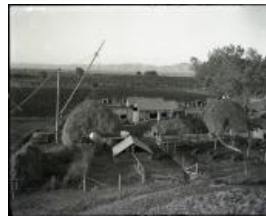
Farm Scene (2023.40.18)