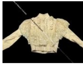
Lady's Blouse (B191)