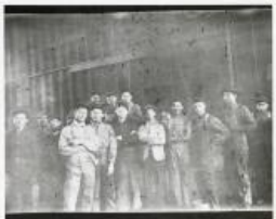
Photo of 16 unidentified individuals (1990.8.23)