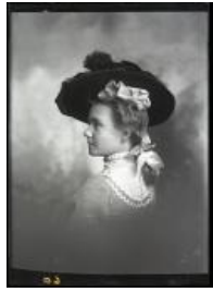
Portrait of a young woman (2023.40.31)