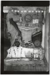
Native American Handmade Artifacts (C557.5)