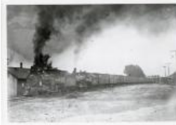
Photo of Colorado Midland ten-wheelers (1990.10.42)