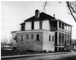
Teller Institute: Old Hospital (1979.66.2)