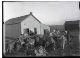
Pack of mules in Mack (2023.40.48)