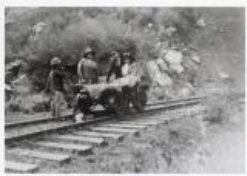
Riding on a hand car (1987.39.46)