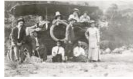
Travelers next to their vehicle (1983.77.52)