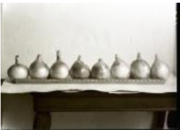
Onions from the Mile High Seed Co. (2023.40.26)