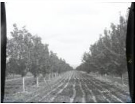
Orchard Scene (2023.40.15)