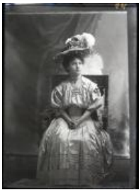
Portrait of a young woman (2023.40.32)