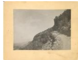
9 Mile Hill in Unaweep (2019.16.1)