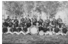
Teller Indian School Band (2006.0076)