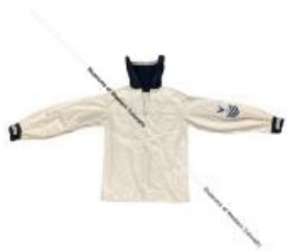
Navy Jacket (2023.42.83)