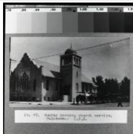
Methodist Church in Palisade (1980.115.47)