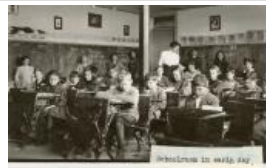
Photograph of Children in a Classroom (1979.23.47)