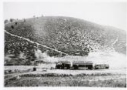
4th of July excursion train. (1987.39.9)