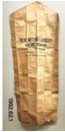
Dry Cleaning Bag (1992.62.1)