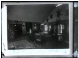
Interior of the Uintah Hotel (2023.40.47)