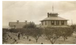
Cross Orchards House, Barn, and Orchards (1980.66.17)