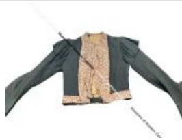
Lady's Blouse (B44)