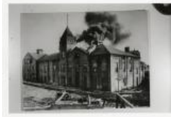
Sugar Beet Factory (F343.2)