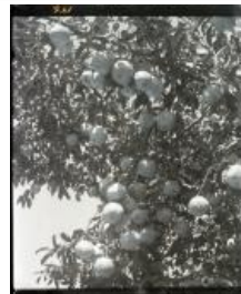
Apple Scene (2023.40.9)