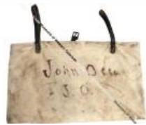
Saddle Bag (1994.25.3)