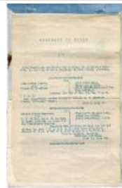
Abstract of Title (2001.49.1)