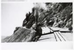
Uintah locomotive climbing 7.5% grade on Baxter Pass. (1987.39.5)