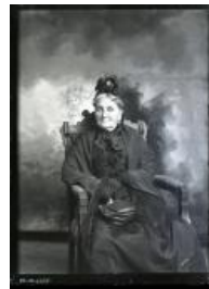
Portrait of an Older Woman (2023.40.29)