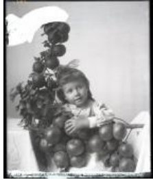
Photo of a girl and her apples (2023.40.10)