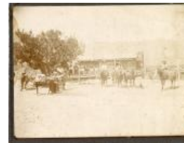
Cowboys in front of Gateway, Colorado (2HA20.2)