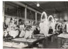
Photo and negative, Interior of the Fair Store (1999.8.34)