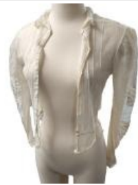
Ladies Blouse (A939.1)