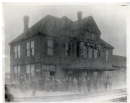
Grand Junction Railroad Station (F720.59)