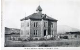
de Beque Public Schoolhouse (2022.25.1)