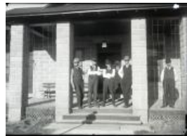
Group of men at the Uintah office (2023.40.49)