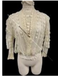
Lady's Blouse (B95L)