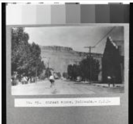
Palisade street scene (1980.115.45)