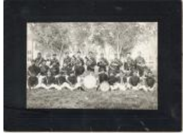
Teller Institute Band (F473.2)