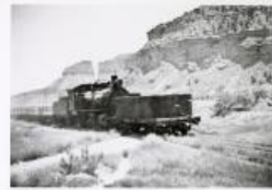
Uintah Railroad (1987.39.1)