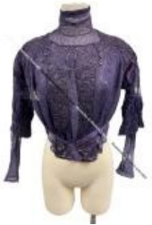
Lady's Blouse (B80)