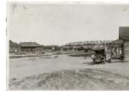
Photo of log structures with automobile (1990.8.21)