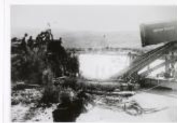
Wreck of engine #10 at bridge 2A. (1987.39.7)