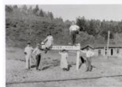
Travelers at Baxter Pass (1987.39.29)