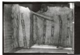
Decorated Hide (C557.2)