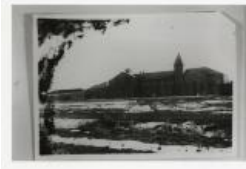
Sugar Beet Factory (F343.1)