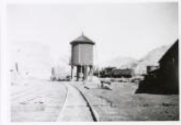
Engine #11 and water cars at Atchee. (1987.39.12)