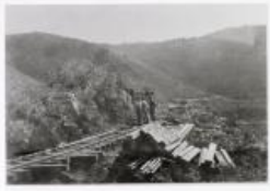
Rebuilding the tracks (1987.39.26)