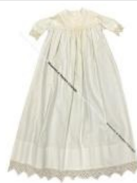
Baby Dress (B497.3)