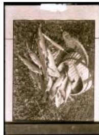
Trout from Cebolla, CO (2023.40.28)