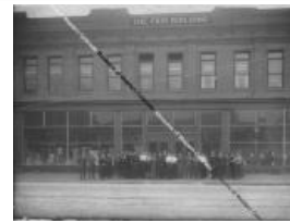
The Fair Building (2004.44.924)