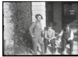
Austrian Man outside Uintah Railway Company (2023.40.52)