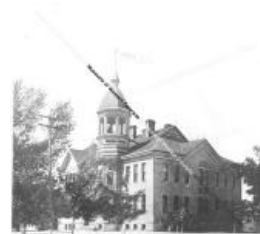
GJ High School 1905 (2008.46.1)