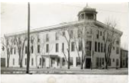
St. Regis Hotel (F366.1)