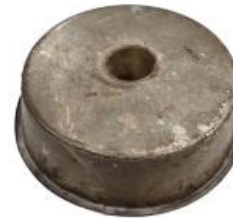
A437 Bundt Cake Pan (A437)