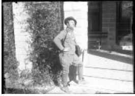
Unnamed Austrian man (2023.40.54)