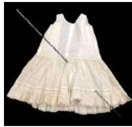
Baby Dress (2014.95.19)