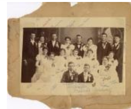
Washington Friends Academy (1982.202.9)