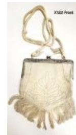
White Purse (X122)