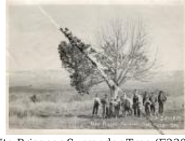
Ute Prisoner Surrender Tree (F230.1)