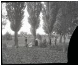
A group of people and their dog (2023.40.7)