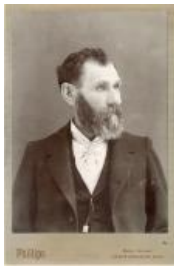
Judge Joseph Ong Portrait (2018.113)