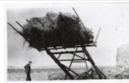
Wheat Stacker (1980.169.1)