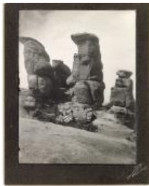
Group in front of large rocks (2021.24.29)