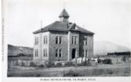
de Beque Public Schoolhouse (2022.25.2)