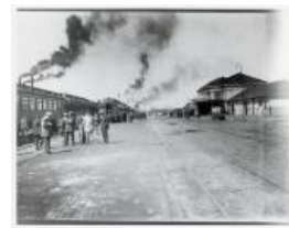
Grand Junction Railroad Station & Yards, 1900-1920 (F720.57)