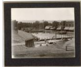
Fair Store Construction (1999.8.36)