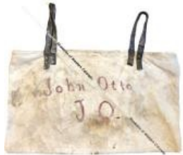
Saddle Bag (1994.25.2)