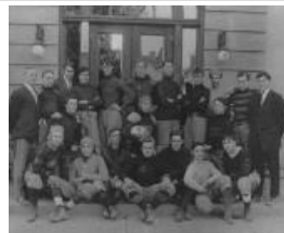
GJHS football team (2004.44.820)