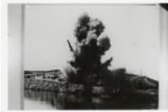
Redlands Canal Construction (F482.1)