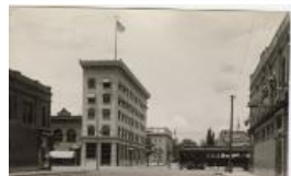
Main Street Postcard (1999.8.41)