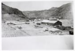
Dragon, Utah (1987.39.17)