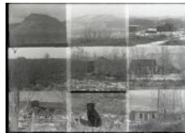
Composite of 9 farm pictures (2023.40.39)