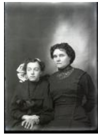
Portrait of Mother and Daughter (2023.40.34)