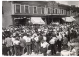
Photo of Street Scene in Front of Jordan's Inn (1979.23.102)