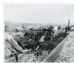
Gunnison Tunnel (2004.44.78)