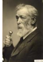
Judge Ong Portrait (F90.1)