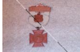
President's Medal (2003.17.5)