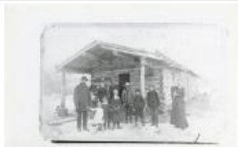
Hurlburt Family, Parachute Creek (1979.31.1)