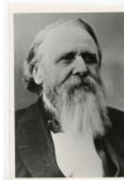
Gov. John Evans between 1814-1897 (2004.44.27)