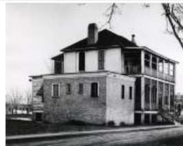
Teller Institute: Old Hospital (1979.66.2)