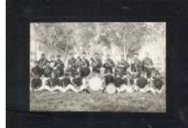
Teller Institute Band (F473.2)