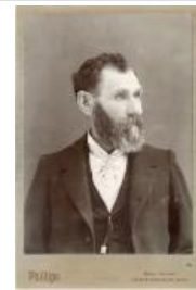
Judge Joseph Ong Portrait (2018.113)