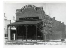
C.P. Bliss Mercantile Company (F833.2)