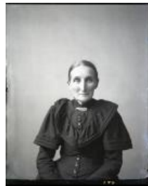
Portrait of unidentified woman (2023.40.1)