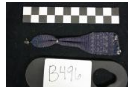
Reticule (coin purse) (B496.4)