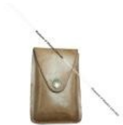
Baseball Counter (C766)