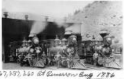
Engines 267, 287, 260 (1997.8.27)