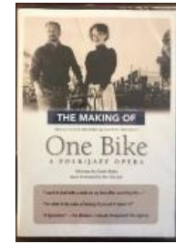
The Making of "One Bike" Opera (2021.22.1)