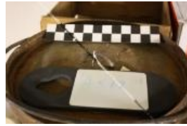
Dutch Oven (A517)