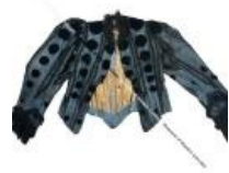
Velvet Flocked Bodice (H564A)