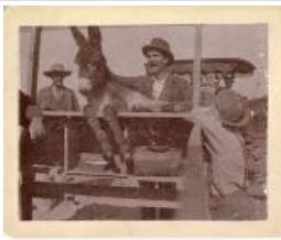
Burro and man (2016.4.1.78)