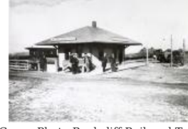
Group Photo Bookcliff Railroad Train Station (F515.6)