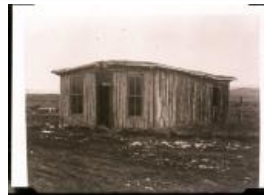
First School Building (2023.40.27)