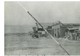
Main Street, Looking West (2004.44.790)