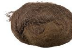
Switch of Hair (2023.42.94)