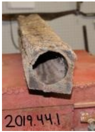
Pipe, Irrigation (2019.44.1)