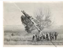
Ute Prisoner Surrender Tree (F230.1)