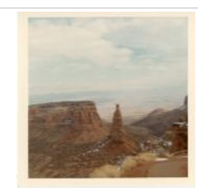
Colorado National Monument Independence Rock (F582.5)