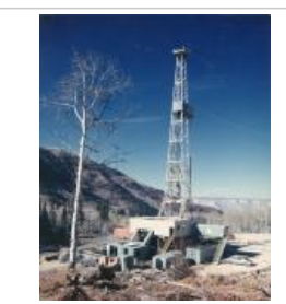
Astral Oil Co.'s Drilling Rig at Rulison (2HA161.10)