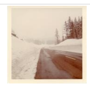
Snowy Highway on the Colorado Rockies (F582.4)