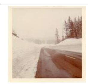
Snowy Highway on the Colorado Rockies (F582.4)