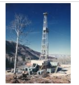
Astral Oil Co.'s Drilling Rig at Rulison (2HA161.10)