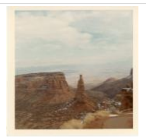
Colorado National Monument Independence Rock (F582.5)