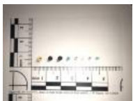
8 Beads (D2022.1.3)