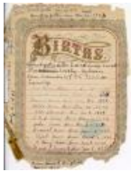
Births and Marriages page from the Butler Family Bible (2023.48.26)