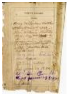
Births and Deaths page from the Butler Family records (2023.48.29)