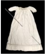
Christening Gown (2014.95.16)