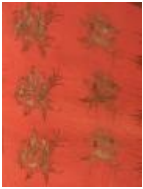
Red Shawl (2014.95.33)