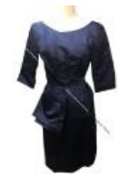
1960 Blue Dress (2014.95.4)