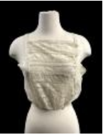
Net corset cover (2014.95.26)