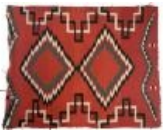
Navajo Rug (B614.1)