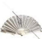
Hand fan (2014.95.42)