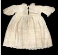
Child's Dress (2014.95.18)