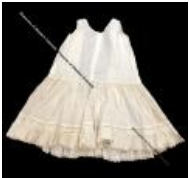
Baby Dress (2014.95.19)