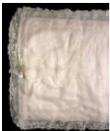
Baby Blanket (2014.95.32)