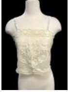
Net Brassiere (2014.95.25)