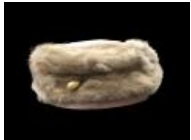
Fur lined hat (2014.95.46)