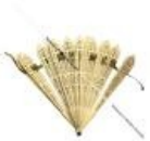
Hand fan (2014.95.41)