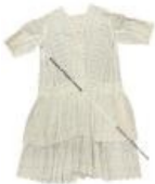
Childs White Dress (D932)