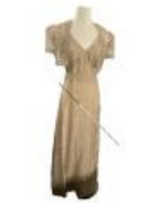
Lace gown (1982.79.20)