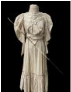
Two-piece dress (D52)