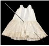
Baby Dress (2014.95.19)