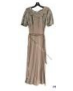
Wedding Dress (1982.220.1)