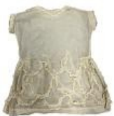
Baby Dress (E3)