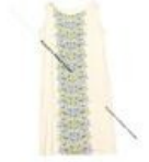
Green and Blue Paisley Dress (1999.55.38)