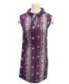
Purple Patterned Dress (1999.55.40)