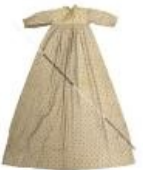
Infant Dress (C794)