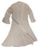
Cream dress (H516)