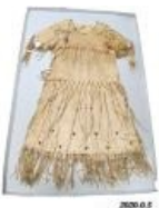
Beaded Leather Dress (2022.0.5)