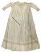
Baby Dress (D566)