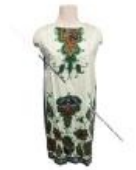
Green Paisley Dress (1999.55.39)