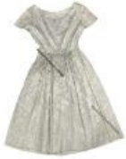
White and Silver Dress (1999.55.7)