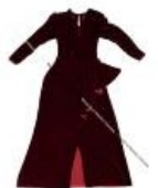
Red Velvet Dress (C898.1)