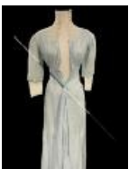
Graduation Dress (1983.169.11)