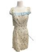
White Lace Dress with blue accents (1999.55.4)