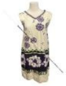
Hawaiian Dress (1999.55.37)