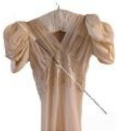
Chiffon dress (2H375)