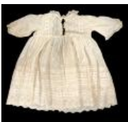
Child's Dress (2014.95.18)