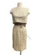
Beige Lace Dress with brown accents (1999.55.6)