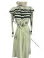
2 piece dress with detachable collar (1982.220.17)