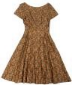
Brown Dress with orange accents (1999.55.13)