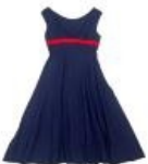
Navy Dress and Shawl, with red accents (1999.55.18)