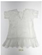
Child's White Dress (1994.7.48)