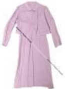
Light Purple Dress and Jacket (1999.55.14)