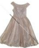
Light Pink Dress (1999.55.5)