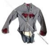
Red/Gray Wedding Dress (1993.74.1-2)