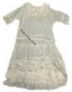
Child's Dress (1982.151.4)