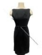
Black Dress (1999.55.41)