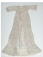
Baptism Dress (1993.146.3)