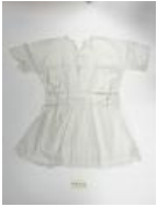
Child's White Cotton Dress (1994.7.47)