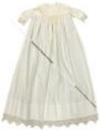
Baby Dress (B497.3)