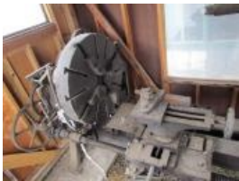
Industrial Metal Lathe D&RGW (CU 1992.40)