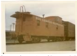
Photo and negative of Denver & Rio Grande Western Ry caboose (1990.10.75)