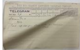
Telegram regarding cow (1985.114.2)