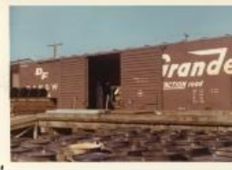
Rio Grande DF car being loaded with concentrate for shipment to Fernald, Ohio (1983.63.43)