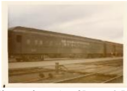
Photo and negative of Denver & Rio Grande Western Ry baggage car and C&S coach (1990.10.74)