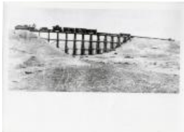
Photo of D&RG work train. Notes say The train could be on the North Fork branch near Hotchkiss, CO. (1990.10.45)