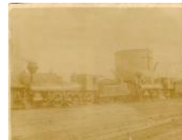
Denver and Rio-Grande Railroad Locomotives and Watertanks (F720.60)