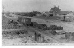
Denver & Rio Grande train yard (2004.44.995)