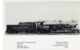
Informative Print from the D&RGW Railroad Co. on engine no.1600 (1990.10.31)