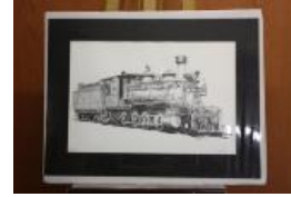
Denver and Rio Grande Western #278 (2016.0.12)