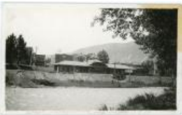
Photo of Glenwood Springs D&RG Depot (1987.26.10)