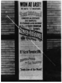
Rio Grande Ad (2004.44.951)