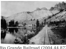
Rio Grande Railroad (2004.44.872)