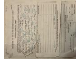
Locomotive Inspection Report (1985.114.3)