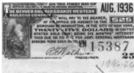
1936 Railroad Bond (1996.26.1)