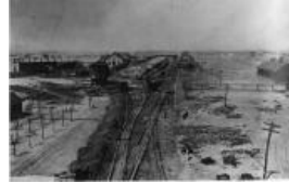
Grand Junction railroad yard (2004.44.963)