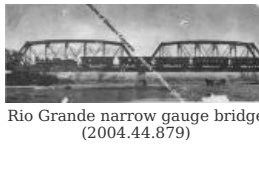
Rio Grande narrow gauge bridge (2004.44.879)