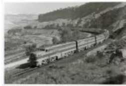
California Zephyr, Denver & Rio Grande Western Railroad (1979.99.1)