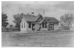
Whitewater Depot (1997.17.2)