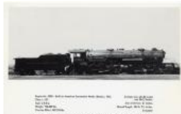
Informative Print from the D&RGW Railroad Co. on engine no.3500 (1990.10.30)