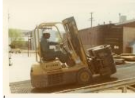
Rio Grande DF car being loaded with Hyster (1983.63.46)