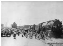
new D&RG locomotive (2004.44.871)