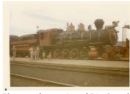
Photo and negative of Rio Grande Western Ry train No. 75 (1990.10.76)