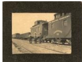
Rio Grande Western Caboose #12 (F220.1)