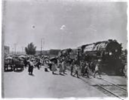
D&RG New Locomotive (F936.1)