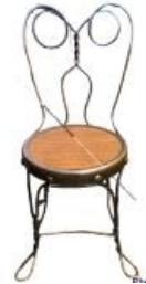
Dean Studio Child's Chair (2022.3.2)