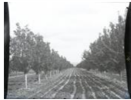
Orchard Scene (2023.40.15)