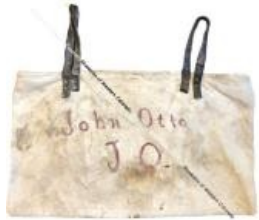
Saddle Bag (1994.25.2)