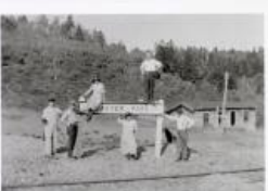
Travelers at Baxter Pass (1987.39.29)