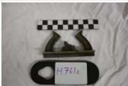
Woodworkers Plane (H761C)