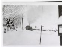
Uintah Train in the snow (1987.39.36)