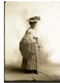
Photo of a young woman (2023.40.25)