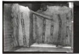
Decorated Hide (C557.2)