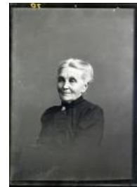
Portrait of an older woman (2023.40.30)