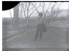
Woman dressed androgynously (2023.40.44)