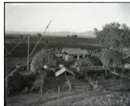
Farm Scene (2023.40.18)