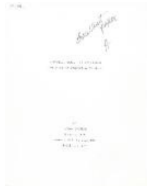
A Canyon, Coal, and A Railroad: The Story of Carpenter, Colorado (1985.114.1)

Marriage Records Mesa County, Colorado (1984.9.1)