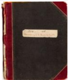
Proceedings of the Board of Health (1983.92.1)