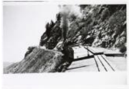
Uintah locomotive climbing 7.5% grade on Baxter Pass. (1987.39.5)