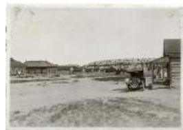
Photo of log structures with automobile (1990.8.21)