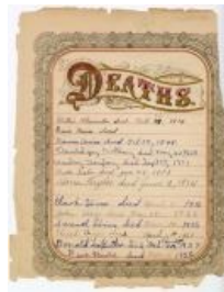
Deaths and Memoranda page from the Butler Family Bible (2023.48.27)