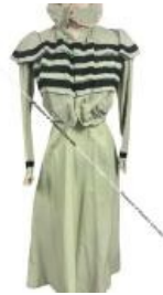
2 piece dress with detachable collar (1982.220.17)