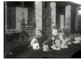
Group of young girls outside of URY office (2023.40.45)