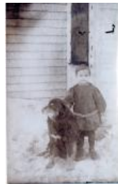
Elva Hughes and dog (2019.8.2)