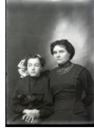
Portrait of Mother and Daughter (2023.40.34)