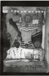
Native American Handmade Artifacts (C557.5)