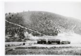
4th of July excursion train. (1987.39.9)