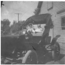
Pierce Arrow (2006.92.1)