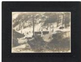
Smoldering Ruins of Stamp Mill After Fire (1979.87.7)