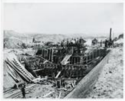
Gunnison Tunnel (2004.44.78)