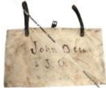
Saddle Bag (1994.25.3)