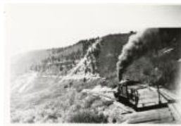
Train ascending Baxter Pass. (1987.39.10)