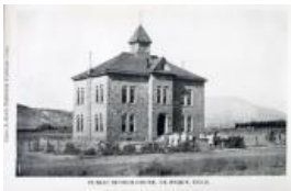
de Beque Public Schoolhouse (2022.25.1)