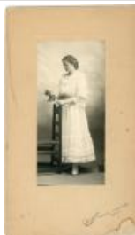
Catherine Moore High School Graduation (F524.4)