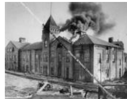
Sugar beet factory (2004.44.771)