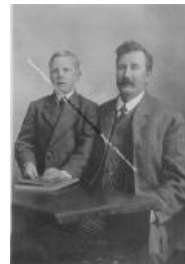
James Nelson and Son (2007.11.1)