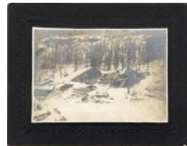
Aftermath of Camp Bird Stamp Mill after Avalanche (1979.87.4)