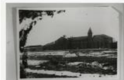
Sugar Beet Factory (F343.1)