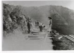
Rebuilding the Tracks (1987.39.24)