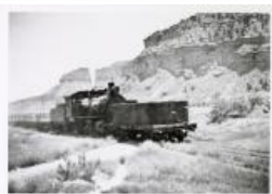
Uintah Railroad (1987.39.1)