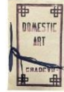
Domestic Art Booklet (2023.42.64)