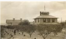
Cross Orchards House, Barn, and Orchards (1980.66.17)