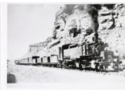
Mallet #51 north of Cooley (1987.39.11)