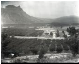
Agriculture Scene of Valley (2023.40.5)