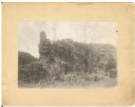
Scene in Unaweep Canyon (2019.16.2)