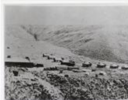
Scene of a town and train (1987.39.38)