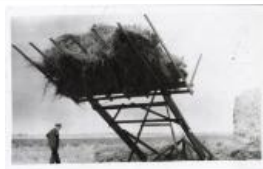
Wheat Stacker (1980.169.1)