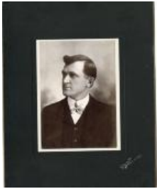
Unidentified man (2021.24.35)