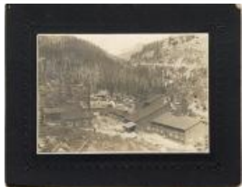
Camp Bird Mill and Residences (1979.87.1)