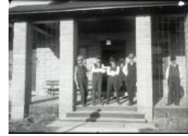
Group of men at the Uintah office (2023.40.49)