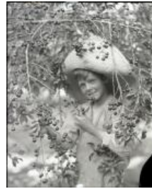
Boy with cherries at Knight's Orchard (2023.40.11)