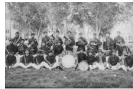
Teller Indian School Band (2006.0076)