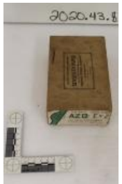
Sensitized Postcard Paper (2020.43.8)