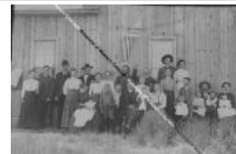
Dove family (1984.80.16)