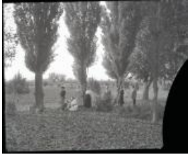
A group of people and their dog (2023.40.7)