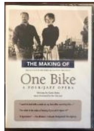
The Making of "One Bike" Opera (2021.22.1)