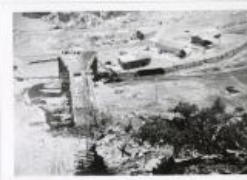
Dragon Mine near Dragon, Utah (1987.39.4)