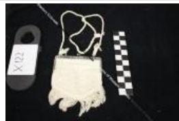
White Purse (X122)