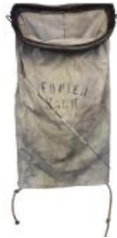
Fowler Picking Sack (CU 1986.40.1)