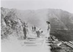
Bridge and building crew. (1987.39.25)