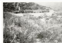
Train traveling between Columbine and McAndrews Lake (1987.39.14)