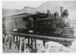
The Uintah Train (1987.39.19)