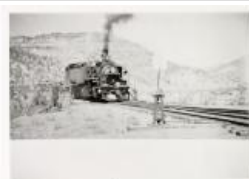
Mallet #51 crossing bridge into Atchee. (1987.39.15)