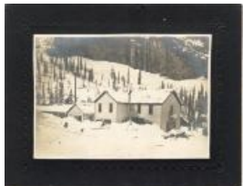
Aftermath of Avalanche on Rooming House (1979.87.5)