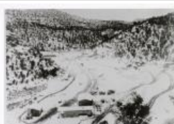
Dragon mine near Dragon, Utah. (1987.39.13)