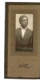
Portrait of an unidentified man (2023.48.21)