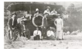
Travelers next to their vehicle (1983.77.52)