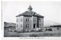
de Beque Public Schoolhouse (2022.25.2)