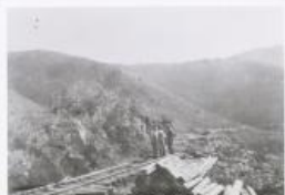
Bridge and building crew of three individuals on Pass. (1987.39.27)