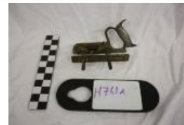
Woodworkers' Plane (H761A)