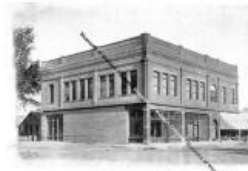
IOOF Building-early (2008.70.2)