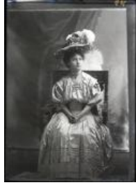
Portrait of a young woman (2023.40.32)