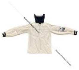
Navy Jacket (2023.42.83)