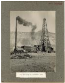
Photo of Oil Drilling in Palisade (1979.23.65)