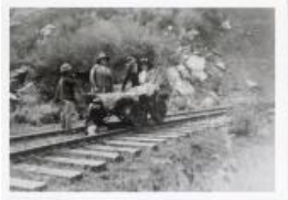
Riding on a hand car (1987.39.46)