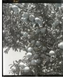
Apple Scene (2023.40.9)