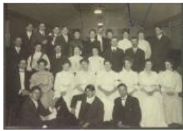
Party in Bower Hall (1979.23.191)