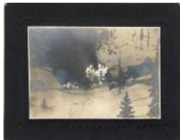
Stamp Mill Ruins on Fire (1979.87.6)