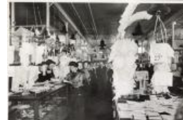
Photo and negative, Interior of the Fair Store (1999.8.35)