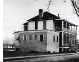
Teller Institute: Old Hospital (1979.66.2)