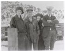
Two couples gathered at Atchee, Colorado. (1987.39.23)