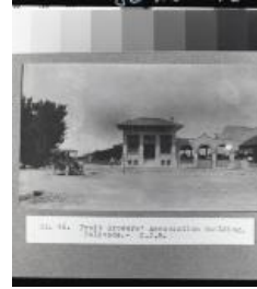
Fruit Growers Association Building in Palisade (1980.115.46)