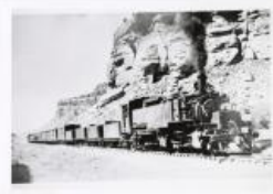
Uintah railroad locomotive (1987.39.2)