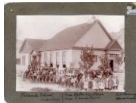
Photo of Palisade School and Students (1979.23.7)