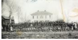
Teller Institute: Students and Faculty Photo (1979.66.10)