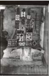
Native American Handmade Artifacts (C557.1)