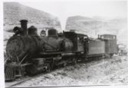
Engine #30 derailed at Rainbow Junction, Utah (1987.39.18)