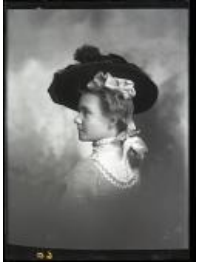
Portrait of a young woman (2023.40.31)