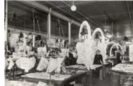
Photo and negative, Interior of the Fair Store (1999.8.34)