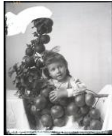
Photo of a girl and her apples (2023.40.10)