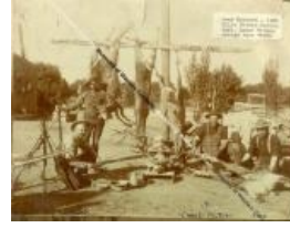
Deer Hunters (1979.23.122)