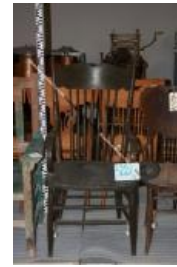
IOOF Chair (1983.162.4)