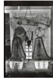
Native American Handmade Artifacts (C557.4)