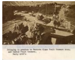
Photo of Bringing in Peaches to Western Slope Fruit Growers Association (1979.23.2)