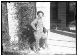
Unnamed Austrian man (2023.40.54)