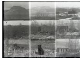
Composite of 9 farm pictures (2023.40.39)