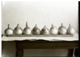
Onions from the Mile High Seed Co. (2023.40.26)