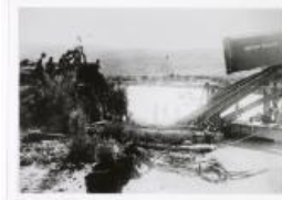
Wreck of engine #10 at bridge 2A. (1987.39.7)