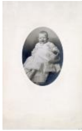
Portrait of a baby (2021.24.37)