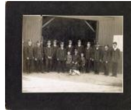
Grand Junction Fire Department in front of Firehouse (1990.58.17)