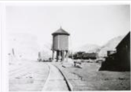
Engine #11 and water cars at Atchee. (1987.39.12)