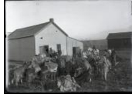
Pack of mules in Mack (2023.40.48)