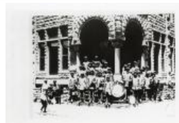
Teller Institute Band in Doorway of Grand Valley National Bank (F473.1)