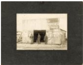
Dad's Blacksmith Shop (E144.5)