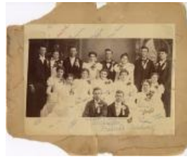
Washington Friends Academy (1982.202.9)