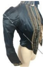
Lady's Bodice (B65)