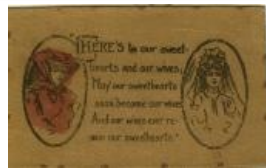
Leather Postcard (1999.0037.0002)