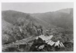
Rebuilding the tracks (1987.39.26)