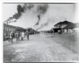
Grand Junction Railroad Station & Yards, 1900-1920 (F720.57)