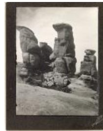
Group in front of large rocks (2021.24.29)