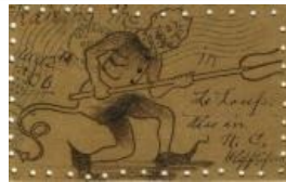
Leather Postcard (1999.37.1)