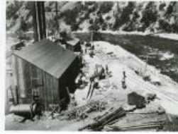
Gunnison Tunnel in Black Canyon (2004.44.81)