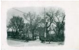
Photo of plaza in Santa Fe, New Mexico (1988.40.17)