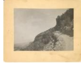
9 Mile Hill in Unaweep (2019.16.1)