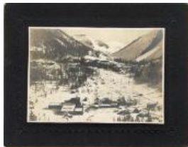
Bird Camp View of Stamp Mill After Avalanche (1979.87.3)