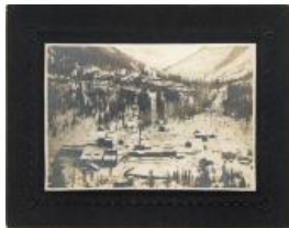
Bird Camp View of Stamp Mill Before Avalanche (1979.87.2)