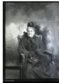
Portrait of an Older Woman (2023.40.29)