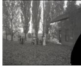
A group of people and their dog (2023.40.8)