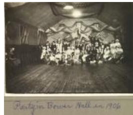
Party in Bower Hall (1979.23.193)