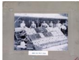
Early day fruit stand (1979.23.82)