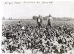
Sugar Beet Field (1980.169.2)