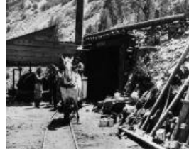
Gunnison Tunnel (2004.44.80)