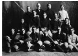
GJHS football team (2004.44.834)