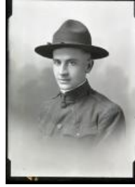
Portrait of a Soldier (2023.40.33)