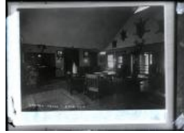
Interior of the Uintah Hotel (2023.40.47)