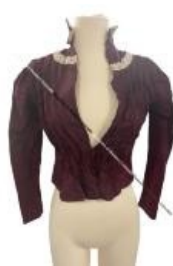
Maroon Blouse (A923)