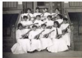
Teller Institute Girls Mandolin Club (F627.1)