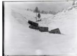
Uintah Train in Snow Wreck (1991.11.8)