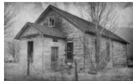
Cardiff School (2004.44.92)