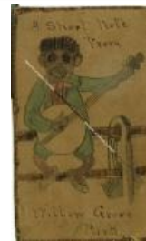
Leather Postcard (1999.37.3)