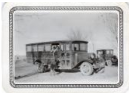
School Bus To Fruita Union High School (F879.8)