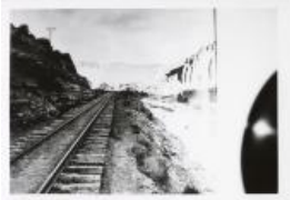
Uintah crossing bridge into Watson, Utah (1987.39.3)