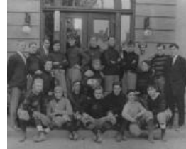
GJHS football team (2004.44.820)