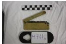
Blade box (H761D)