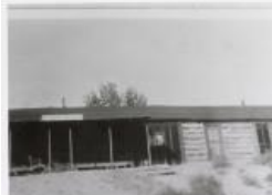
Watson Hotel at Watson, Utah (1987.39.28)