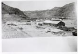
Dragon, Utah (1987.39.17)