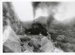
Train descending into Baxter Pass. (1987.39.8)