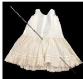
Baby Dress (2014.95.19)