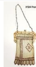
Metal Mesh Purse (X124)