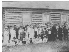
Dove family (1984.80.10)