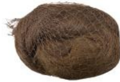
Switch of Hair (2023.42.94)