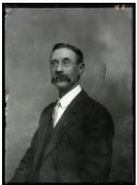
Portrait of an Unidentified Man (2023.40.40)