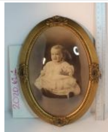
Baby Portrait (2020.62.1)