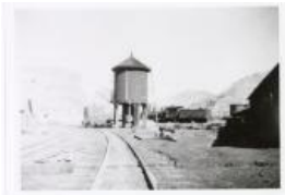
Engine #11 and water cars at Atchee. (1987.39.12)