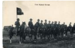
Postcard "The Signal Corps" (F551.11)