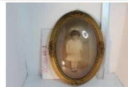
Portrait of a Child (2020.62.2)