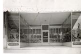
Exterior of the Benge's Shoe store (2021.24.11)