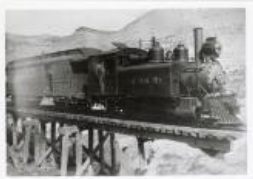
The Uintah Train (1987.39.19)