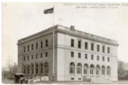
U.S. Post Office and Federal Building (F369.2)