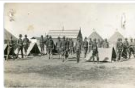
Postcard Camp Scene (F551.17)