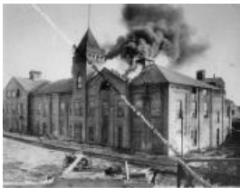
Sugar beet factory (2004.44.771)