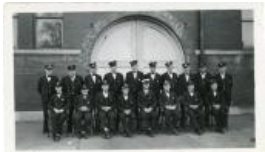
Railroad Conductors, c. 1910-1920 (F562.1)