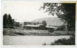
Photo of Glenwood Springs D&RG Depot (1987.26.10)