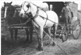
Progress Grocery (2007.57.1)