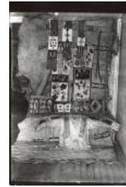
Native American Handmade Artifacts (C557.1)