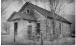
Cardiff School (2004.44.92)