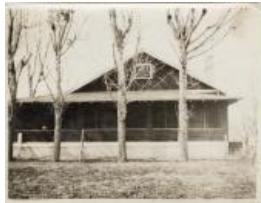
Page Home, Orchard Mesa (F732.9)