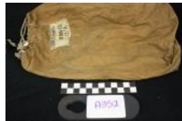
Duffel Bag (A352)