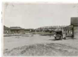
Photo of log structures with automobile (1990.8.21)