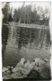
Postcard of Mesa Lake (F551.6)