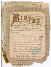
Births and Marriages page from the Butler Family Bible (2023.48.26)