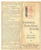
"Interesting Facts about Sugar" (2006.43.4)