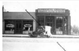
Progress Grocery (2007.57.3)