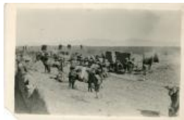
Postcard of Mule Train (F551.8)