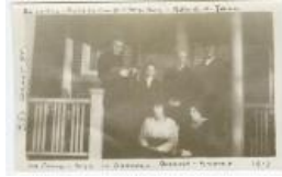
Family on porch in Denver (1982.135.1)