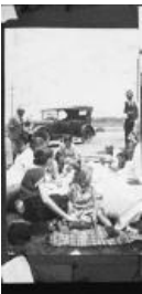
Family having picnic (2001.27.26)