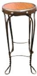
Dean Studio Table (2022.3.1)