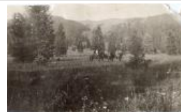
Mountain Landscape with Horses and Riders (2023.42.36)