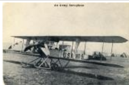
Postcard "An Army Aeroplane" (F551.14)