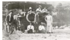
Travelers next to their vehicle (1983.77.52)