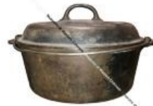
Cast Iron cooking pot (1980.107.2)