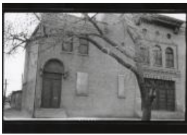
Park Opera House (1992.95.2)