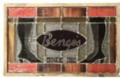
Benge's Stained Glass (2021.24.2)