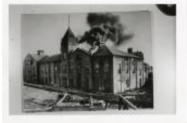
Sugar Beet Factory (F343.2)