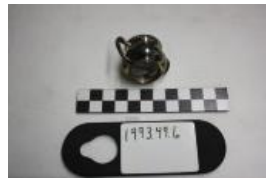
Sugar Bowl (1993.49.6)