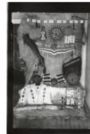
Native American Handmade Artifacts (C557.5)