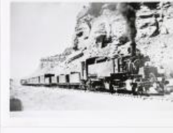
Mallet #51 north of Cooley (1987.39.11)