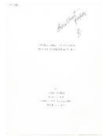
A Canyon, Coal, and A Railroad: The Story of Carpenter, Colorado (1985.114.1)