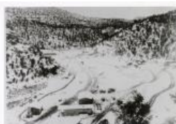
Dragon mine near Dragon, Utah. (1987.39.13)