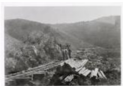
Rebuilding the tracks (1987.39.26)