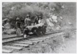
Riding on a hand car (1987.39.46)