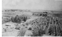
Oat Crop (2004.44.227)