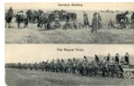
Postcard of Cavalry Resting and The Wagon Train (F551.7)