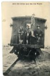
Postcard "Join the Army and See the World" (F551.10)