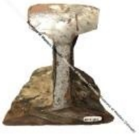
Trolley Tie (2019.65.2)