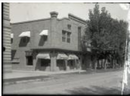
Dean Studio (2023.40.37)