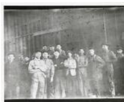
Photo of 16 unidentified individuals (1990.8.23)