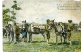
Army Mules (F551.4)