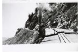
Uintah locomotive climbing 7.5% grade on Baxter Pass. (1987.39.5)