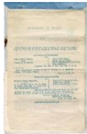
Abstract of Title (2001.49.1)