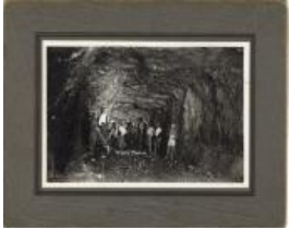
Inside Mt. Streeter Coal Mine (E144.4)