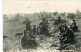
Battery Resting, Pine Camp (F551.3)