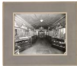
Benge's Shoe Store Interior (2021.24.7)