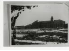
Sugar Beet Factory (F343.1)