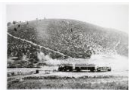
4th of July excursion train. (1987.39.9)