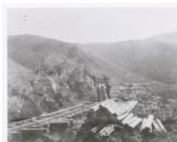
Bridge and building crew of three individuals on Pass. (1987.39.27)