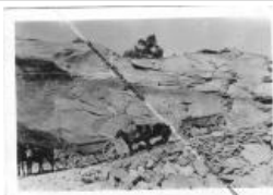
Serpent's Trail (2009.52.7)