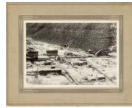
Mt Streeter Coal Mine (E144.3)