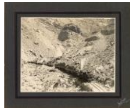
Little Book Cliff Railroad in Carpenter (2022.4.3)