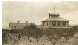
Cross Orchards House, Barn, and Orchards (1980.66.17)