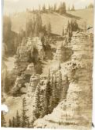
Mountain Landscape (2023.42.37)