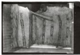
Decorated Hide (C557.2)