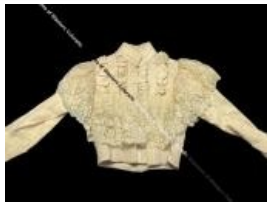
Lady's Blouse (B191)