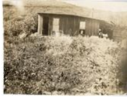
Meadow Landscape with Building (2023.42.38)