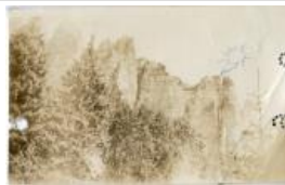
Mountain Landscape (2023.42.35)