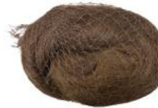
Switch of Hair (2023.42.94)