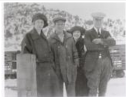
Two couples gathered at Atchee, Colorado. (1987.39.23)