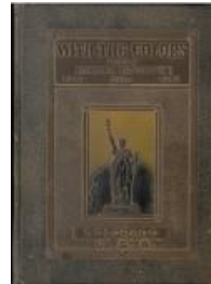
WWI Delta County Book (2022.87.1)