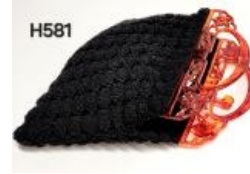
Black Crochet Purse (H581)