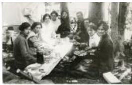
Picnic scene (1982.213.2)