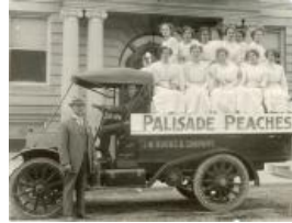
Photo of Palisade Peach Float (1979.23.79)