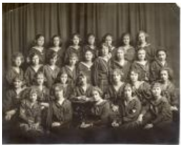
Portrait of a girl's group (2021.24.18)