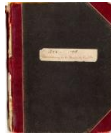
Proceedings of the Board of Health (1983.92.1)