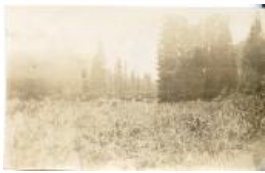
Mountain Meadow with Three Saddled Horses and Riders (2023.42.41)