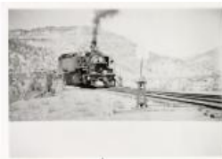
Mallet #51 crossing bridge into Atchee. (1987.39.15)