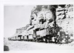
Uintah railroad locomotive (1987.39.2)