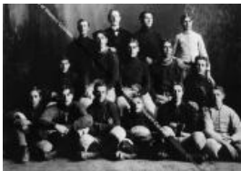
GJHS football team (2004.44.834)