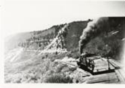
Train ascending Baxter Pass. (1987.39.10)