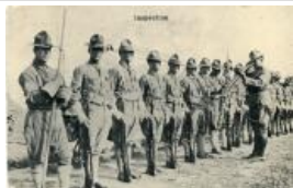
Postcard "Inspection" (F551.16)