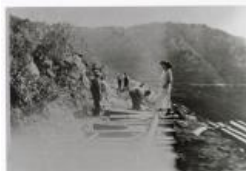
Rebuilding the Tracks (1987.39.24)