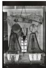
Native American Handmade Artifacts (C557.4)