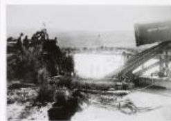
Wreck of engine #10 at bridge 2A. (1987.39.7)