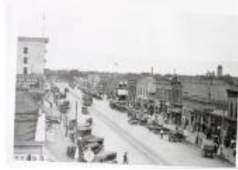
Downtown Grand Junction (F827.3)