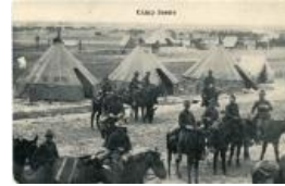
Camp Scene Postcard (F551.5)