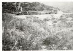
Train traveling between Columbine and McAndrews Lake (1987.39.14)