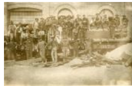
Colorado Sugar Mill Employees (2006.43.5)