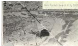
West Portal tunnel #3, 1913-134.0 (1979.23.145)