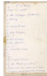
Photograph of Palisade Fire Department (1979.23.18)