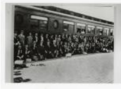
World War I Recruits, 1917 (F470.1)