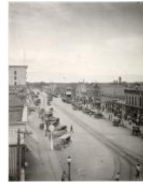
Black and white photo of Main Street (F827.1)