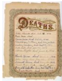
Deaths and Memoranda page from the Butler Family Bible (2023.48.27)