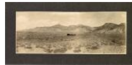
The Little Book Cliff train and tracks stopped in between Carpenter and Grand Junction. (2022.4.7)