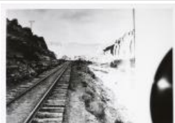
Uintah crossing bridge into Watson, Utah (1987.39.3)