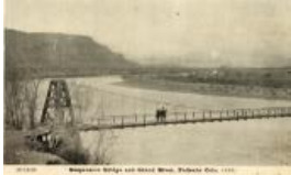
Photo of a Suspension Bridge and Grand River (1979.23.39)