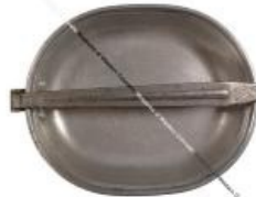
Mess Kit (WWI France) (A567)