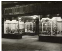
Exterior of Benge's Shoestore (2021.24.8)