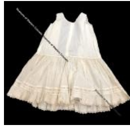
Baby Dress (2014.95.19)