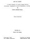
Lest We Forget: A Short History of Early Grand Valley, Colorado, Originally Called Parachute, Colorado