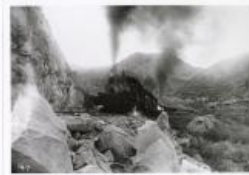
Train descending into Baxter Pass. (1987.39.8)