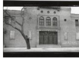
Park Opera House (1992.95.1)