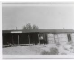
Watson Hotel at Watson, Utah (1987.39.28)