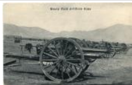
Postcard "Heavy Field Artillery Guns" (F551.12)