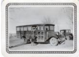
School Bus To Fruita Union High School (F879.8)