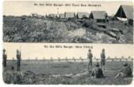
Postcard On the Rifle Range - 600 Yard Run Skirmish and Slow Firing (F551.2)