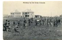
Postcard "Poling Up the Camp Grounds" (F551.9)