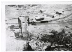
Dragon Mine near Dragon, Utah (1987.39.4)