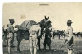
Postcard "Inspection" (F551.18)