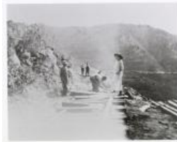
Bridge and building crew. (1987.39.25)