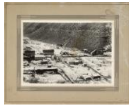
Mt Streeter Coal Mine (E144.2)