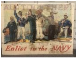
Enlist In The Navy Poster (1980.0.38)