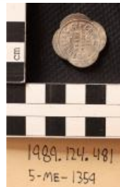
Metal Token. The Tibbs Cigar Co. Grand Junction Colo. (1989.124.481)