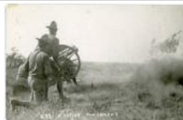
Postcard "'2.95' in action - Pine Camp, N.Y." (F551.13)