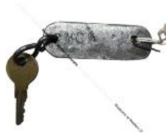
YMCA Keychain and Key (2018.17.1)