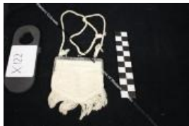
White Purse (X122)