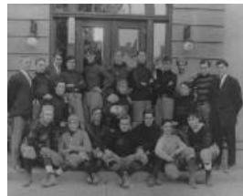
GJHS football team (2004.44.820)