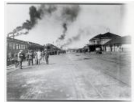
Grand Junction Railroad Station & Yards, 1900-1920 (F720.57)