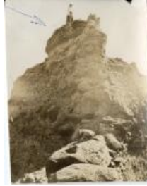
Rocky Spire with Woman Standing on Top (2023.42.39)