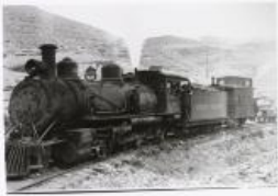
Engine #30 derailed at Rainbow Junction, Utah (1987.39.18)