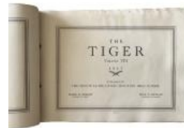
GJHS 1917 Annual (2021.24.93)