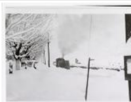
Uintah Train in the snow (1987.39.36)