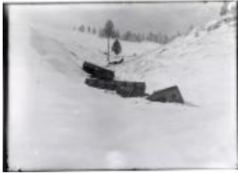
Uintah Train in Snow Wreck (1991.11.8)