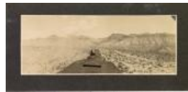
A view from the Little Book Cliff Locomotive (2022.4.6)