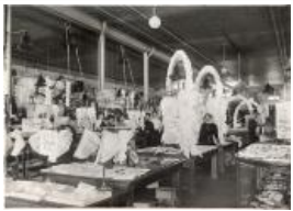
Photo and negative, Interior of the Fair Store (1999.8.34)