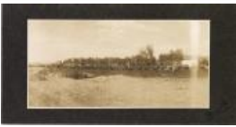
Train and boxcars at a town. (2022.4.10)