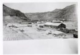
Dragon, Utah (1987.39.17)