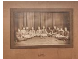
Photograph of Grand Junction Campfire Girls (2023.25.1)