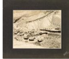
Carpenter, CO (2022.4.1)