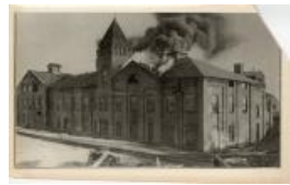
Sugar Beet Factory (F343.3)