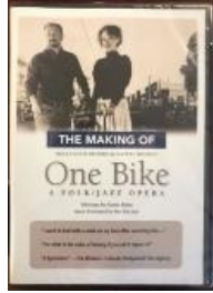
The Making of "One Bike" Opera (2021.22.1)