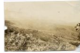
Mountain Valley with Building and Road (2023.42.40)