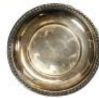
Sauceboat Tray (1993.49.2)