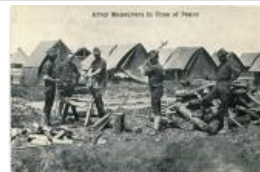
Postcard "Army Maneuvers in Time of Peace" (F551.19)