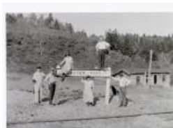
Travelers at Baxter Pass (1987.39.29)