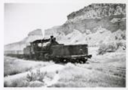
Uintah Railroad (1987.39.1)