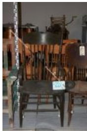
IOOF Chair (1983.162.4)