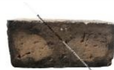
Brick from St. Joe Church (2019.65.1)