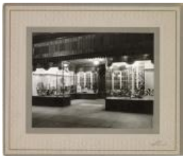
Exterior of Benge's Shoestore (2021.24.6)