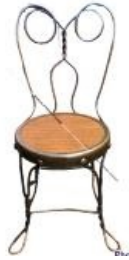
Dean Studio Child's Chair (2022.3.2)