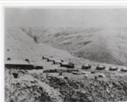
Scene of a town and train (1987.39.38)