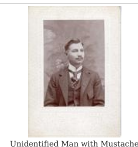
Unidentified Man with Mustache (F720.53)