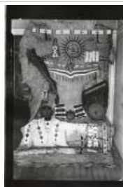
Native American Handmade Artifacts (C557.5)