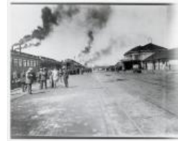
Grand Junction Railroad Station & Yards, 1900-1920 (F720.57)