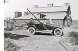
Car outside barn (2HA65)