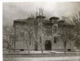
Lowell School (1991.52.5)