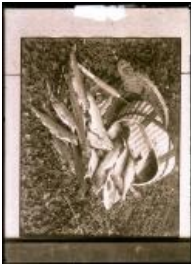
Trout from Cebolla, CO (2023.40.28)