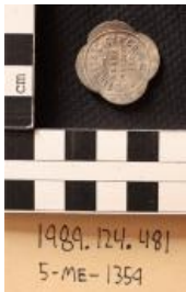
Metal Token. The Tibbs Cigar Co. Grand Junction Colo. (1989.124.481)