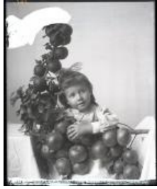
Photo of a girl and her apples (2023.40.10)