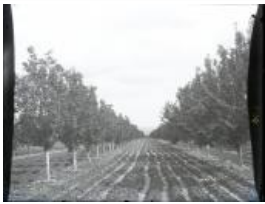
Orchard Scene (2023.40.15)