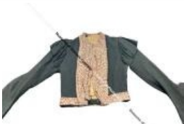
Lady's Blouse (B44)