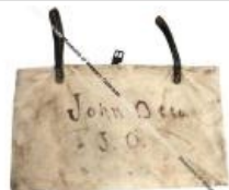
Saddle Bag (1994.25.3)