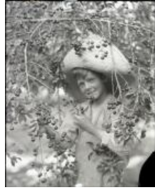
Boy with cherries at Knight's Orchard (2023.40.11)