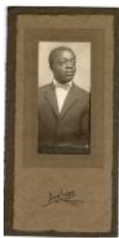
Portrait of an unidentified man (2023.48.21)