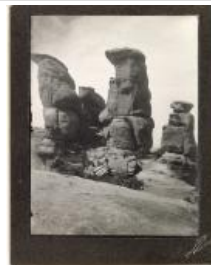
Group in front of large rocks (2021.24.29)