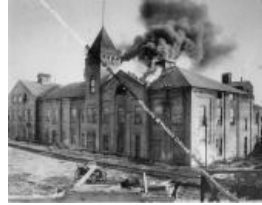
Sugar beet factory (2004.44.771)