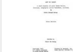
Lest We Forget: A Short History of Early Grand Valley, Colorado, Originally Called Parachute, Colorado