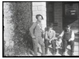
Austrian Man outside Uintah Railway Company (2023.40.52)