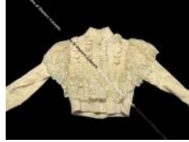
Lady's Blouse (B191)