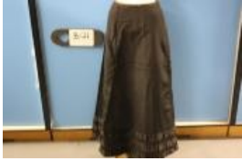
Lady's Petticoat (B121)