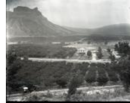
Agriculture Scene of Valley (2023.40.5)