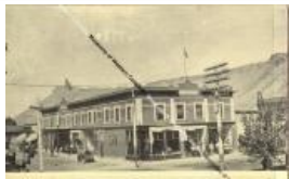
Jordan's Inn (1979.23.158)