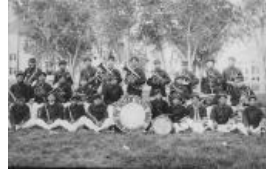
Teller Indian School Band (2006.0076)