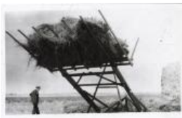
Wheat Stacker (1980.169.1)