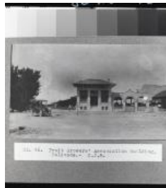
Fruit Growers Association Building in Palisade (1980.115.46)