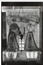
Native American Handmade Artifacts (C557.4)