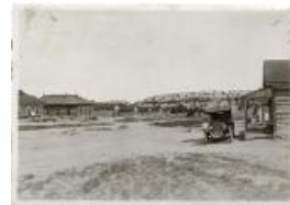
Photo of log structures with automobile (1990.8.21)