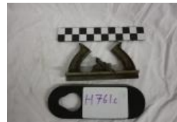
Woodworkers Plane (H761C)