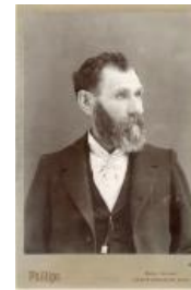
Judge Joseph Ong Portrait (2018.113)