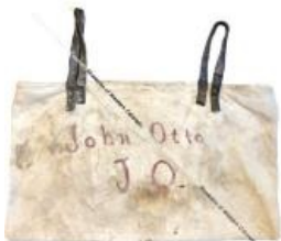
Saddle Bag (1994.25.2)