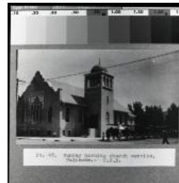
Methodist Church in Palisade (1980.115.47)