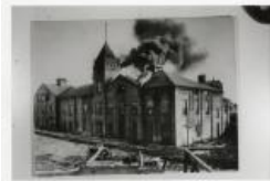
Sugar Beet Factory (F343.2)