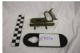
Woodworkers' Plane (H761A)