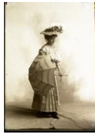
Photo of a young woman (2023.40.25)