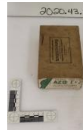
Sensitized Postcard Paper (2020.43.8)