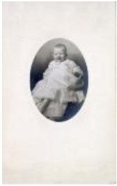
Portrait of a baby (2021.24.37)