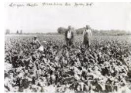
Sugar Beet Field (1980.169.2)