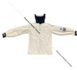
Navy Jacket (2023.42.83)