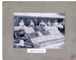
Early day fruit stand (1979.23.82)