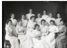
Group of ladies portrait (2023.40.6)