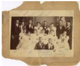
Washington Friends Academy (1982.202.9)