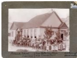
Photo of Palisade School and Students (1979.23.7)