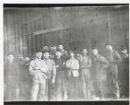
Photo of 16 unidentified individuals (1990.8.23)