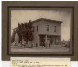
Photo of the Hugus Building in 1903 (1979.23.97)