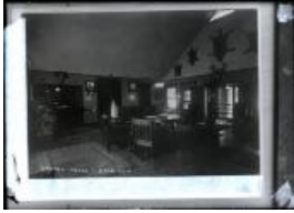
Interior of the Uintah Hotel (2023.40.47)