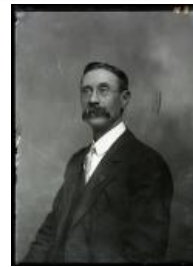
Portrait of an Unidentified Man (2023.40.40)