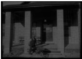
Man with wheelbarrow in front of the Uintah office (2023.40.55)