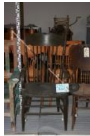
IOOF Chair (1983.162.4)