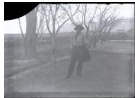
Woman dressed androgynously (2023.40.44)