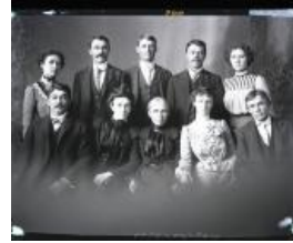
Portrait of a family (2023.40.12)