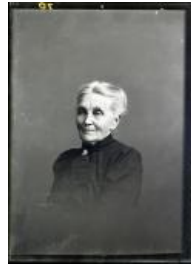
Portrait of an older woman (2023.40.30)