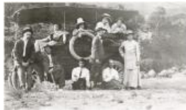
Travelers next to their vehicle (1983.77.52)