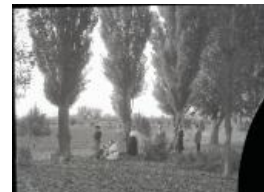
A group of people and their dog (2023.40.7)