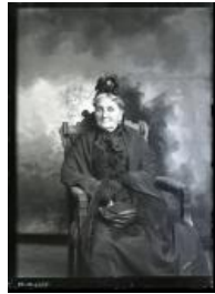
Portrait of an Older Woman (2023.40.29)