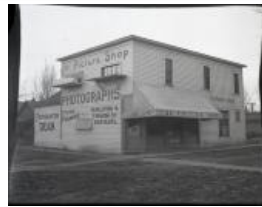
Frank Dean Studio (2023.40.4)