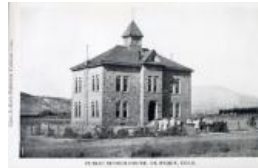
de Beque Public Schoolhouse (2022.25.1)