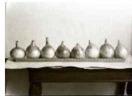
Onions from the Mile High Seed Co. (2023.40.26)