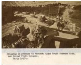
Photo of Bringing in Peaches to Western Slope Fruit Growers Association (1979.23.2)