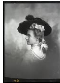
Portrait of a young woman (2023.40.31)