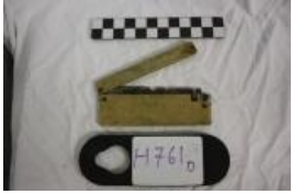
Blade box (H761D)