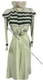
2 piece dress with detachable collar (1982.220.17)