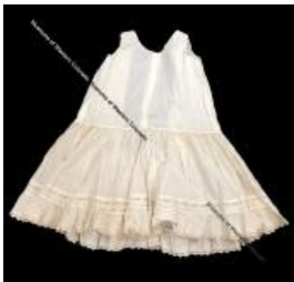
Baby Dress (2014.95.19)