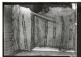
Decorated Hide (C557.2)