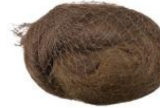
Switch of Hair (2023.42.94)