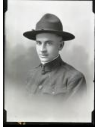
Portrait of a Soldier (2023.40.33)