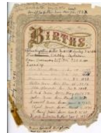
Births and Marriages page from the Butler Family Bible (2023.48.26)