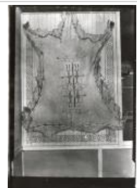
Decorated Hide (C557.3)