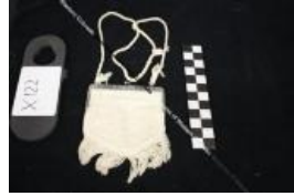
White Purse (X122)