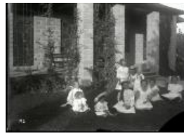
Group of young girls outside of URY office (2023.40.45)