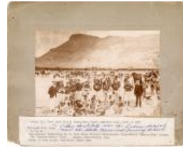
Photograph of Teller Institute Baseball Team Vs Palisade (1979.23.12)