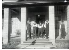
Group of men at the Uintah office (2023.40.49)