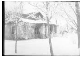
Uintah Railway Office in Winter (2023.40.56)