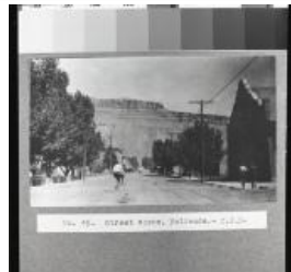
Palisade street scene (1980.115.45)