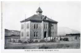
de Beque Public Schoolhouse (2022.25.2)