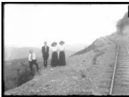
Group near tracks on Baxter Pass (2023.40.51)