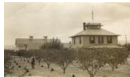
Cross Orchards House, Barn, and Orchards (1980.66.17)