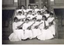
Teller Institute Girls Mandolin Club (F627.1)