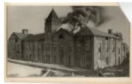
Sugar Beet Factory (F343.3)