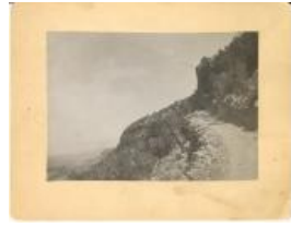
9 Mile Hill in Unaweep (2019.16.1)