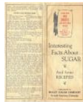
"Interesting Facts about Sugar" (2006.43.4)