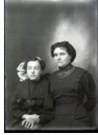
Portrait of Mother and Daughter (2023.40.34)