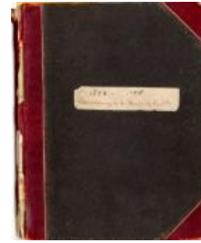
Proceedings of the Board of Health (1983.92.1)