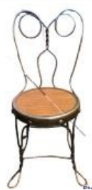
Dean Studio Child's Chair (2022.3.2)