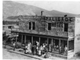
Palisade Hotel (2004.44.908)