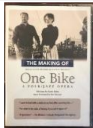
The Making of "One Bike" Opera (2021.22.1)