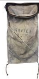
Fowler Picking Sack (CU 1986.40.1)