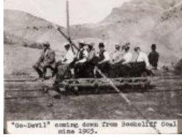
Passengers on the Go Devil (1982.0.20)