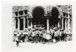
Teller Institute Band in Doorway of Grand Valley National Bank (F473.1)