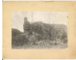
Scene in Unaweep Canyon (2019.16.2)