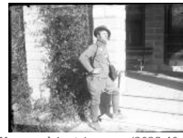
Unnamed Austrian man (2023.40.54)