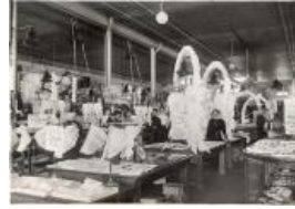
Photo and negative, Interior of the Fair Store (1999.8.34)