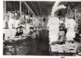
Photo and negative, Interior of the Fair Store (1999.8.35)