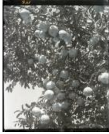
Apple Scene (2023.40.9)