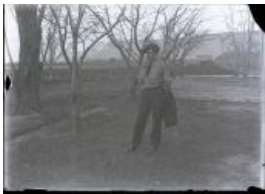
Woman dressed androgynously (2023.40.43)