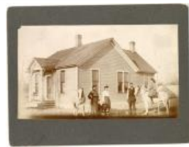
Family Photo in Front of Home, Hughes Family 1903 (2019.8.9)