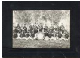
Teller Institute Band (F473.2)