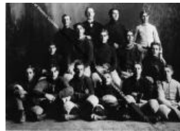
GJHS football team (2004.44.834)