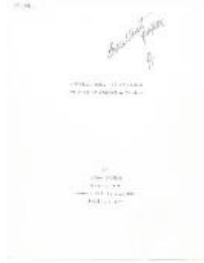
A Canyon, Coal, and A Railroad: The Story of Carpenter, Colorado (1985.114.1)