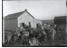
Pack of mules in Mack (2023.40.48)