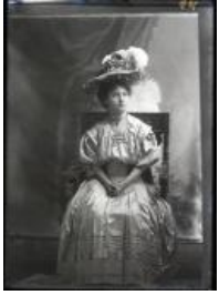
Portrait of a young woman (2023.40.32)