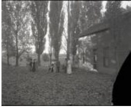
A group of people and their dog (2023.40.8)