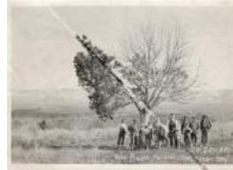
Ute Prisoner Surrender Tree (F230.1)