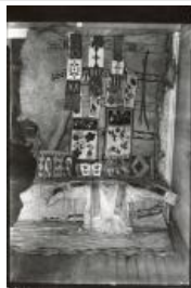
Native American Handmade Artifacts (C557.1)