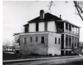
Teller Institute: Old Hospital (1979.66.2)