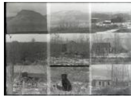
Composite of 9 farm pictures (2023.40.39)