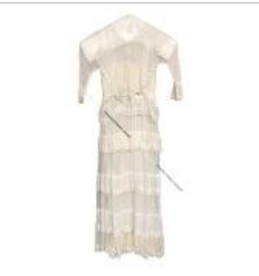
White net girl's dress (A950)