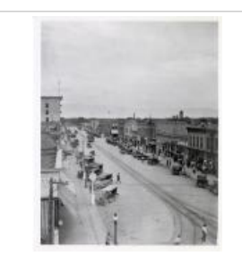
Photograph of Downtown Grand Junction (F827.2)