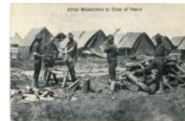
Postcard "Army Maneuvers in Time of Peace" (F551.19)