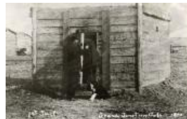
First Jail in Grand Junction, c. 1890 (F799.1)