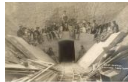
Postcard from Frank Strain to David Strain depicting the Orchard Mesa Tunnel East Portal (F912.13)