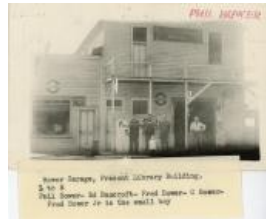
Photo of Bower Garage (1979.23.42)