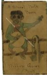
Leather Postcard (1999.37.3)