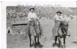
Postcard of Meeker Cowgirls (2023.42.19)