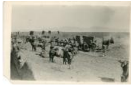
Postcard of Mule Train (F551.8)