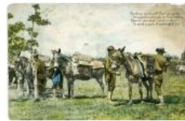
Army Mules (F551.4)