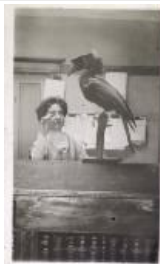
Picture of Woman with Perched Bird (1979.61.13)