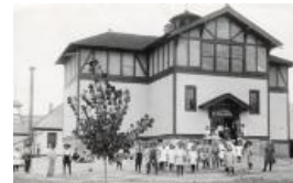
Postcard of Clifton School c. 1920 (1979.46.5)