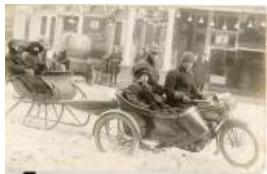
Postcard of Group of People On Motorcycle and Sleigh (2023.42.54)