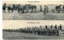
Postcard of Cavalry Resting and The Wagon Train (F551.7)