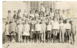
Postcard of Clifton School Children (1979.46.4)