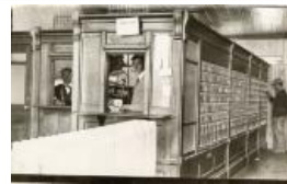
Palisade Post Office, 1910-11 (F912.1)