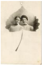
Portrait of Two Unidentified Women (1979.79.3)