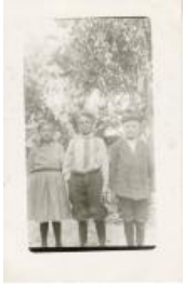
Three Children (1980.155.20)