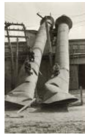
Postcard of Destroyed Smokestacks at the Electric Company (F667.1)