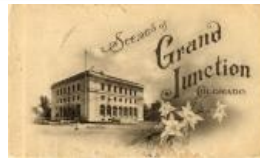
"Scenes of Grand Junction Colorado" Postcard Booklet (1980.155.27)