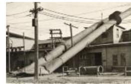
Postcard of Destroyed Smokestacks at the Electric Company (F667.2)