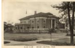
Postcard of the Elks' Club, Grand Junction (1980.155.23)