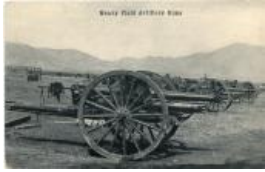
Postcard "Heavy Field Artillery Guns" (F551.12)