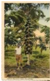
Postcard depicting Papaya Tree with Fruit, Philippines (2023.42.11)