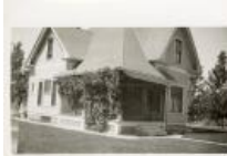
Fred Ewing House, Palisade (F912.4)