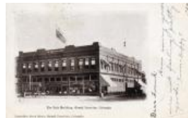
Postcard of the Fair Building to Frank Strain (F912.11)