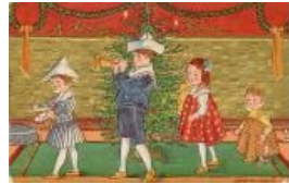
"A Merry Xmas" Postcard (1980.155.33)