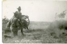
Postcard "'2.95' in action - Pine Camp, N.Y." (F551.13)