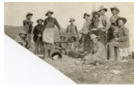
Chucktime Meeker, Colorado (2023.42.20)