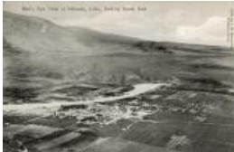
Postcard of Bird's Eye View of Palisade, Colo., looking South East (F912.9)