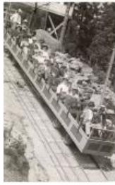
Manitou Scenic Incline Cable Car (1979.61.5)