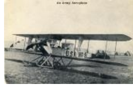
Postcard "An Army Aeroplane" (F551.14)