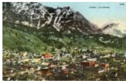
Postcard of Ouray, Colorado (2023.42.12)