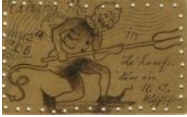
Leather Postcard (1999.37.1)