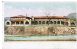
Postcard of Hotel Cardenas (2023.42.21)