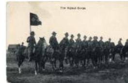
Postcard "The Signal Corps" (F551.11)