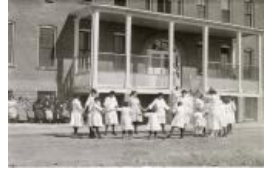
Girls Playing at the Teller Institute (1979.66.7)