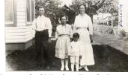
Postcard of Winslow Family Portrait (2023.42.32)