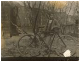
Boy with Bicycle (1980.155.11)