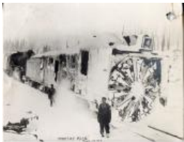
Postcard of Train in Snow (2023.42.23)