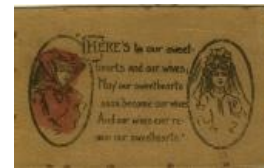
Leather Postcard (1999.0037.0002)