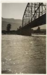
Palisade Bridge over the Grand River (F912.7)