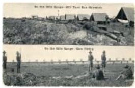
Postcard On the Rifle Range - 600 Yard Run Skirmish and Slow Firing (F551.2)