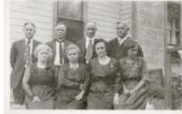
Unidentified Men and Women (1980.155.21)