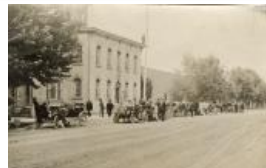
Early Automobile Tour in Town (F838.9)