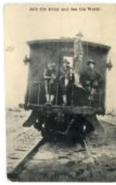
Postcard "Join the Army and See the World" (F551.10)