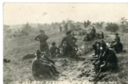
Battery Resting, Pine Camp (F551.3)