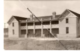
Teller Institute: Boys Dormitory (1979.66.8)