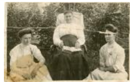
Postcard of Three Unidentified Women (F565.1)