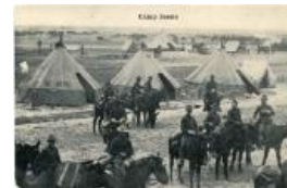
Camp Scene Postcard (F551.5)