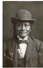
Postcard of Chief Atchee (F836.1)