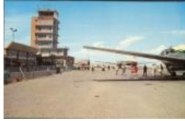
Grand Junction Airport Postcard (2004.41.1)