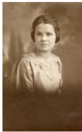
Unidentified Woman (1980.153.34)