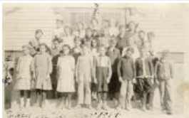
Clifton School Class Portrait, 1914 (1979.46.7)