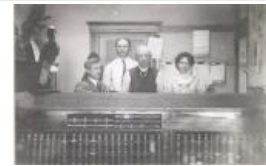
Four People At Registration Desk (1979.61.19)