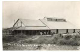
Postcard of Packing House in Lazear, Colorado (2023.42.8)