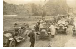
Postcard of Early Automobile Excursion through the Mountains (F838.7)