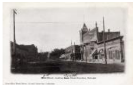
Postcard of 5th Street, Looking South, Grand Junction (F912.12)