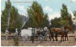
Spraying Fruit Postcard (1966.66.1)