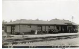
Palisade Railroad Depot, 1910 (F912.3)