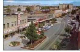
Downtown Grand Junction Postcard (2004.41.2)