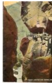
Colored Postcard of Box Canon Looking Out, Ouray, Colorado (2023.42.9)