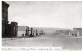
Main Street, 1884 (F839.1)