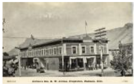
Postcard of Jordan's Inn, Palisade (F912.10)