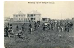
Postcard "Polieing Up the Camp Grounds" (F551.9)