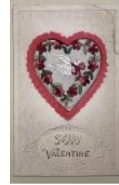
Valentine Postcard (1975.9.1)