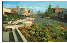
Downtown Grand Junction Postcard (2004.41.4)