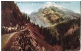
Postcard of Silverton-Ouray Toll Road (2023.42.10)