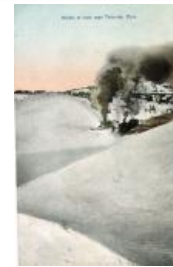
Postcard of Rotary Near Telluride, Colorado (2023.42.22)