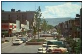
Downtown Grand Junction Postcard (2004.41.3)