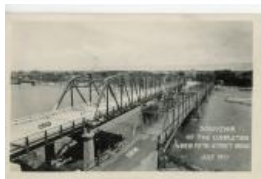
5th Street Bridge (2004.44.156)