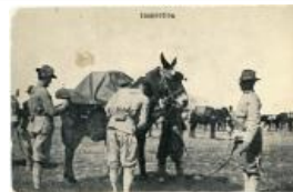
Postcard "Inspection" (F551.18)