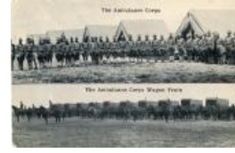
Postcard "The Ambulance Corps" and "The Ambulance Corps Wagon Train" (F551.15)