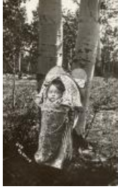
Ute Baby in Cradleboard (F836.4)