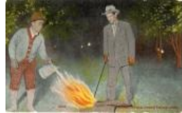
Smudging Scene Postcard (1966.66.3)