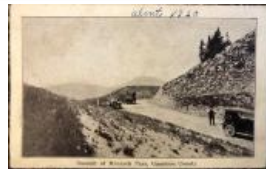
Summit Of Monarch Pass Postcard from Hunk Kimell to Ona Kimell (F564.2)