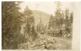
Early Automobiles Crossing Mountain Pass (F838.8)