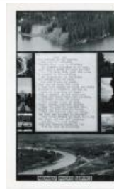
Postcard with Poem (2023.43.5)