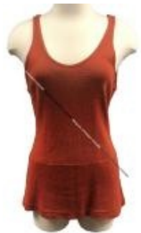
Reddish/orange Bathing Suit (X40)