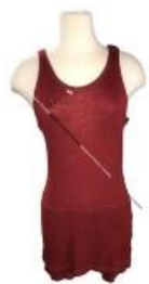
Red Bathing Suit (X41)