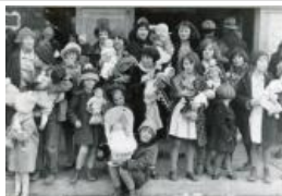
Soup Eaters Children (2004.44.56)