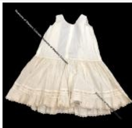
Baby Dress (2014.95.19)