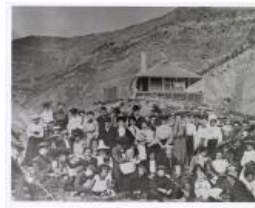
Carpenter excursion (F515.3)