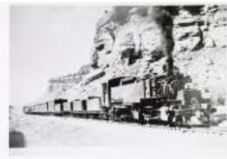
Mallet #51 north of Cooley (1987.39.11)