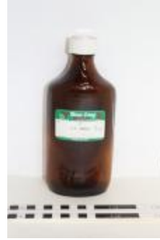
Dr. Everett Munro's Mixture for Coughs and Sore Throats (2005.32.1)