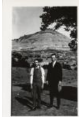
Two Men (1999.8.107)