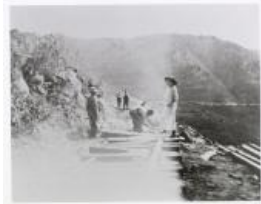
Bridge and building crew. (1987.39.25)