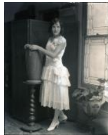
Negative of Young girl in dress with curl on forehead (2002.21.260)