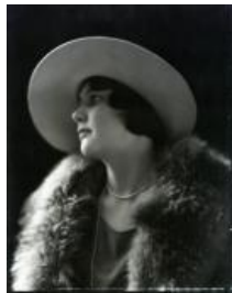
Negative of Lady with Hat. (2002.21.119)