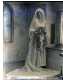
Negative of women in wedding dress (2002.21.236)