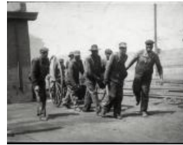
Negative of Grand Junction Roundhouse Crew pulling firehose cart (F266.8)