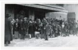
Soup Eaters (2004.44.57)