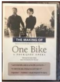
The Making of "One Bike" Opera (2021.22.1)