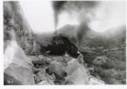
Train descending into Baxter Pass. (1987.39.8)