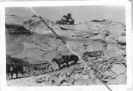
Serpent's Trail (2009.52.7)