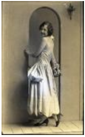
Negative of girl in dress. (2002.21.86)