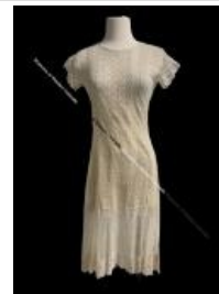
Lace Dress (E68)