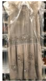
Gray sheer dress (A992)