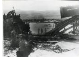
Derailment on Uintah Railroad (F222.1)