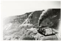
Train ascending Baxter Pass. (1987.39.10)