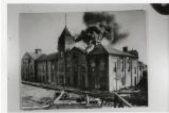
Sugar Beet Factory (F343.2)