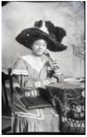
Negative of unidentified woman (F266.4)