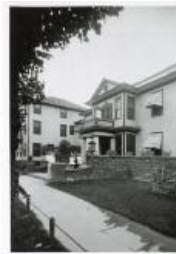
Negative photo of La Court Hotel (1992.55.2)