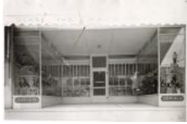
Exterior of the Benge's Shoe store (2021.24.11)