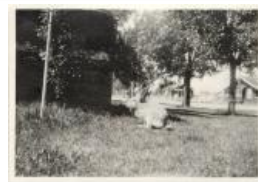
Anderson Family Bunny (2021.23.55)