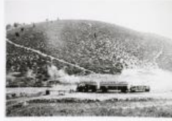
4th of July excursion train. (1987.39.9)