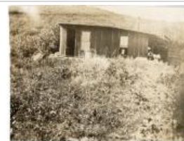
Meadow Landscape with Building (2023.42.38)