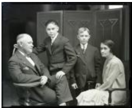
Negative of a family of four (Mom, Dad, Two boys) (2002.21.68)