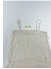
Silk Full Slip (1994.7.32)