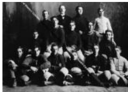
GJHS football team (2004.44.834)