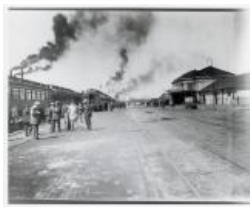
Grand Junction Railroad Station & Yards, 1900-1920 (F720.57)