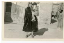
Soup Eaters (2004.44.44)