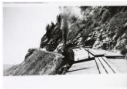
Uintah locomotive climbing 7.5% grade on Baxter Pass. (1987.39.5)