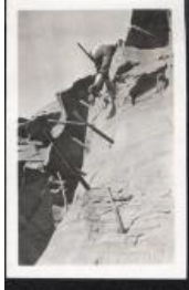
Anderson Photobook Photo (2021.23.157)