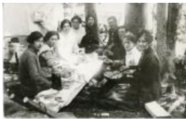
Picnic scene (1982.213.2)