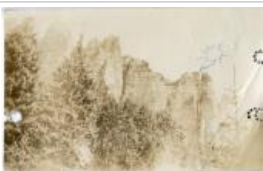
Mountain Landscape (2023.42.35)