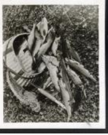
Fish in a Basket (2021.23.193)