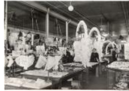
Photo and negative, Interior of the Fair Store (1999.8.34)