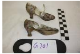
Womens shoes, 1920s (G201)