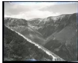
Mountain with Oil Shale (2002.21.180)