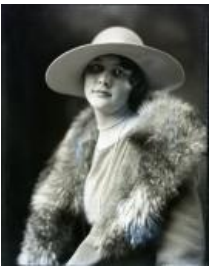
Negative of Lady with Hat (2002.21.118)