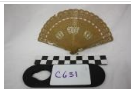
Woman's Brown Wood Fan W/Pink Ribbon (C631)