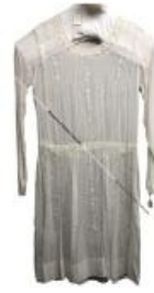
Sheer white dress (E84)