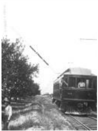
Railway No 51 (1995.82.1)