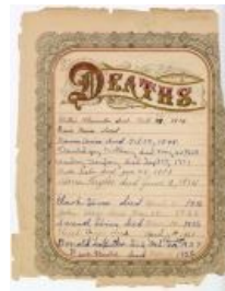
Deaths and Memoranda page from the Butler Family Bible (2023.48.27)