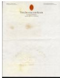
GJHS School Newspaper Orange and Black Letterhead (2021.23.20)