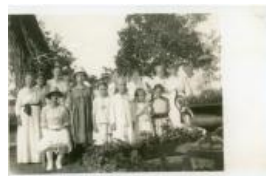
Photo of a group of people (2006.48.7)