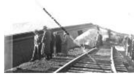
Train wreck (2007.103.3)