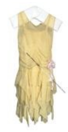
Yellow Dress (B190)