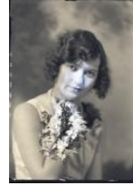
Negative of young lady in dress (2002.21.254)