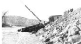
Train wreck (2007.103.6)