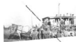
Appleton School Bus (1995.85.2)