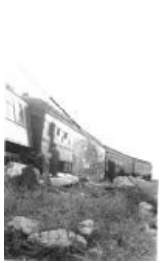
Train wreck (2007.103.2)