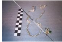
1920s Headband (2003.80.6)