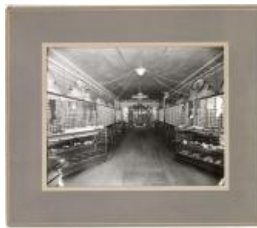
Benge's Shoe Store Interior (2021.24.7)