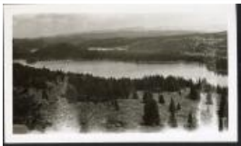
Deep Ward Lake (2021.23.191)