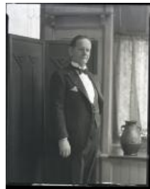
Negative of a man standing (2002.21.163)