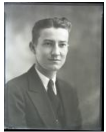
Negative of young man in suit (2002.21.244)