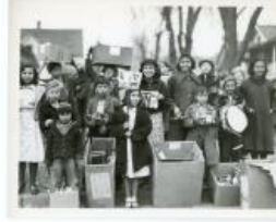
Soupeaters Children (2004.44.61)