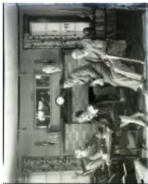
Negative of a family of four. (2002.21.69)