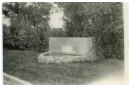
Bird Bath in Riverside (2006.48.2)