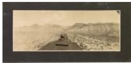
A view from the Little Book Cliff Locomotive (2022.4.6)