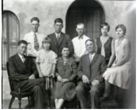
Negative of a family of 7 (2002.21.75)