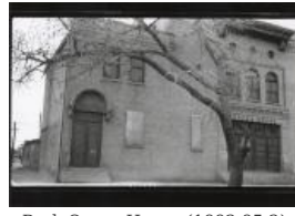
Park Opera House (1992.95.2)