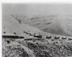
Scene of a town and train (1987.39.38)