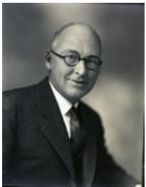
Negative of Reymor (2002.21.194)