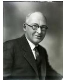
Negative of Reymor (2002.21.193)