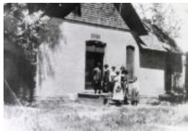
Handy Chapel (D0224)