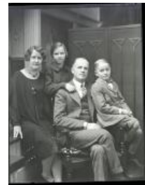
Negative of a family of four (Mom, Dad, Girl, Boy) (2002.21.70)