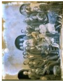
Negative of wedding party (2002.21.235)