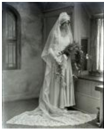
Negative of women in wedding dress (2002.21.237)