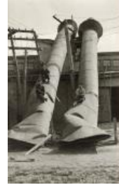
Postcard of Destroyed Smokestacks at the Electric Company (F667.1)