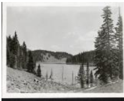
Grand Mesa Lakes (2021.23.192)