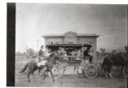
Appleton school horse drawn school bus (F385.1)