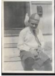
Boy with a Pigeon (2021.23.61)