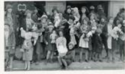
Soupeaters, kids and their toys (2004.44.60)