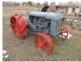
1920 Fordson Tractor (1985.40.1)