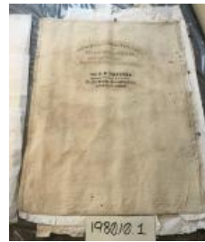
Voting Booth Canvas (1980.14.1)