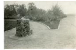
Drinking Fountain (2006.48.1)