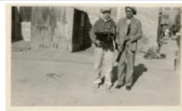
Soup Eaters (2004.44.55)