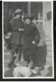
Anderson Family & Dogs (2021.23.31)