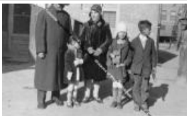
Soup Eaters (2004.44.54)