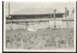
Anderson Yard (2021.23.57)