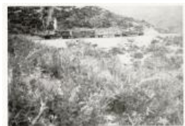
Train traveling between Columbine and McAndrews Lake (1987.39.14)