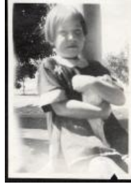
Girl with a Pigeon (2021.23.62)