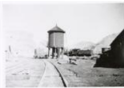
Engine #11 and water cars at Atchee. (1987.39.12)