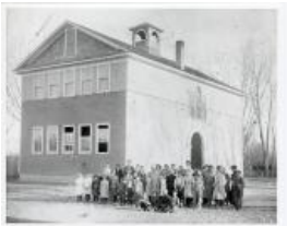
Whitewater School (F809.2)