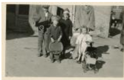
Soup Eaters (2004.44.53)