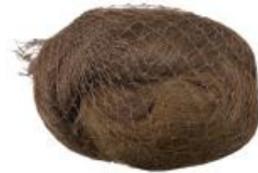
Switch of Hair (2023.42.94)