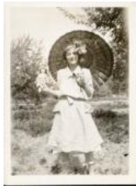
Woman holding parasol and doll (2022.24.3)