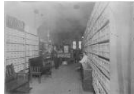
412 Main St (1998.44.1)