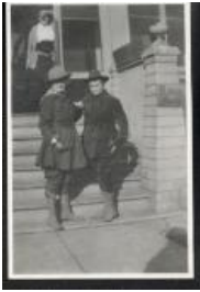
Anderson Photobook Photo (2021.23.32)