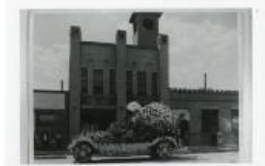
Peach Day Float in Front of Fire Station (F528.1)