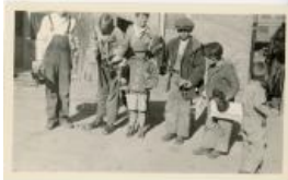
Soup Eaters (2004.44.46)