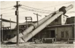
Postcard of Destroyed Smokestacks at the Electric Company (F667.2)