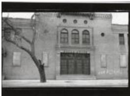
Park Opera House (1992.95.1)