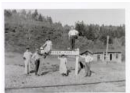
Travelers at Baxter Pass (1987.39.29)