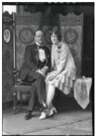
Negative of a man and woman sitting (2002.21.161)