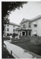
Black and white photo of La Court Hotel (1992.55.1)