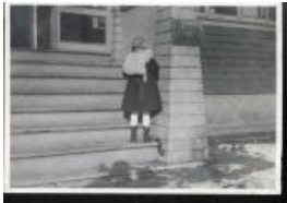
Photo of a girl (2021.23.27)