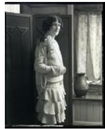
Negative of women standing (2002.21.238)