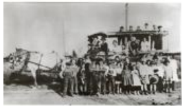
Appleton school horse drawn school bus (F385.2)