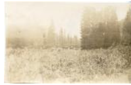
Mountain Meadow with Three Saddled Horses and Riders (2023.42.41)