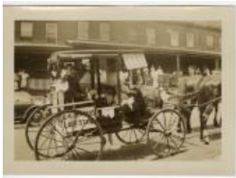
Just Married (1999.8.110)