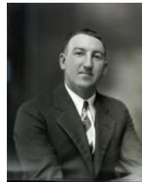
Negative of a man in a striped suit (2002.21.160)