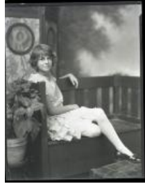
Negative of Young Lady with ruffled dress (2002.21.263)