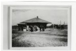
Little Book Cliff Railroad Depot & Office (F515.4)