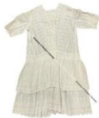
Childs White Dress (D932)