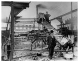
Oil shale processing (2004.44.1008)