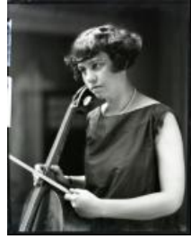
Negative of young lady with Cello (2002.21.252)