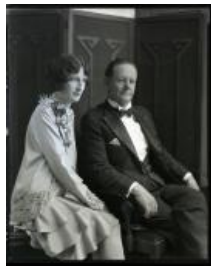
Negative of man and woman sitting (2002.21.162)