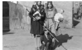
Soup Eaters (2004.44.51)