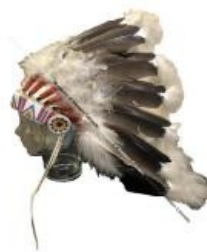
Sioux Feathered Headdress (B773.1)