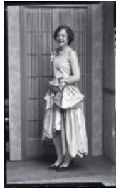
Negative of a girl in a dress. (2002.21.87)