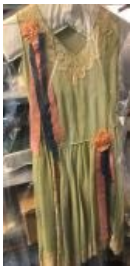
Green 1920s Dress (A935)