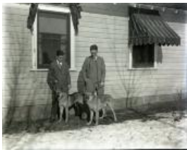
Negative of a man his son and two dogs (2002.21.169)