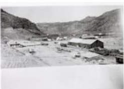
Dragon, Utah (1987.39.17)