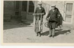
Soup Eaters (2004.44.47)