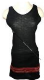
Black Bathing Suit with red stripes (B56)