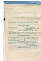
Abstract of Title (2001.49.1)