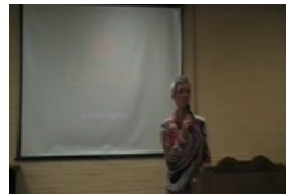
Enstrom Candy Company History (2763.2016)