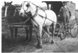
Progress Grocery (2007.57.1)