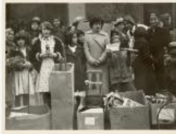
Soup Eaters (2004.44.48)