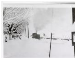
Uintah Train in the snow (1987.39.36)