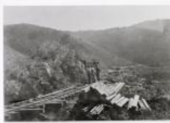
Rebuilding the tracks (1987.39.26)