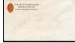
Envelope For GJHS Newspaper Orange and Black (2021.23.19)