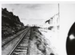
Uintah crossing bridge into Watson, Utah (1987.39.3)