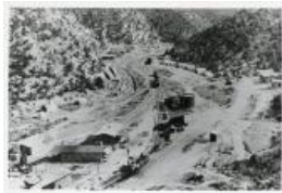
Dragon Camp, The Uintah Railway (F221.1)