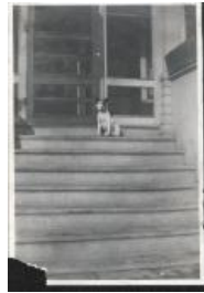
Anderson Family Dog (2021.23.25)