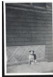
Prince the Dog (2021.23.54)