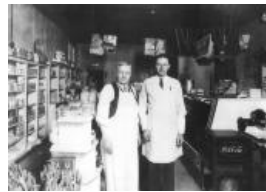
Progress Grocery (2007.57.5)