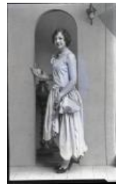
Negative of a girl in a dress. (2002.21.85)