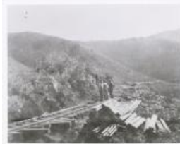
Bridge and building crew of three individuals on Pass. (1987.39.27)