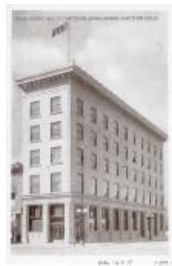
Two-sided photo depicting the Grand Valley National Bank and Apple Orchards (F399.1)