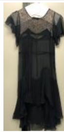
Black 1920s Dress (C694)