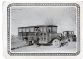
School Bus To Fruita Union High School (F879.8)