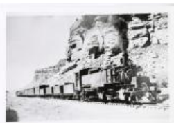
Uintah railroad locomotive (1987.39.2)