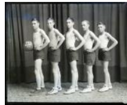
Negative of 1925 YMCA Men's champions (2002.21.247)