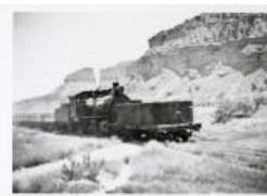
Uintah Railroad (1987.39.1)