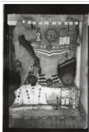
Native American Handmade Artifacts (C557.5)