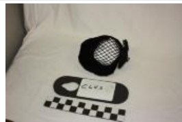
Black Hat (C693)