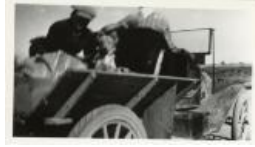
Car Outing (1999.8.109)