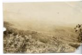
Mountain Valley with Building and Road (2023.42.40)