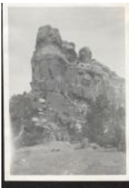
Liberty Cap (2021.23.58)