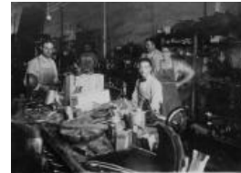
412 Main St., Mendicino (1998.44.2)