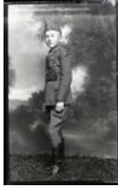
Negative of Little Boy in Uniform (2002.21.122)