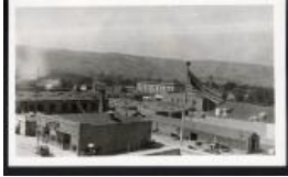
Anderson Photobook Photo (2021.23.183)