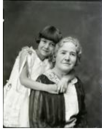
Negative of a mother and daughter (2002.21.167)