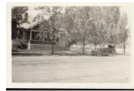
Anderson Photobook Photo (2021.23.143)