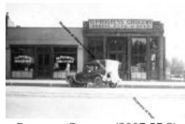
Progress Grocery (2007.57.3)