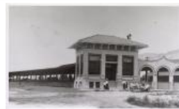
Fruit Growers Association (F526.1)