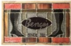
Benge's Stained Glass (2021.24.2)