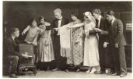
Still from a play (2021.23.215)