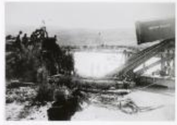
Wreck of engine #10 at bridge 2A. (1987.39.7)