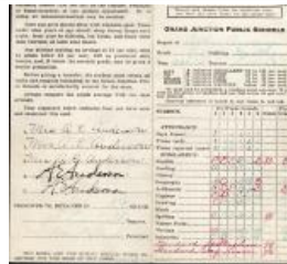
GJ Public Schools Report Card (2021.23.11)