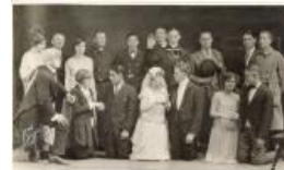
Still from a play (2021.23.216)