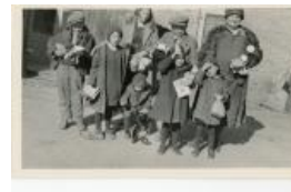
Soup Eaters (2004.44.45)