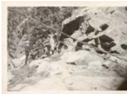
Group climbing rocks (2022.24.5)