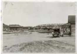
Photo of log structures with automobile (1990.8.21)