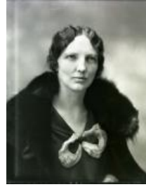
Negative of mom only (2002.21.67)