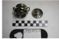
Gravy Boat Lid (1993.49.4)