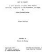
Lest We Forget: A Short History of Early Grand Valley, Colorado, Originally Called Parachute, Colorado

Independent Lumber Company Records (1982.101)