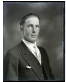
Negative of young man in suit (2002.21.245)