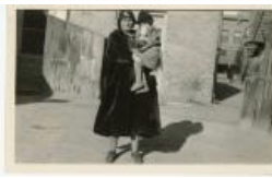
Soup Eaters (2004.44.52)