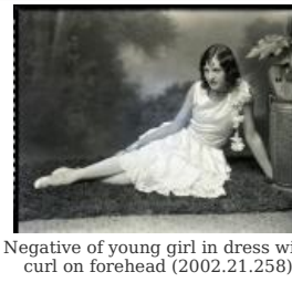
Negative of young girl in dress with curl on forehead (2002.21.258)