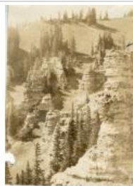
Mountain Landscape (2023.42.37)