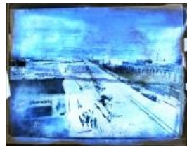
Negative of Big Scenes of the 1970's (2002.21.3)