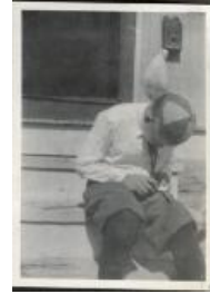
Boy with a Pigeon (2021.23.63)