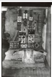
Native American Handmade Artifacts (C557.1)