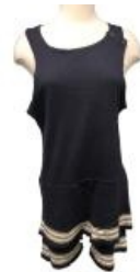
Black Swimsuit with white stripes (1982.97.11)