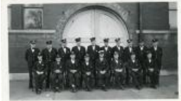
Railroad Conductors, c. 1910-1920 (F562.1)