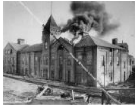
Sugar beet factory (2004.44.771)