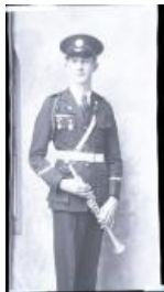
Negative of young man in band uniform with instrument (2002.21.255)