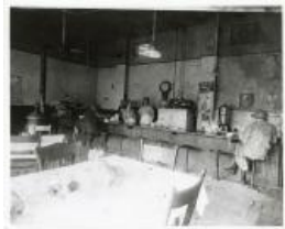
Diner interior (1990.8.22)