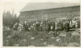
Picnic at the Odd Fellows Clubhouse (F564.5)