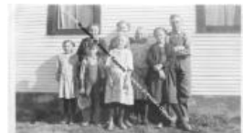
Mormon Mesa School (2009.52.4)