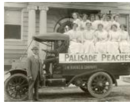
Photo of Palisade Peach Float (1979.23.79)