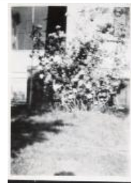
Rosebushes 961 Chipeta (2021.23.68)