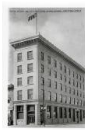
Grand Valley National Bank (F399.3)

Two-sided photo depicting Grand Junction High School and Apple Trees in Bloom [Duplicate] (F399.22)