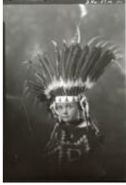
Child in Indian Headdress (F602.13)