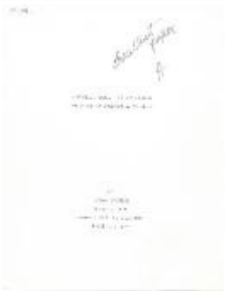
A Canyon, Coal, and A Railroad: The Story of Carpenter, Colorado (1985.114.1)