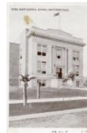
Two-sided photo depicting Grand Junction High School and Apple Trees in Bloom (F399.2)