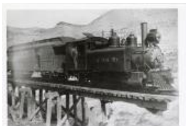
The Uintah Train (1987.39.19)