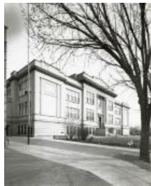
Grand Junction High School, 1920 (F397.1)