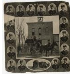
Grand Junction Fire Department (1990.58.21)