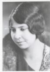
Photo of unidentified woman (1990.12.5)