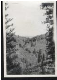
Uintah Railway (2021.23.66)