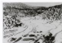
Dragon mine near Dragon, Utah. (1987.39.13)