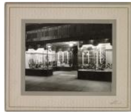
Exterior of Benge's Shoestore (2021.24.6)