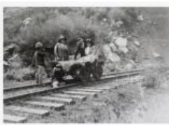
Riding on a hand car (1987.39.46)