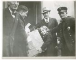
Soup Eaters (2004.44.59)