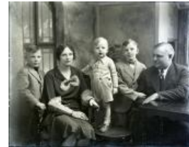
Negative of a family of 5 (2002.21.74)