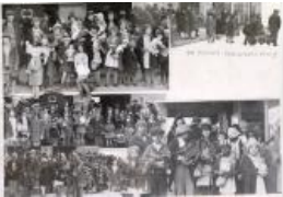
Soupeaters Collage (2004.44.62)