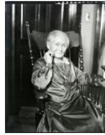
Negative of older woman in chair in a dress (2002.21.179)