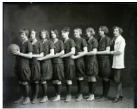
Negative of 1925 Women's YMCA team (2002.21.248)