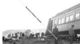
Train wreck (2007.103.7)