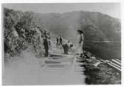
Rebuilding the Tracks (1987.39.24)