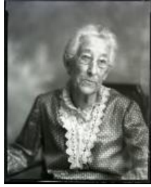
Negative of Older woman in print dress (2002.21.166)