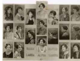
Gamma Chapter, Lambda Alpha Lambda Sorority (2021.24.19)