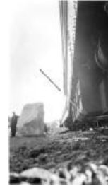
Train wreck (2007.103.5)