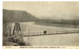
Photo of a Suspension Bridge and Grand River (1979.23.39)