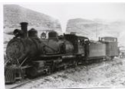
Engine #30 derailed at Rainbow Junction, Utah (1987.39.18)