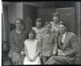
Negative of a family (Mom, Dad, Son, Three girls) (2002.21.66)