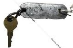
YMCA Keychain and Key (2018.17.1)