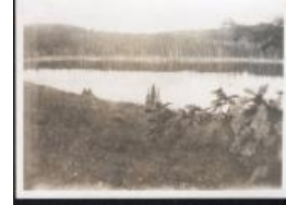
Anderson Photobook Photo (2021.23.178)