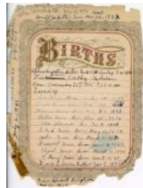
Births and Marriages page from the Butler Family Bible (2023.48.26)