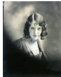
Negative of young girl in dress with curl on forehead (2002.21.261)