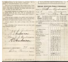
GJ Public Schools Report Card (2021.23.10)