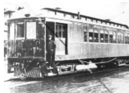
Grand River Valley Railway (1995.82.2)