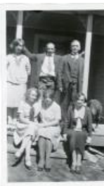
Photo of Placerville citizens (1987.26.1)