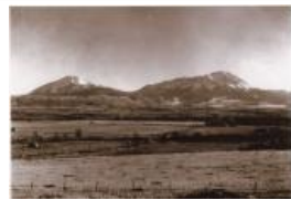
Moore Peach Ranch (F524.8)