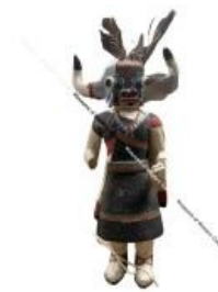
"Cow" Kachina (2023.50.6)