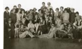
Photo of unidentified costumed group (1990.8.24)