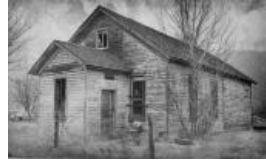
Cardiff School (2004.44.92)