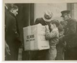
Soup Eaters (2004.44.49)