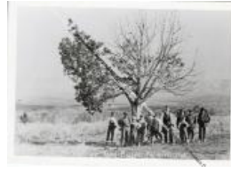
Ute Prisoner Surrender Tree (F230.2)