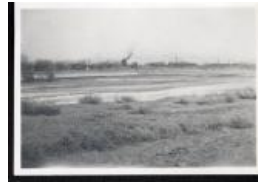
The Colorado River (2021.23.34)