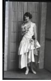
Negative of young lady in dress (2002.21.253)