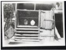
Pigeon Cage (2021.23.64)