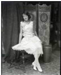
Negative of Young girl in dress with curl on forehead (2002.21.259)