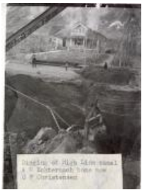
Photograph of the Digging of the High Line Canal (1979.23.28)