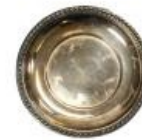
Sauceboat Tray (1993.49.2)