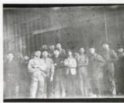
Photo of 16 unidentified individuals (1990.8.23)