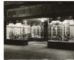
Exterior of Benge's Shoestore (2021.24.8)