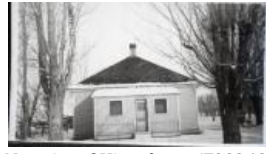
Negative of Hines home (F266.12)