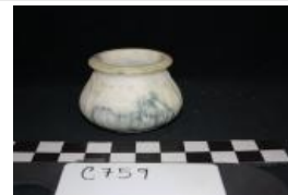
Flower vase (C759)