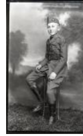
Negative of Little Boy in Uniform (2002.21.124)