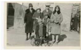
Soup Eaters (2004.44.50)