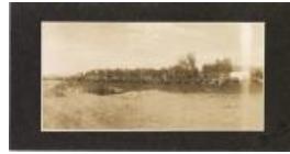
Train and boxcars at a town. (2022.4.10)