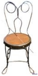
Dean Studio Child's Chair (2022.3.2)