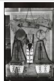
Native American Handmade Artifacts (C557.4)