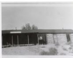
Watson Hotel at Watson, Utah (1987.39.28)