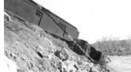
Train Wreck (2007.103.4)