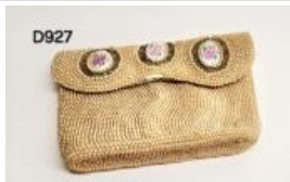
Beaded Purse (D927)