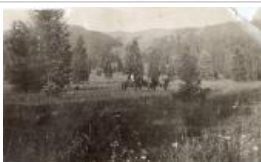
Mountain Landscape with Horses and Riders (2023.42.36)