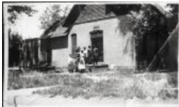
Negative of Handy Chapel with people (F266.1)