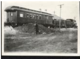
Uintah Railway at Mack (2021.23.67)