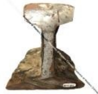
Trolley Tie (2019.65.2)