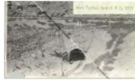
West Portal tunnel #3, 1913-134.0 (1979.23.145)