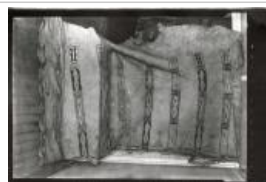
Decorated Hide (C557.2)