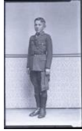
Negative of Little Boy in Uniform (2002.21.123)