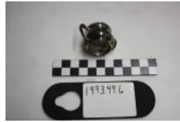
Sugar Bowl (1993.49.6)