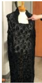
Black tent dress and belt (H877.1)