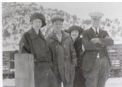
Two couples gathered at Atchee, Colorado. (1987.39.23)