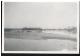
The Colorado River (2021.23.33)