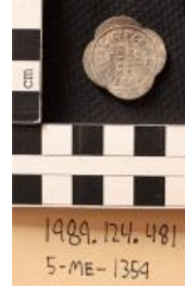
Metal Token. The Tibbs Cigar Co. Grand Junction Colo. (1989.124.481)