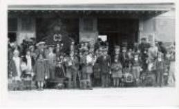
Soup Eaters (2004.44.58)