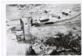
Dragon Mine near Dragon, Utah (1987.39.4)