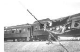
Train Wreck (2007.103.1)