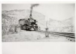
Mallet #51 crossing bridge into Atchee. (1987.39.15)