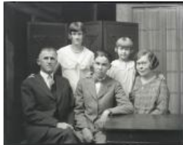
Negative of a family of 5 (Mom, Dad, two girls, one boy) (2002.21.73)