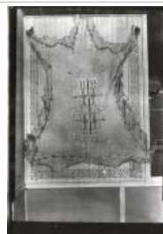
Decorated Hide (C557.3)