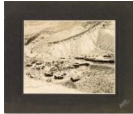
Carpenter, CO (2022.4.1)