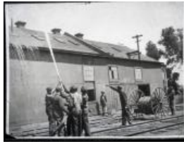
Negative of Grand Junction Roundhouse Crew at train station (F266.7)