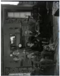
Negative of a family of four (2002.21.71)