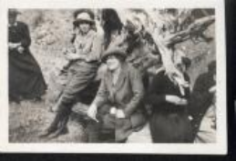
Anderson Photobook Photo (2021.23.148)