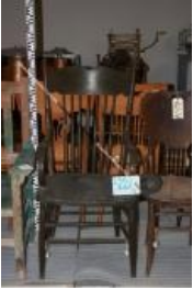
IOOF Chair (1983.162.4)