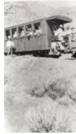
People on board the Interurban (1991.129.5)