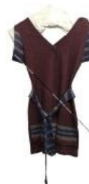
Maroon bathing suit (1983.0.4)