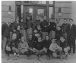
GJHS football team (2004.44.820)