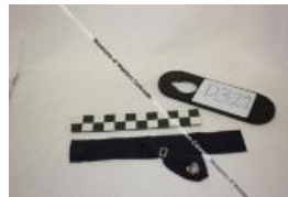
Woman's Collar (D311)