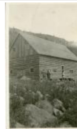
Odd Fellows Clubhouse, Island Lake, Grand Mesa (F564.4)