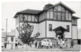
Postcard of Clifton School c. 1920 (1979.46.5)