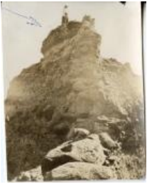
Rocky Spire with Woman Standing on Top (2023.42.39)