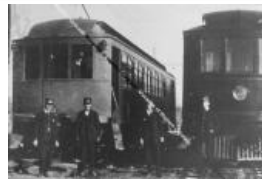
Grand River Valley Railway (1995.82.8)