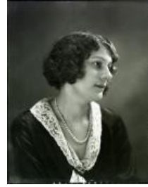
Negative of a Mother (2002.21.168)