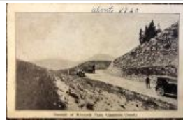
Summit Of Monarch Pass Postcard from Hunk Kimell to Ona Kimell (F564.2)