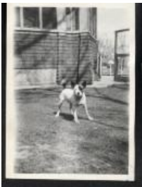
Prince the Dog (2021.23.52)