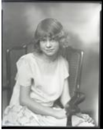
Negative of Young lady with ruffled dress (2002.21.262)