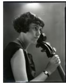
Negative of young lady with Cello (2002.21.246)