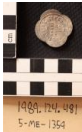
Metal Token. The Tibbs Cigar Co. Grand Junction Colo. (1989.124.481)