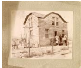
Photo of the Purdy Hotel (1979.23.161)