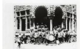
Teller Institute Band in Doorway of Grand Valley National Bank (F473.1)