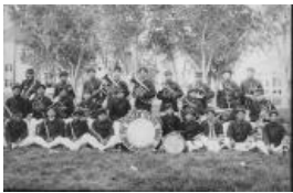
Teller Indian School Band (2006.0076)