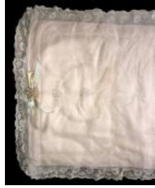
Baby Blanket (2014.95.32)