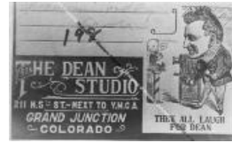
Dean Studio (2004.44.131)