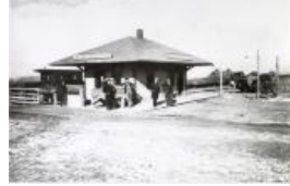
Group Photo Bookcliff Railroad Train Station (F515.6)