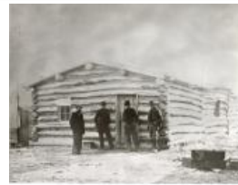
Lowell school / jail (F0520)