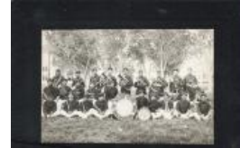
Teller Institute Band (F473.2)