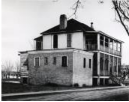
Teller Institute: Old Hospital (1979.66.2)