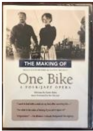
The Making of "One Bike" Opera (2021.22.1)