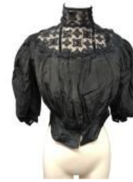
Black beaded and sequined bodice (2014.95.7)