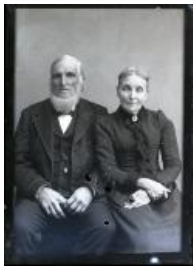
Portrait of older couple (2023.40.42)