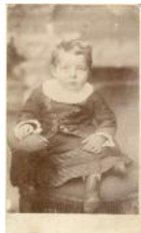
Unidentified Female Child (E96.1)