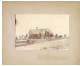
Photo of a house (2021.24.25)