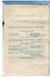
Abstract of Title (2001.49.1)