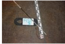
Railroad Spike (Hagerman Tunnel) (A583)