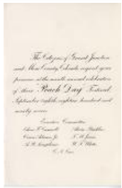
1897 "Peach Day" Invitation (1984.33.1)