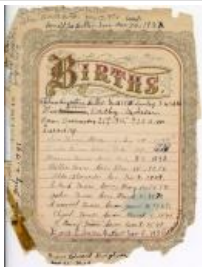
Births and Marriages page from the Butler Family Bible (2023.48.26)