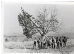
Ute Prisoner Surrender Tree (F230.2)