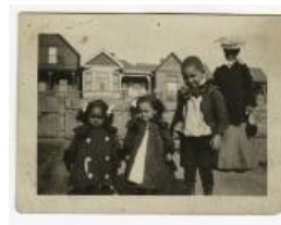
Photo of 3 children and a woman (2023.48.18)