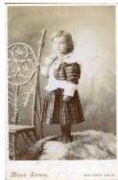
Unidentified Female Child (E96.2)