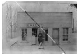
Picture of the Sitter Bakery (2004.44.892)