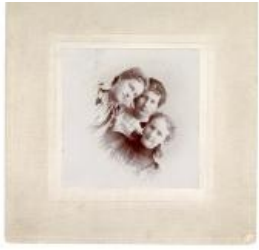
3 Women (1999.8.104)