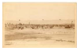
Early day Grand Junction (2004.44.5)