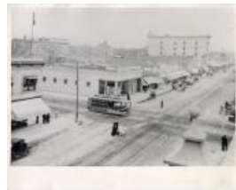
Main Street (2021.24.23)