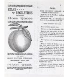
Rules and Regulations Governing the Horse Races (F664.1)