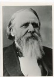
Gov. John Evans between 1814-1897 (2004.44.27)