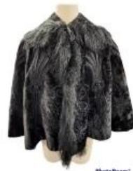
Short Cape (1982.97.21)