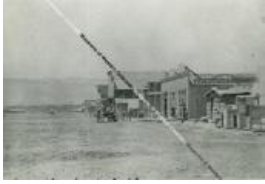
Main Street, Looking West (2004.44.790)