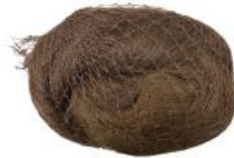
Switch of Hair (2023.42.94)