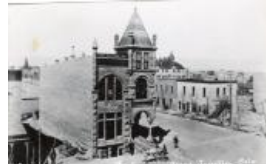
First National Bank (F381.1)