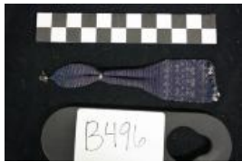
Reticule (coin purse) (B496.4)