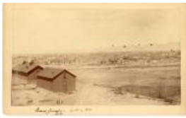
Grand Junction looking Northwest (2004.44.4)