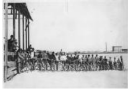
Bicycle Club (2004.44.828)