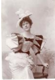
Portrait of a lady (2021.24.62)