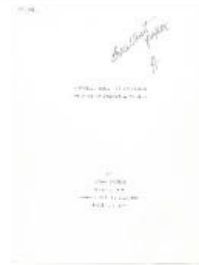
A Canyon, Coal, and A Railroad: The Story of Carpenter, Colorado (1985.114.1)

Marriage Records Mesa County, Colorado (1984.9.1)