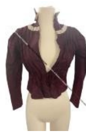
Maroon Blouse (A923)