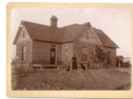
Lady, pets, and brick house (2021.24.27)