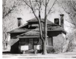
Teller Institute: East House (1979.66.6)