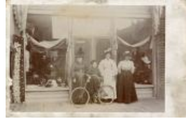
Ladies Millinery Storefront (2HA288.1)