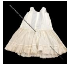
Baby Dress (2014.95.19)