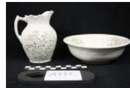
Wash Pitcher (A226.1)