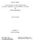
Lest We Forget: A Short History of Early Grand Valley, Colorado, Originally Called Parachute, Colorado