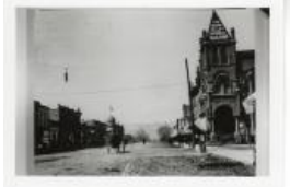
5th and Main (F483.1)