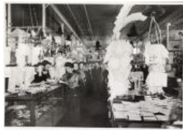
Photo and negative, Interior of the Fair Store (1999.8.35)