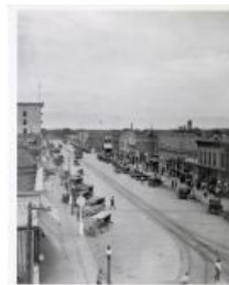
Photograph of Downtown Grand Junction (F827.2)