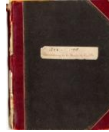
Proceedings of the Board of Health (1983.92.1)