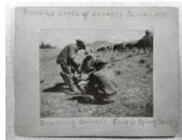
Branding Calves South of Unaweep Canyon (1980.93.2)