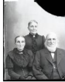
Portrait of 2 women and a man (2023.40.41)