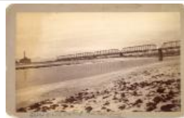
Grand River Bridge (F341.1)