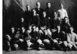
GJHS football team (2004.44.834)