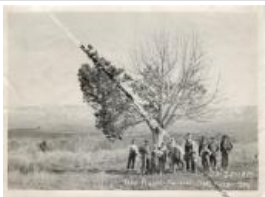
Ute Prisoner Surrender Tree (F230.1)