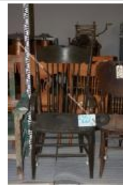
IOOF Chair (1983.162.4)