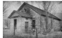
Cardiff School (2004.44.92)