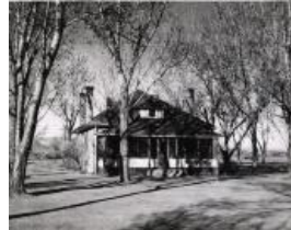
Teller Institute: West House (1979.66.5)