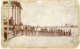
Bicycle Club at the Stockyards (F375.1)