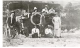
Travelers next to their vehicle (1983.77.52)