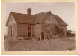
Lady, pets, and brick house (2021.24.28)