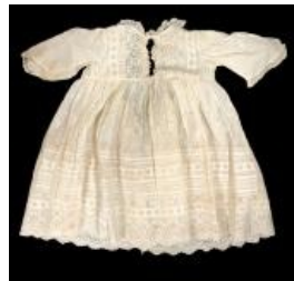
Child's Dress (2014.95.18)