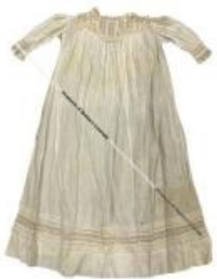
Baby Dress (D566)