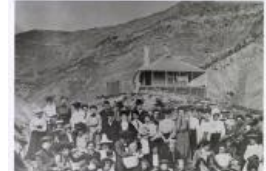
Carpenter excursion (F515.3)