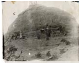
Liberty Cap (2020.16.1)