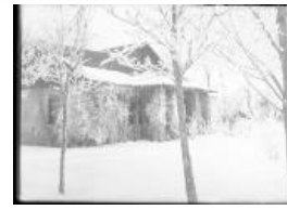
Uintah Railway Office in Winter (2023.40.56)