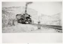
Mallet #51 crossing bridge into Atchee. (1987.39.15)