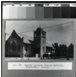
Methodist Church in Palisade (1980.115.47)