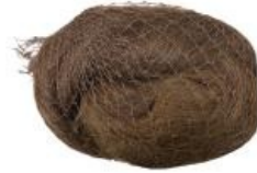
Switch of Hair (2023.42.94)