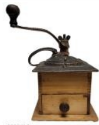
Hand Crank Coffee Mill (2020.81.3)