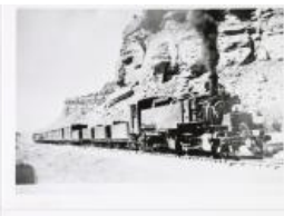
Mallet #51 north of Cooley (1987.39.11)