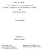
Lest We Forget: A Short History of Early Grand Valley, Colorado, Originally Called Parachute, Colorado

Independent Lumber Company Records (1982.101)