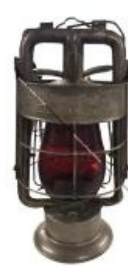
American La France Fire Engine, Red Lantern (1999.15.2)