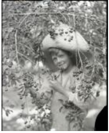
Boy with cherries at Knight's Orchard (2023.40.11)