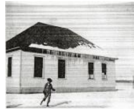
First Clifton School (1979.46.2)