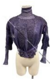
Lady's Blouse (B80)