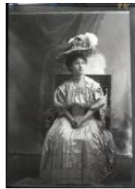
Portrait of a young woman (2023.40.32)