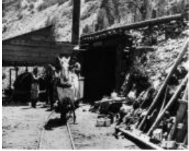
Gunnison Tunnel (2004.44.80)