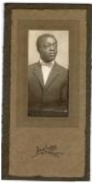
Portrait of an unidentified man (2023.48.21)