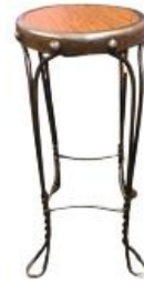
Dean Studio Table (2022.3.1)