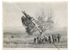
Ute Prisoner Surrender Tree (F230.1)