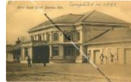
Union Depot (F0365)