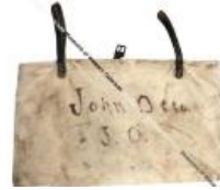
Saddle Bag (1994.25.3)