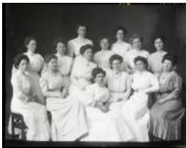
Group of ladies portrait (2023.40.6)