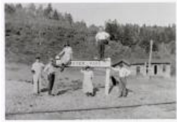
Travelers at Baxter Pass (1987.39.29)