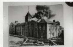
Sugar Beet Factory (F343.2)