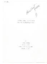
A Canyon, Coal, and A Railroad: The Story of Carpenter, Colorado (1985.114.1)