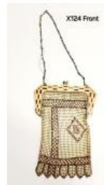
Metal Mesh Purse (X124)