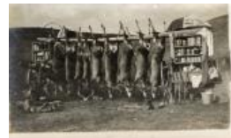
Nine Deer Trophies at Camp Outfit (F912.22)