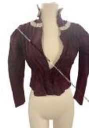
Maroon Blouse (A923)