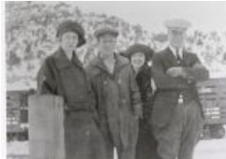
Two couples gathered at Atchee, Colorado. (1987.39.23)