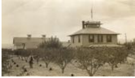
Cross Orchards House, Barn, and Orchards (1980.66.17)