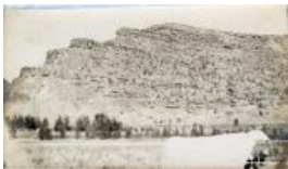
Witch's Head, 1907 (F912.19)