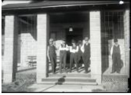
Group of men at the Uintah office (2023.40.49)