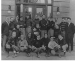
GJHS football team (2004.44.820)