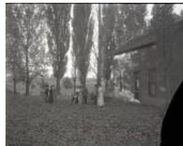
A group of people and their dog (2023.40.8)