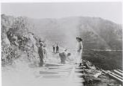
Bridge and building crew. (1987.39.25)