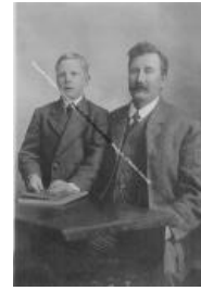
James Nelson and Son (2007.11.1)