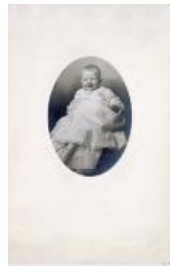
Portrait of a baby (2021.24.37)