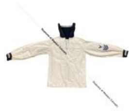
Navy Jacket (2023.42.83)