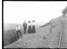
Group near tracks on Baxter Pass (2023.40.51)