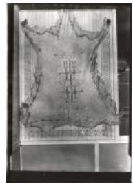
Decorated Hide (C557.3)