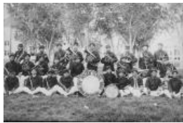
Teller Indian School Band (2006.0076)