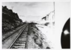
Uintah crossing bridge into Watson, Utah (1987.39.3)