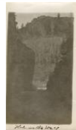
Hole in the Wall Near Rifle Falls Creek, 1907 (F912.18)