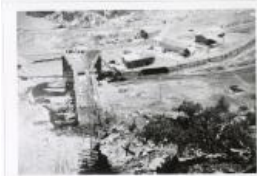
Dragon Mine near Dragon, Utah (1987.39.4)