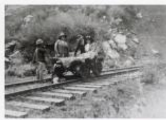
Riding on a hand car (1987.39.46)