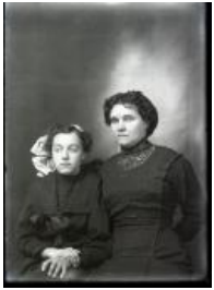
Portrait of Mother and Daughter (2023.40.34)