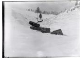
Uintah Train in Snow Wreck (1991.11.8)