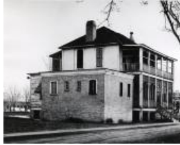
Teller Institute: Old Hospital (1979.66.2)