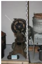
Delaval cream separator (A597)