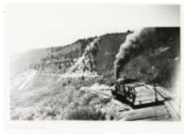
Train ascending Baxter Pass. (1987.39.10)