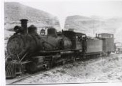
Engine #30 derailed at Rainbow Junction, Utah (1987.39.18)