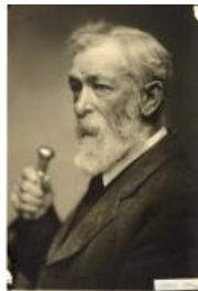
Judge Ong Portrait (F90.1)