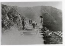
Rebuilding the Tracks (1987.39.24)