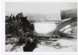
Wreck of engine #10 at bridge 2A. (1987.39.7)