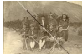
Girls Baseball team (1979.23.55)