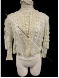
Lady's Blouse (B95L)