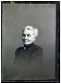
Portrait of an older woman (2023.40.30)