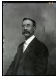
Portrait of an Unidentified Man (2023.40.40)