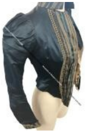
Lady's Bodice (B65)