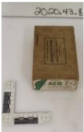
Sensitized Postcard Paper (2020.43.8)