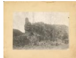
Scene in Unaweep Canyon (2019.16.2)