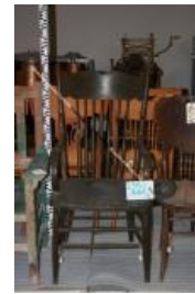
IOOF Chair (1983.162.4)