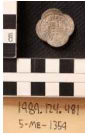
Metal Token. The Tibbs Cigar Co. Grand Junction Colo. (1989.124.481)