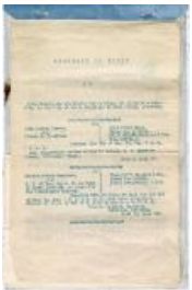
Abstract of Title (2001.49.1)