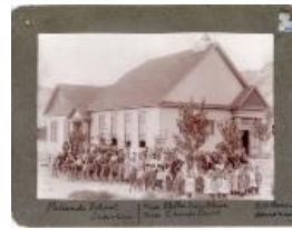
Photo of Palisade School and Students (1979.23.7)