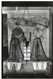
Native American Handmade Artifacts (C557.4)