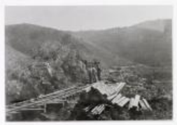
Rebuilding the tracks (1987.39.26)