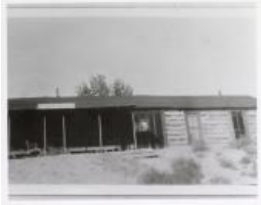
Watson Hotel at Watson, Utah (1987.39.28)