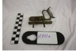
Woodworkers' Plane (H761A)