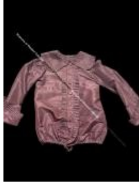
Child's Blouse (B369)