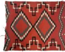
Navajo Rug (B614.1)