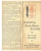
"Interesting Facts about Sugar" (2006.43.4)