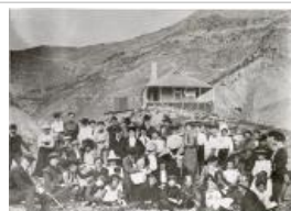
Carpenter excursion (F515.5)