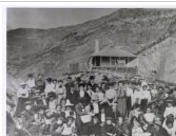
Carpenter excursion (F515.3)