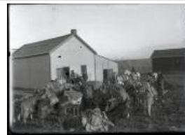
Pack of mules in Mack (2023.40.48)