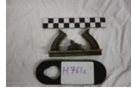
Woodworkers Plane (H761C)