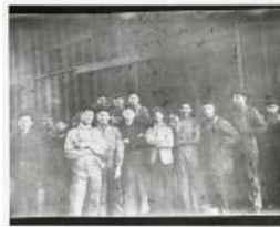
Photo of 16 unidentified individuals (1990.8.23)