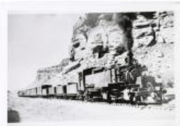
Uintah railroad locomotive (1987.39.2)