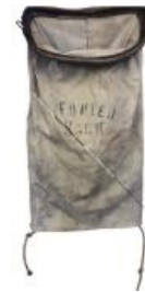
Fowler Picking Sack (CU 1986.40.1)