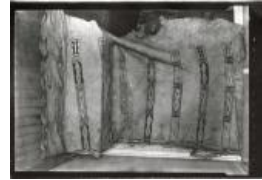
Decorated Hide (C557.2)