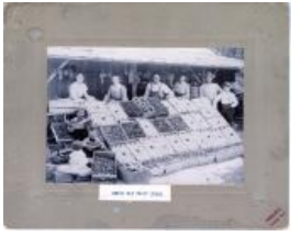
Early day fruit stand (1979.23.82)