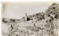
Sugar Beet Rock in Plateau Canyon, 1907 (F912.21)