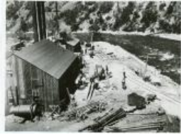
Gunnison Tunnel in Black Canyon (2004.44.81)