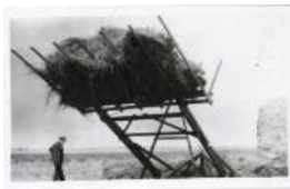
Wheat Stacker (1980.169.1)