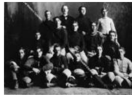
GJHS football team (2004.44.834)