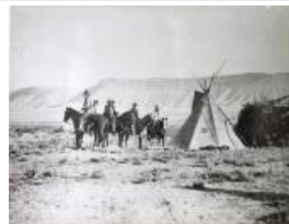
Ute Camping Trip (F347.1)