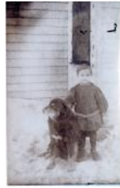
Elva Hughes and dog (2019.8.2)