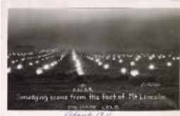
Photo of Smudging Scene (1979.23.1)