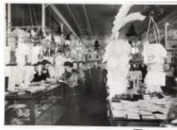
Photo and negative, Interior of the Fair Store (1999.8.35)