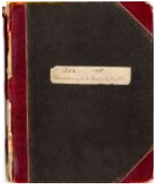
Proceedings of the Board of Health (1983.92.1)