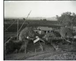
Farm Scene (2023.40.18)