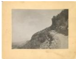
9 Mile Hill in Unaweep (2019.16.1)