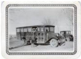
School Bus To Fruita Union High School (F879.8)