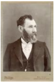
Judge Joseph Ong Portrait (2018.113)