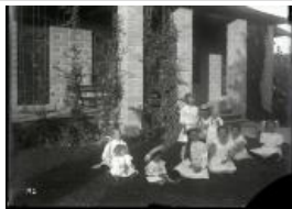
Group of young girls outside of URY office (2023.40.45)