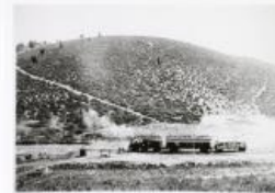
4th of July excursion train. (1987.39.9)