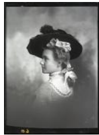
Portrait of a young woman (2023.40.31)