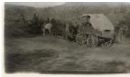
At the Atwood Bridge, 1907 (F912.16)