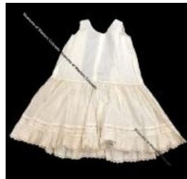
Baby Dress (2014.95.19)