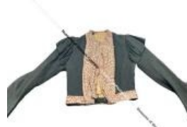
Lady's Blouse (B44)