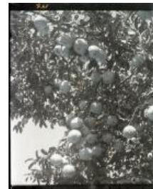
Apple Scene (2023.40.9)