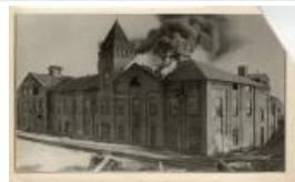
Sugar Beet Factory (F343.3)