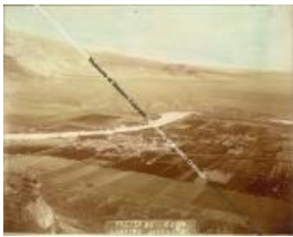
Palisade Colorado (1979.23.114)