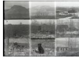
Composite of 9 farm pictures (2023.40.39)