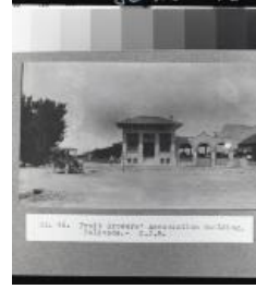
Fruit Growers Association Building in Palisade (1980.115.46)