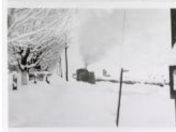
Uintah Train in the snow (1987.39.36)