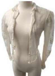
Ladies Blouse (A939.1)