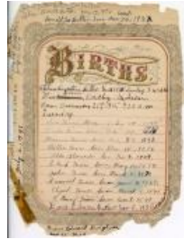
Births and Marriages page from the Butler Family Bible (2023.48.26)