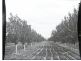
Orchard Scene (2023.40.15)