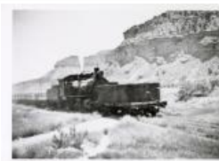
Uintah Railroad (1987.39.1)