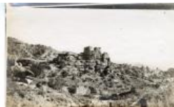
Bryan and Plateau Canyon (F912.20)