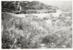
Train traveling between Columbine and McAndrews Lake (1987.39.14)