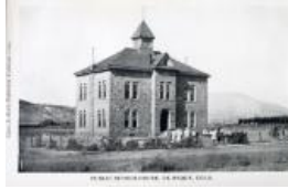
de Beque Public Schoolhouse (2022.25.2)