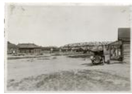
Photo of log structures with automobile (1990.8.21)