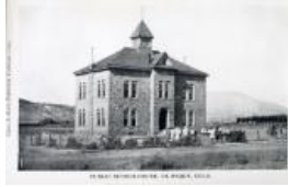
de Beque Public Schoolhouse (2022.25.1)