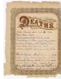
Deaths and Memoranda page from the Butler Family Bible (2023.48.27)