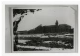
Sugar Beet Factory (F343.1)