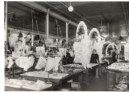
Photo and negative, Interior of the Fair Store (1999.8.34)