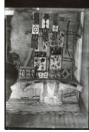
Native American Handmade Artifacts (C557.1)