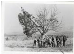
Ute Prisoner Surrender Tree (F230.2)