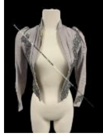
Lady's Blouse (B40)