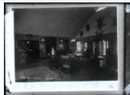
Interior of the Uintah Hotel (2023.40.47)