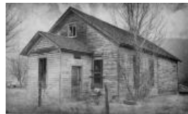
Cardiff School (2004.44.92)