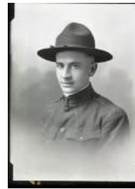
Portrait of a Soldier (2023.40.33)