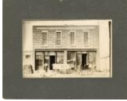
Wagon And Buggy Shop (E144.6)