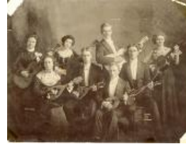
Grand Junction Mandolin Club (F831.1)