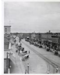
Photograph of Downtown Grand Junction (F827.2)