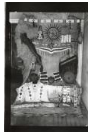
Native American Handmade Artifacts (C557.5)