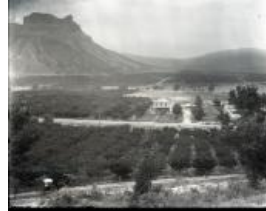
Agriculture Scene of Valley (2023.40.5)