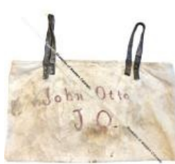
Saddle Bag (1994.25.2)