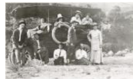
Travelers next to their vehicle (1983.77.52)