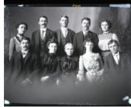
Portrait of a family (2023.40.12)