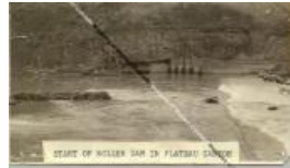
Roller Dam in Plateau Canyon (1979.23.84)