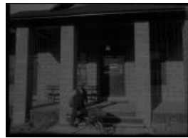
Man with wheelbarrow in front of the Uintah office (2023.40.55)