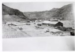
Dragon, Utah (1987.39.17)