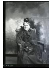
Portrait of an Older Woman (2023.40.29)