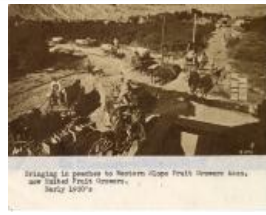
Photo of Bringing in Peaches to Western Slope Fruit Growers Association (1979.23.2)