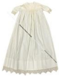
Baby Dress (B497.3)