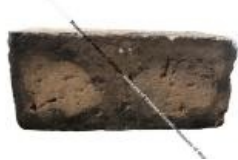
Brick from St. Joe Church (2019.65.1)