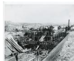
Gunnison Tunnel (2004.44.78)