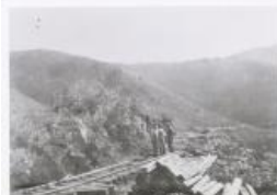
Bridge and building crew of three individuals on Pass. (1987.39.27)