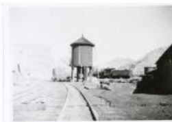
Engine #11 and water cars at Atchee. (1987.39.12)