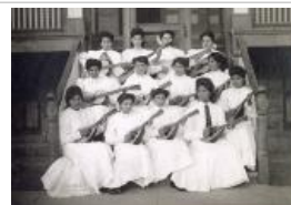
Teller Institute Girls Mandolin Club (F627.1)