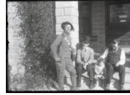
Austrian Man outside Uintah Railway Company (2023.40.52)