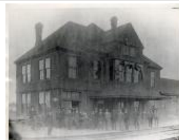
Grand Junction Railroad Station (F720.59)