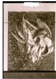
Trout from Cebolla, CO (2023.40.28)