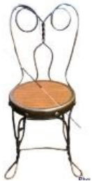
Dean Studio Child's Chair (2022.3.2)