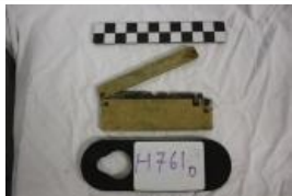
Blade box (H761D)