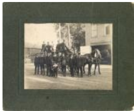
Grand Junction Fire Department Members and Wagon (1990.58.23)