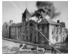
Sugar beet factory (2004.44.771)