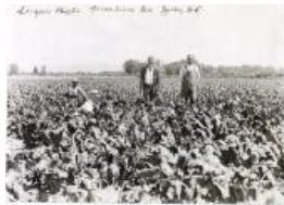
Sugar Beet Field (1980.169.2)