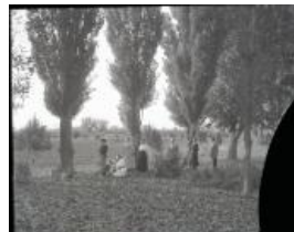
A group of people and their dog (2023.40.7)