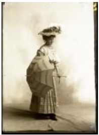
Photo of a young woman (2023.40.25)