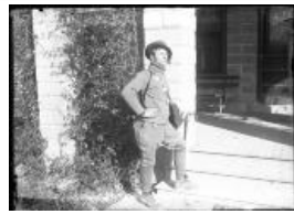
Unnamed Austrian man (2023.40.54)