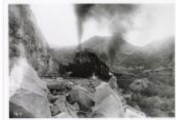
Train descending into Baxter Pass. (1987.39.8)