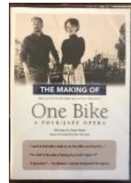
The Making of "One Bike" Opera (2021.22.1)