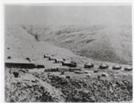
Scene of a town and train (1987.39.38)