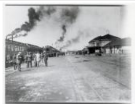
Grand Junction Railroad Station & Yards, 1900-1920 (F720.57)