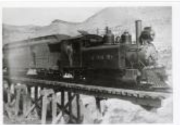
The Uintah Train (1987.39.19)