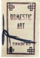
Domestic Art Booklet (2023.42.64)