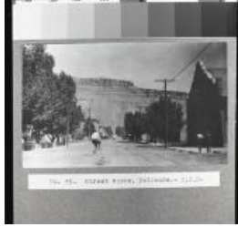
Palisade street scene (1980.115.45)