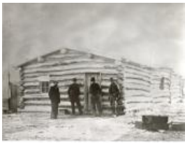
Lowell school / jail (F0520)