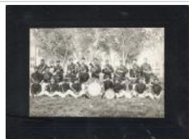
Teller Institute Band (F473.2)