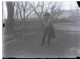
Woman dressed androgynously (2023.40.43)