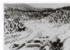
Dragon mine near Dragon, Utah. (1987.39.13)