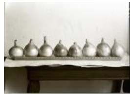
Onions from the Mile High Seed Co. (2023.40.26)