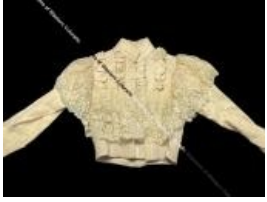
Lady's Blouse (B191)