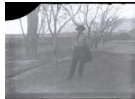
Woman dressed androgynously (2023.40.44)