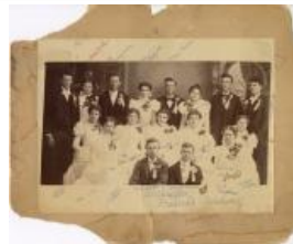
Washington Friends Academy (1982.202.9)