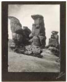
Group in front of large rocks (2021.24.29)