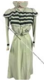
2 piece dress with detachable collar (1982.220.17)