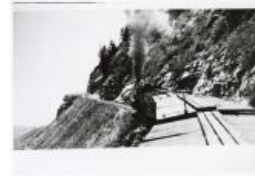
Uintah locomotive climbing 7.5% grade on Baxter Pass. (1987.39.5)