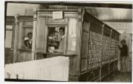
Palisade Post Office Interior (1999.8.55)