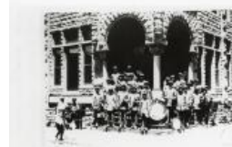
Teller Institute Band in Doorway of Grand Valley National Bank (F473.1)