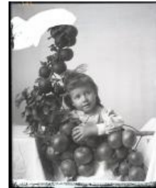
Photo of a girl and her apples (2023.40.10)