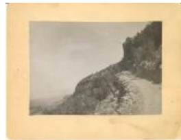
9 Mile Hill in Unaweep (2019.16.1)