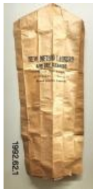
Dry Cleaning Bag (1992.62.1)