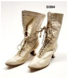
White Boots (D394)