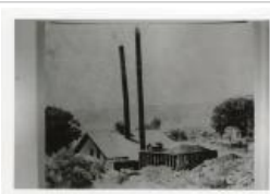
Grand Junction City Pumping Plant, c. 1902 (F521.1)