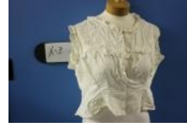
corset cover (X3)