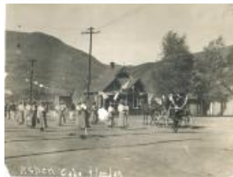
Black and White photo of Aspen Colorado (2HA17.6)