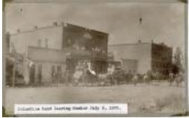
Columbine Band at Meeker (F192.1)