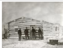
Lowell school / jail (F0520)