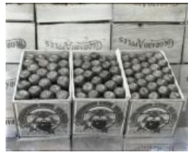
Mt. Lion Apples (2023.40.2)