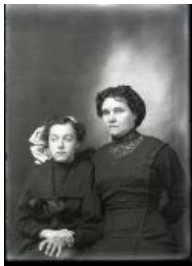
Portrait of Mother and Daughter (2023.40.34)