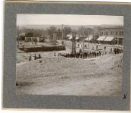
Fair Store Construction (1999.8.38)