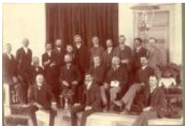
Group inside Palisade First Baptist Church (1979.23.181)