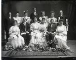
Graduating class of 1905 (GJHS) (2023.40.3)