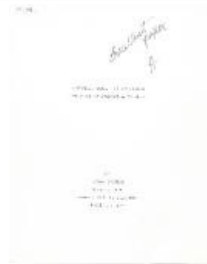
A Canyon, Coal, and A Railroad: The Story of Carpenter, Colorado (1985.114.1)