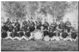
Teller Indian School Band (2006.0076)