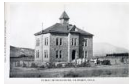
de Beque Public Schoolhouse (2022.25.1)