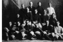
GJHS football team (2004.44.834)