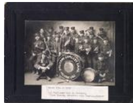
Photo of First Uniformed Palisade Band (1979.23.13)