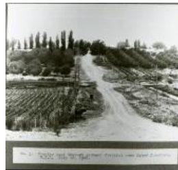
Orchard district roads (1980.115.5)