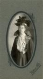
Portrait of a woman (2021.24.45)