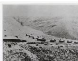
Scene of a town and train (1987.39.38)