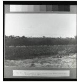
View of orchards (1980.115.16)