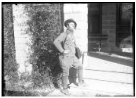
Unnamed Austrian man (2023.40.54)