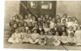
Lowell Room II (2007.74.12)