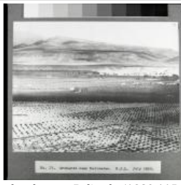
Orchards near Palisade (1980.115.23)