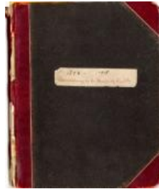
Proceedings of the Board of Health (1983.92.1)