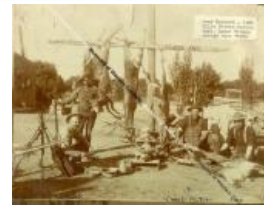
Deer Hunters (1979.23.122)