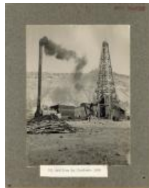
Photo of Oil Drilling in Palisade (1979.23.65)