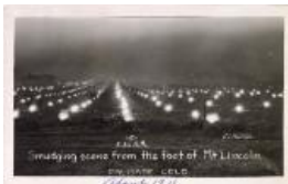
Photo of Smudging Scene (1979.23.1)