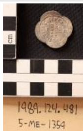
Metal Token. The Tibbs Cigar Co. Grand Junction Colo. (1989.124.481)