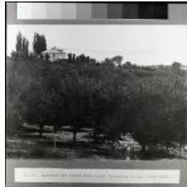
Farming country (1980.115.7)