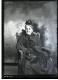
Portrait of an Older Woman (2023.40.29)