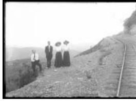
Group near tracks on Baxter Pass (2023.40.51)