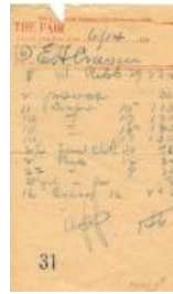
Fair Store Receipt (1999.8.123)