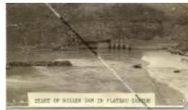
Roller Dam in Plateau Canyon (1979.23.84)