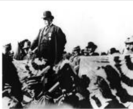
Gunnison Tunnel (2004.44.86)