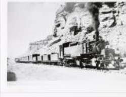
Mallet #51 north of Cooley (1987.39.11)