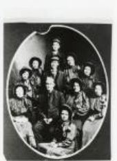
Salvation Army (F468.1)