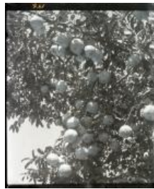
Apple Scene (2023.40.9)