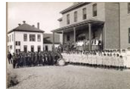
Group Portrait of Indian School Band in Front of School Buildings (F627.3)