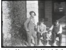
Austrian Man outside Uintah Railway Company (2023.40.52)