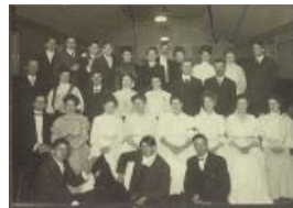
Party in Bower Hall (1979.23.191)