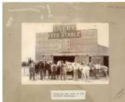
Photograph of a Livery and Feed Stable (1979.23.66)