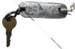
YMCA Keychain and Key (2018.17.1)