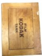
Film Development Tank (E15)