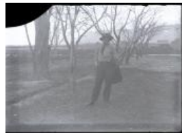
Woman dressed androgynously (2023.40.44)