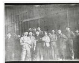
Photo of 16 unidentified individuals (1990.8.23)