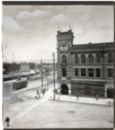
Photo of Downtown Grand Junction (1990.8.18)