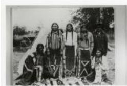
Ute Indians, c. 1900 (F469.1)