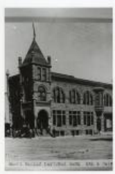
Grand Valley National Bank (F213.1)