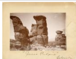
Jones Pulpit/Devil's Kitchen, Colorado National Monument (F296)