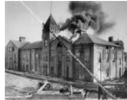
Sugar beet factory (2004.44.771)