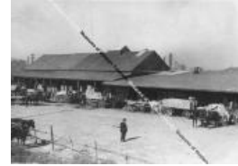
fruit growers association (2004.44.983)