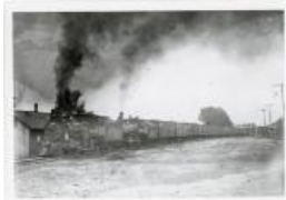
Photo of Colorado Midland ten-wheelers (1990.10.42)