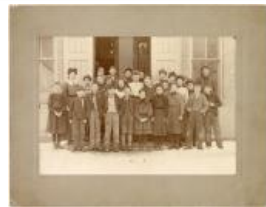
Class Photo of Class, "Fruita 7th Grade" (2019.8.48)