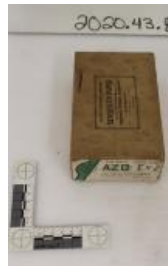
Sensitized Postcard Paper (2020.43.8)