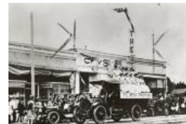
Peach Day Parade (F463.1)