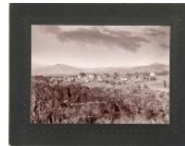
View of Mesa CO, June 22, 1908 (1979.114.8)