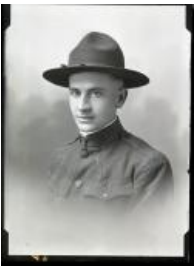
Portrait of a Soldier (2023.40.33)