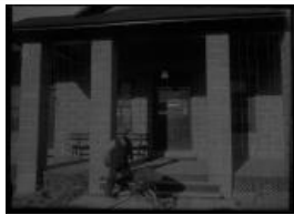
Man with wheelbarrow in front of the Uintah office (2023.40.55)