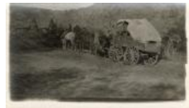
At the Atwood Bridge, 1907 (F912.16)