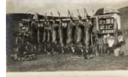
Nine Deer Trophies at Camp Outfit (F912.22)