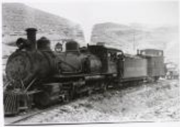
Engine #30 derailed at Rainbow Junction, Utah (1987.39.18)