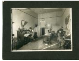
Spencer Seedless Apple Co. Office (F546.1)