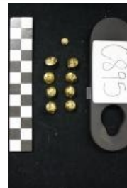
Military Buttons, C (C895)