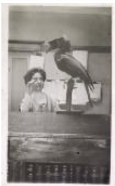
Picture of Woman with Perched Bird (1979.61.13)