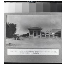
Fruit Growers Association Building in Palisade (1980.115.46)