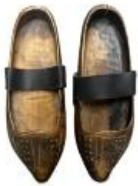
Pair of wooden clogs (1998.64.1)