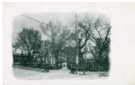
Photo of plaza in Santa Fe, New Mexico (1988.40.17)