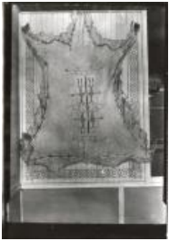
Decorated Hide (C557.3)