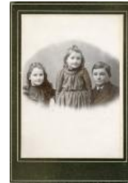
Three Unidentified Children - One Boy, Two Girls (F720.55)