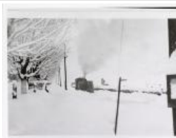
Uintah Train in the snow (1987.39.36)