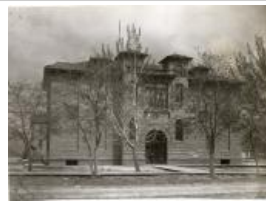
Lowell School (1991.52.5)