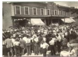
Street Scene -- Jordan Inn (1979.23.102)