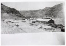
Dragon, Utah (1987.39.17)