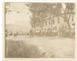
Fourth of July Celebrations in De Beque outside of the Hotel Moore (F811.1)