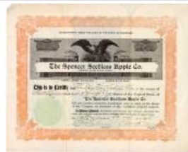
Stock Certificate for the Spencer Seedless Apple Co. (2023.28.1)