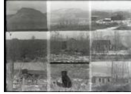
Composite of 9 farm pictures (2023.40.39)