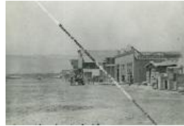
Main Street, Looking West (2004.44.790)