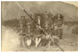
Girls Baseball team (1979.23.55)