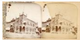
Stereograph of Grand Valley National Bank (F213.2)