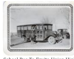
School Bus To Fruita Union High School (F879.8)