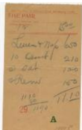
Fair Store Receipt (1999.8.125)