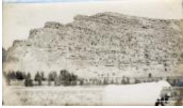
Witch's Head, 1907 (F912.19)