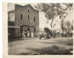
Fourth of July Celebrations in De Beque (F811.2)