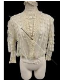
Lady's Blouse (B95L)