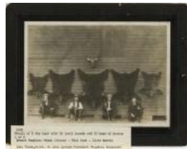
Photo of the Results of a Bear Hunt (1979.23.98)