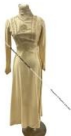
Wedding Dress (1979.74.1)