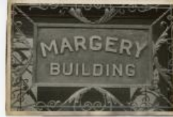
Margery Building (2004.44.98)