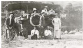
Travelers next to their vehicle (1983.77.52)