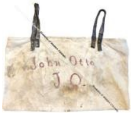
Saddle Bag (1994.25.2)