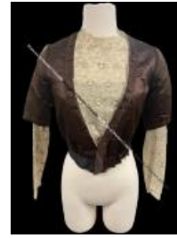
Lady's Blouse (B104)