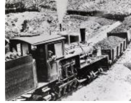
Little Bookcliff Railway with child (F828.1)