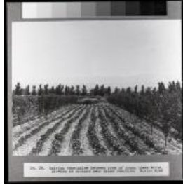
Orchard view (1980.115.26)