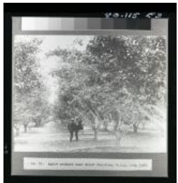
Men in an apple orchard (1980.115.17)