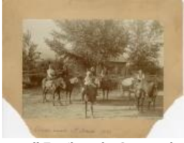
Lasswell Family at the Crossroads at Mesa (F64.1)