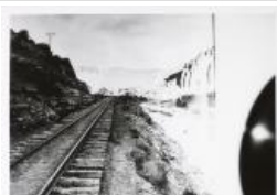
Uintah crossing bridge into Watson, Utah (1987.39.3)