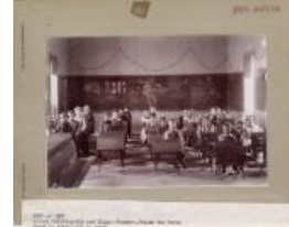
Photo of Palisade Classroom circa 1900 (1979.23.8)