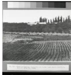
Farming country (negative) (1980.115.10)