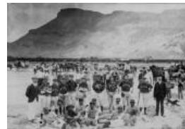
Teller Institute baseball team (2004.44.826)