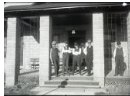
Group of men at the Uintah office (2023.40.49)