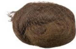
Switch of Hair (2023.42.94)