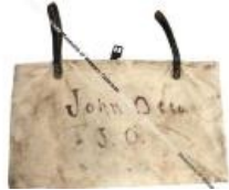
Saddle Bag (1994.25.3)