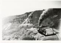
Train ascending Baxter Pass. (1987.39.10)