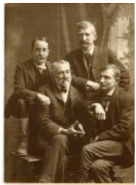
The Four Horseman Portrait (2HA17.3)