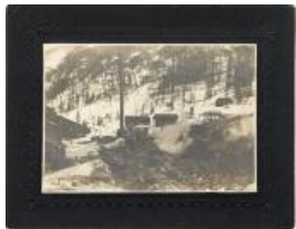
Smoldering Ruins of Stamp Mill After Fire (1979.87.7)