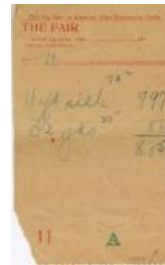
Fair Store Receipt (1999.8.128)