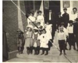
Group at M.E. Church (1979.23.178)