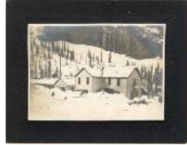
Aftermath of Avalanche on Rooming House (1979.87.5)