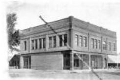
IOOF Building-early (2008.70.2)