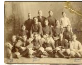
GJHS Football Team, 1900 (C562.1)