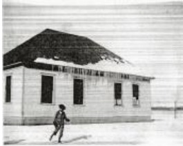
First Clifton School (1979.46.2)