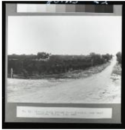
Country roads (1980.115.13)