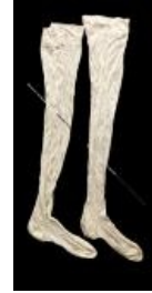
Cream stockings (2014.95.28)