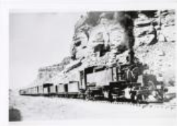
Uintah railroad locomotive (1987.39.2)