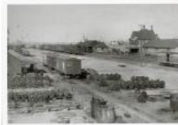
Grand Junction Railroad Line yard, 1904 (2HA63.6)