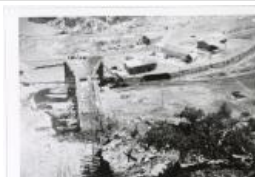
Dragon Mine near Dragon, Utah (1987.39.4)