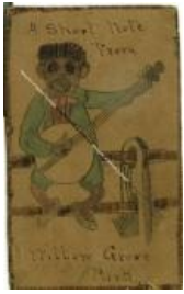
Leather Postcard (1999.37.3)