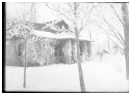
Uintah Railway Office in Winter (2023.40.56)