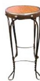
Dean Studio Table (2022.3.1)