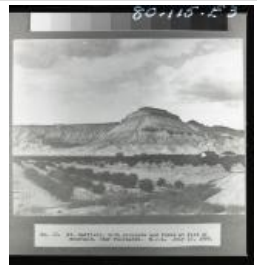
View of Mt. Garfield and nearby orchards (1980.115.21)