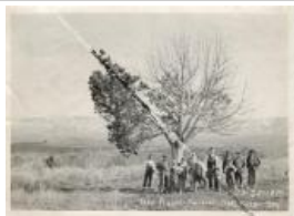
Ute Prisoner Surrender Tree (F230.1)