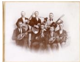
Group of guitar players (2021.24.15)