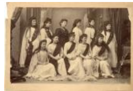
Group of young ladies dressed up in togas (2021.24.16)