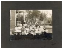
Group of Children (2021.24.12)