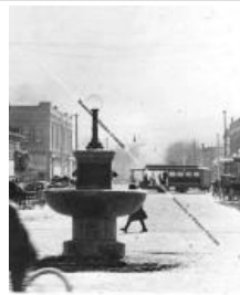
Fifth Street (2004.44.748)