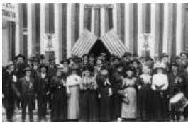
Gar Convention (2004.44.835)