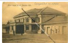
Union Depot (F0365)