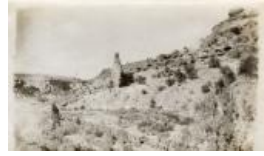
Sugar Beet Rock in Plateau Canyon, 1907 (F912.21)