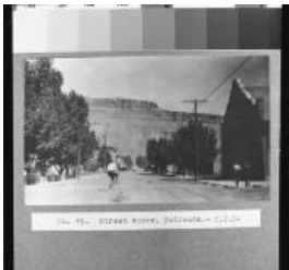
Palisade street scene (1980.115.45)