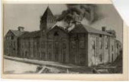
Sugar Beet Factory (F343.3)