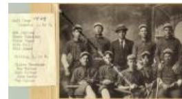
Baseball Team (1979.23.151)