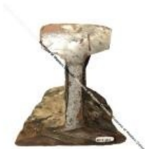
Trolley Tie (2019.65.2)