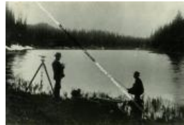
Grand Mesa (2004.44.1131)