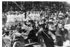
President William Howard Taft (2004.44.1042)