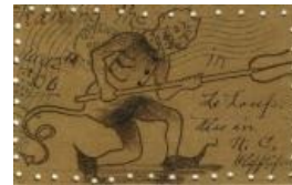
Leather Postcard (1999.37.1)