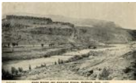
Photograph of State Bridge and Pumping Plants (1979.23.34)