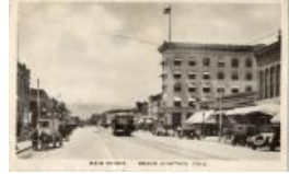
Main Street Postcard (1999.8.40)