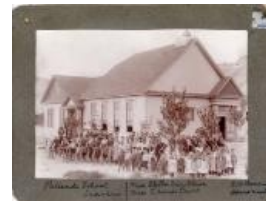
Photo of Palisade School and Students (1979.23.7)