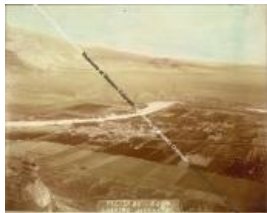
Palisade Colorado (1979.23.114)