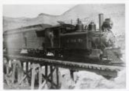
The Uintah Train (1987.39.19)