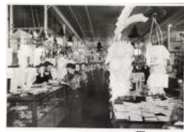
Photo and negative, Interior of the Fair Store (1999.8.35)