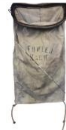
Fowler Picking Sack (CU 1986.40.1)