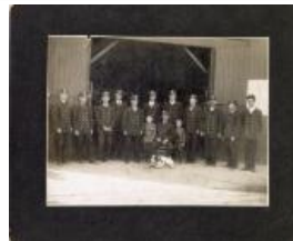
Grand Junction Fire Department in front of Firehouse (1990.58.17)