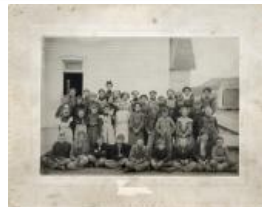
Mesa School Class Photo (1979.114.6)