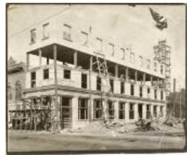
Construction of Grand Valley National Bank (F381.2)