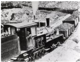
Little Bookcliff Railway With Child (F828.2)