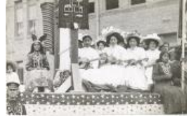
Teller Institute Parade (2Ha35.1)