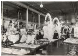
Photo and negative, Interior of the Fair Store (1999.8.34)