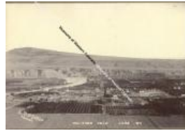
Panorama Palisade (1979.23.108)