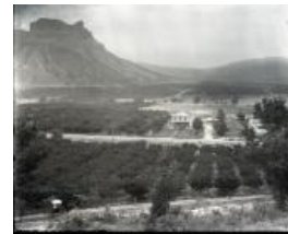
Agriculture Scene of Valley (2023.40.5)