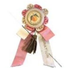
Pink 1900 Peach Day Ribbon (1990.14.2)