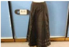
Lady's Petticoat (B121)