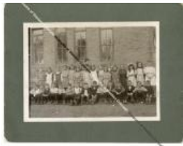
Appleton School (2007.74.15)