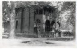
Dr. Bull's Residence (2HA1.1)