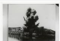
Redlands Canal Construction (F482.1)