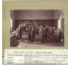
Photograph of Palisade Classroom circa 1900 (1979.23.17)