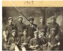
Palisade boys baseball (1979.23.110)