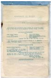
Abstract of Title (2001.49.1)