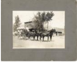
Two Couples in a Horse-Drawn Buggy, De Beque (F811.3)