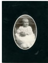
Portrait of a Baby (2021.24.40)