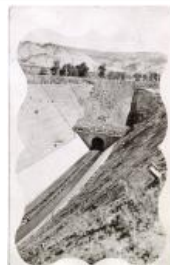
Gunnison Tunnel (1979.61.22)