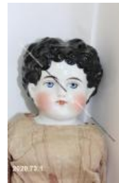
Porcelain Doll (2020.73.1)