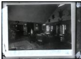
Interior of the Uintah Hotel (2023.40.47)