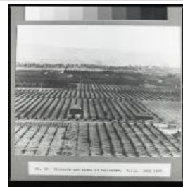
Orchards near Palisade (1980.115.24)