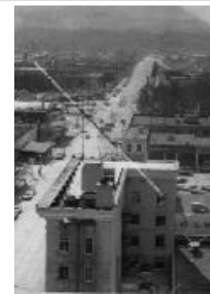
Fifth Street (2004.44.752)