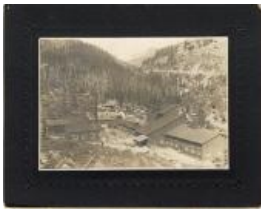
Camp Bird Mill and Residences (1979.87.1)