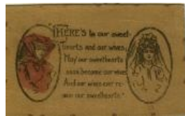
Leather Postcard (1999.0037.0002)