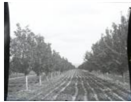
Orchard Scene (2023.40.15)