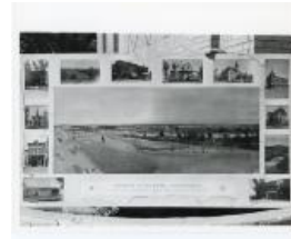
Grand Junction Colorado Collage (2004.44.117)