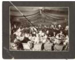
Lincoln Park Barn (2007.74.16)