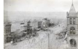
400 Block of Main Street (F377.1)