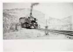
Mallet #51 crossing bridge into Atchee. (1987.39.15)