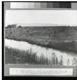
Young orchard (1980.115.11)