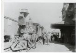
Photo of narrow gauge locomotive No. 164 at depot (1990.10.39)