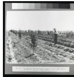
Man digging irrigation ditches (1980.115.12)