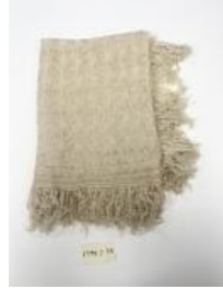
Tan Silk Shawl (1994.7.33)