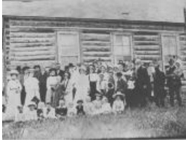
Dove family (1984.80.10)