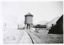
Engine #11 and water cars at Atchee. (1987.39.12)