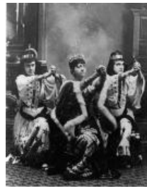
Park opera house (2004.44.1009)