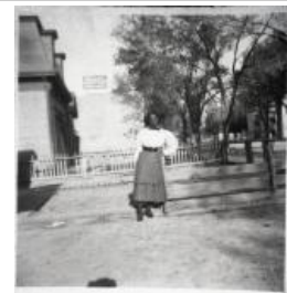
Negative of Eunice Russell (F266.11)