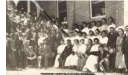
Pride of the Rockies. The M.E. Sunday School, Palisade, Colorado 1908-169.0 (1979.23.179)