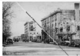
Fifth Street (2004.44.749)