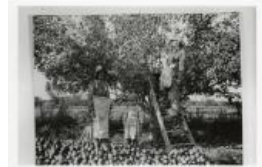
MVB Page Ranch (F460.1)