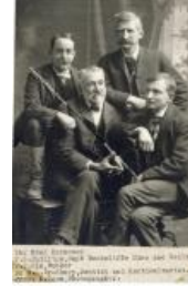
Photograph of the Four Horsemen (2HA17.2)