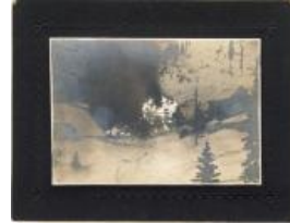
Stamp Mill Ruins on Fire (1979.87.6)