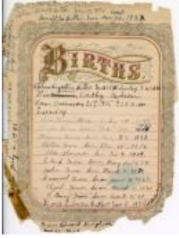
Births and Marriages page from the Butler Family Bible (203.48.26)