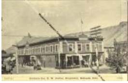
Jordan's Inn (1979.23.158)