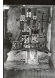
Native American Handmade Artifacts (C557.1)