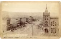
400 Block of Main Street (F377.4)