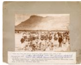
Photograph of Teller Institute Baseball Team Vs Palisade (1979.23.12)