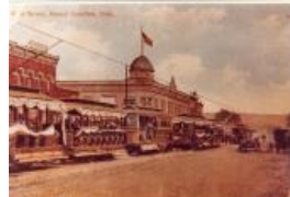
Photo of Main street, Grand Junction with street cars (1990.10.47)