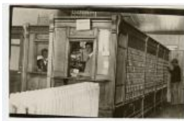
Palisade Post Office Interior (1999.8.55)