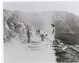
Bridge and building crew. (1987.39.25)