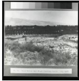
Fruit District (1980.115.14)