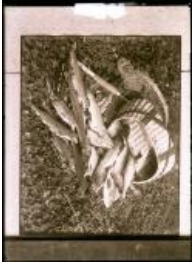
Trout from Cebolla, CO (2023.40.28)