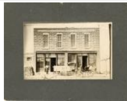
Wagon And Buggy Shop (E144.6)