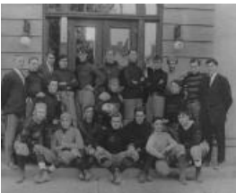
GJHS football team (2004.44.820)