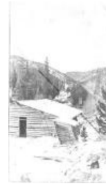
Pyramid Milling and Mining Co (1999.44.8)