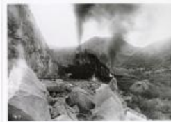
Train descending into Baxter Pass. (1987.39.8)