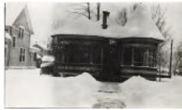
303 Ouray Avenue (F721.2)