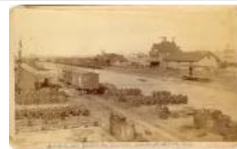
D&RG RR Yards and Station (F219.2)