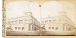
Stereograph of Mesa County Bank (F212.1)