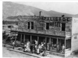
Palisade Hotel (2004.44.908)