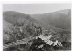
Rebuilding the tracks (1987.39.26)