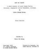
Lest We Forget: A Short History of Early Grand Valley, Colorado, Originally Called Parachute, Colorado

Independent Lumber Company Records (1982.101)