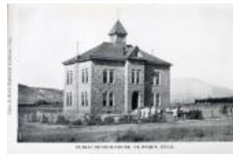
de Beque Public Schoolhouse (2022.25.2)