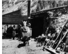
Gunnison Tunnel (2004.44.80)