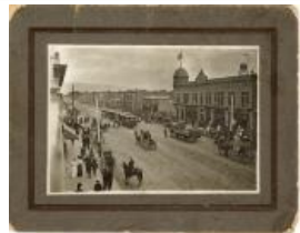
First Streetcars in Grand Junction, 1909 (F751.1)