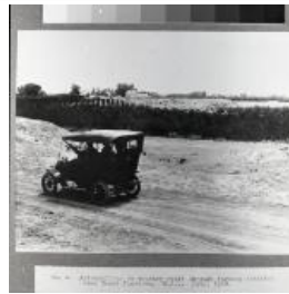
Driving through farm district (1980.115.4)