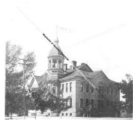
GJ High School 1905 (2008.46.1)