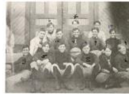
Grand Junction High School Tigers 1904 Football Team (2HA46.1)