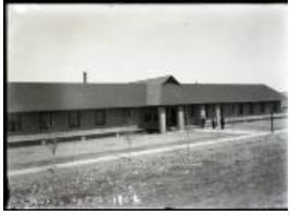
Uintah Hotel, Mack CO (2023.40.50)