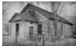
Cardiff School (2004.44.92)