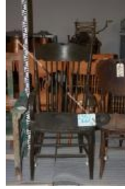
IOOF Chair (1983.162.4)