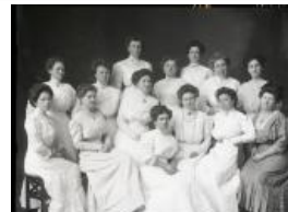
Group of ladies portrait (2023.40.6)