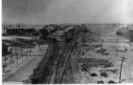
Grand Junction railroad yard (2004.44.963)