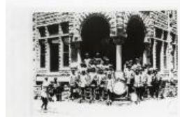
Teller Institute Band in Doorway of Grand Valley National Bank (F473.1)