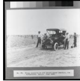
Young orchard and Buick (1980.115.28)