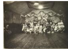
Party in Bower Hall (1979.23.193)