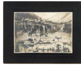
Bird Camp View of Stamp Mill Before Avalanche (1979.87.2)