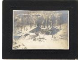
Aftermath of Camp Bird Stamp Mill after Avalanche (1979.87.4)