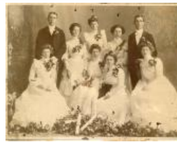
Grand Junction High School Graduates, 1901 (F205.1)