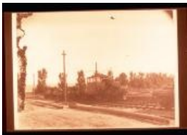
Negative of interurban electric railway line (1990.10.52)