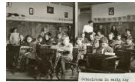
Photograph of Children in a Classroom (1979.23.47)