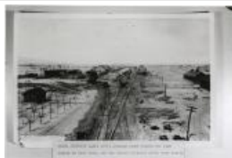
Railyard Looking South (F219.1)