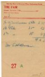
Fair Store Receipt (1999.8.127)