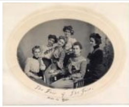
The Fair of the Fair (1999.8.105)