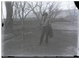
Woman dressed androgynously (2023.40.43)