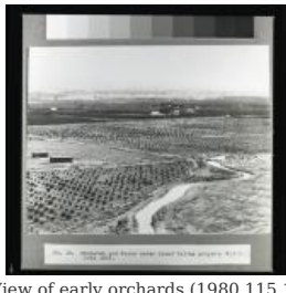
View of early orchards (1980.115.19)