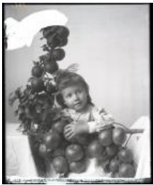
Photo of a girl and her apples (2023.40.10)