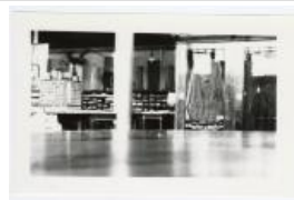
Fair Store Merchandise (1999.8.114)