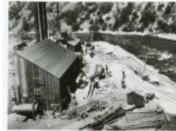
Gunnison Tunnel in Black Canyon (2004.44.81)