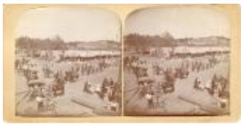
Grand Junction Labor Day Parade, 1902 Stereogram (F196.1)