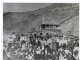
Carpenter excursion (F515.3)