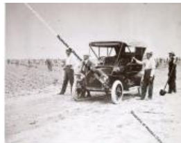
Men with Early Buick Near Young Orchards (F840.1)