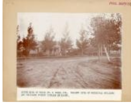
Photo of the Bower Home (1979.23.77)