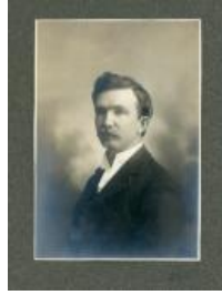
Portrait of an unidentified man (2021.24.49)