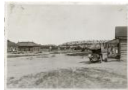
Photo of log structures with automobile (1990.8.21)