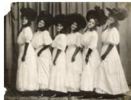
Floradora Girls (F39.1)