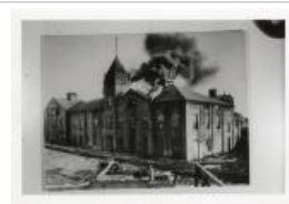
Sugar Beet Factory (F343.2)