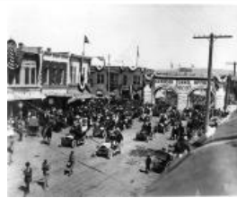
Montrose Colorado Celebration (2004.44.85)