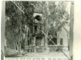
Congregational Church (2004.44.1127)