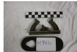
Woodworkers Plane (H761C)