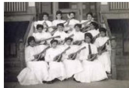
Teller Institute Girls Mandolin Club (F627.1)