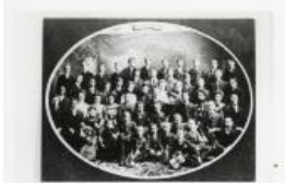
Ross Business College Class Photo (F471.1)