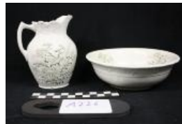
Wash Pitcher (A226.1)