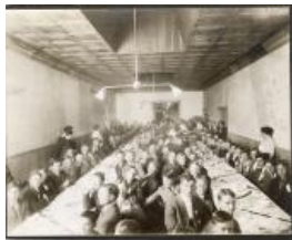
YMCA Youth Dinner (2HA289.3)