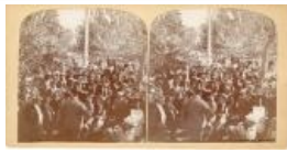
1902 Labor Day Stereogram (F197.1)