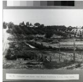
Farming country (1980.115.8)