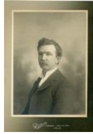
Portrait of an unidentified man (2021.24.50)