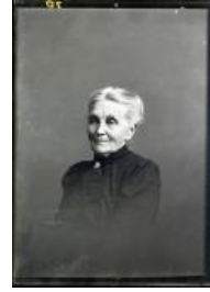
Portrait of an older woman (2023.40.30)