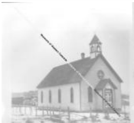
Methodist Church, Mesa CO (1980.120.1)