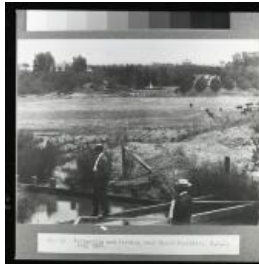
Irrigation and farmland (1980.115.15)