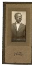
Portrait of an unidentified man (2023.48.21)