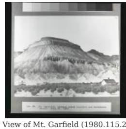
View of Mt. Garfield (1980.115.20)