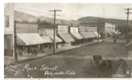
Photograph of Main Street Palisade ca. 1909 (1979.23.36)