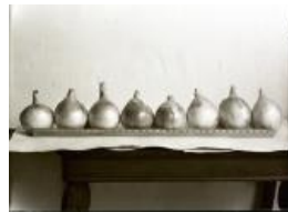
Onions from the Mile High Seed Co. (2023.40.26)