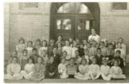
Room 5 of the Lowell School (F207.2)