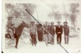
Navajo Indians (F195.1)