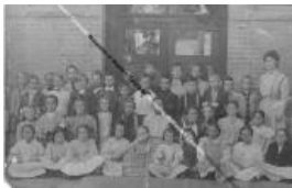
Lowell School (2006.145.1)