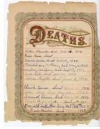
Deaths and Memoranda page from the Butler Family Bible (203.48.27)