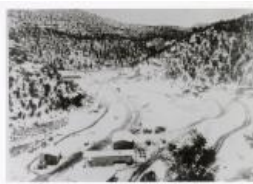
Dragon mine near Dragon, Utah. (1987.39.13)