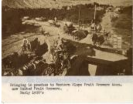
Photo of Bringing in Peaches to Western Slope Fruit Growers Association (1979.23.2)