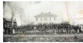
Teller Institute: Students and Faculty Photo (1979.66.10)