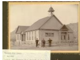
Palisade High School (1979.23.101)