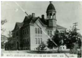
Grand Junction High School (2004.44.1115)