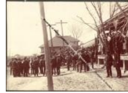
Palisade Depot (1979.23.166)