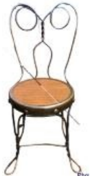
Dean Studio Child's Chair (2022.3.2)