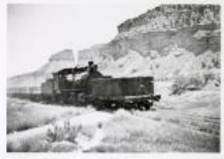
Uintah Railroad (1987.39.1)