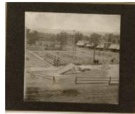
Fair Store Construction (1999.8.37)