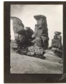
Group in front of large rocks (2021.24.29)