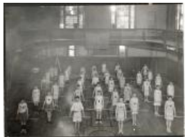
YMCA Exercise Class (2HA289.2)