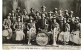
The Ladies Columbine Band, Grand Junction Colo. (F707.1)