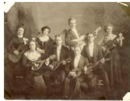
Grand Junction Mandolin Club (F831.1)