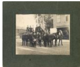
Grand Junction Fire Department Members and Wagon (1990.58.23)