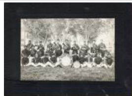
Teller Institute Band (F473.2)