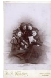
Crawford Family Members (F720.6)