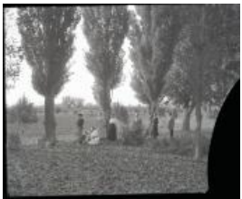
A group of people and their dog (2023.40.7)