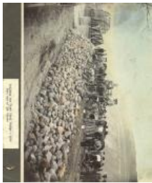
Building the first steel bridge (1979.23.123)