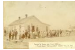
Parton's House and Post Office (1979.23.96)