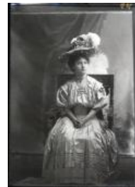
Portrait of a young woman (2023.40.32)