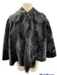
Short Cape (1982.97.21)