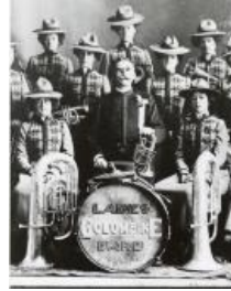
The Ladies Columbine Band, Grand Junction Colo. (F707.2)