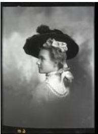
Portrait of a young woman (2023.40.31)