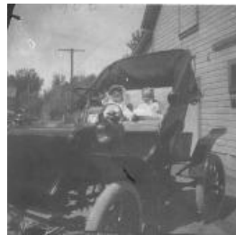
Pierce Arrow (2006.92.1)