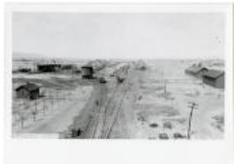
Photo of Grand Junction railroads (1990.8.10)