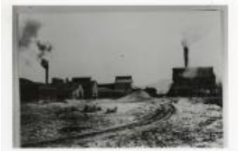
Grand Junction Smelter (F387.1)