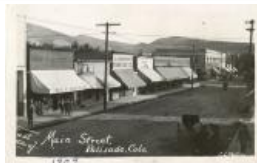
Photograph of Main Street Palisade ca. 1909 (1979.23.44)