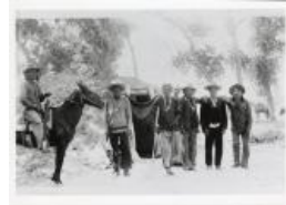
Navajo Indians (Copy) (F195.2)