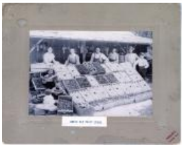
Early day fruit stand (1979.23.82)