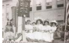
Teller Institute Parade (2HA35.5)