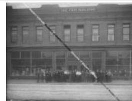
The Fair Building (2004.44.924)