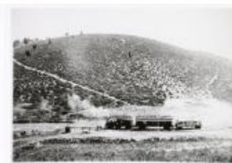
4th of July excursion train. (1987.39.9)