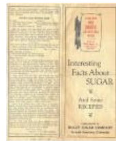
"Interesting Facts about Sugar" (2006.43.4)