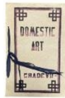
Domestic Art Booklet (2023.42.64)