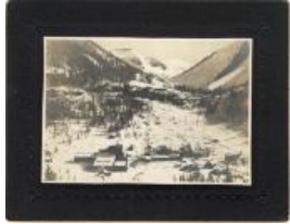
Bird Camp View of Stamp Mill After Avalanche (1979.87.3)