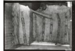
Decorated Hide (C557.2)