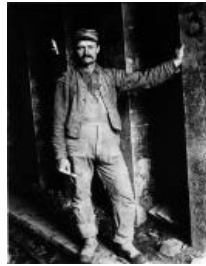
Man in Gunnison Tunnel (2004.44.77)