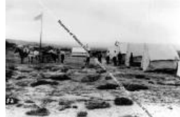
Camp Mack (2004.44.220)