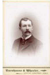
Unidentified Man with Handlebar Mustache (F720.54)