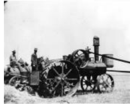
Steam Thrasher (2004.44.968)