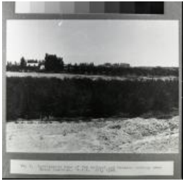
Farming country (1980.115.6)