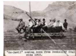
Passengers on the Go Devil (1982.0.20)

Ferrying Apatosaurus out of Colorado River [Duplicate] (1981.115.7331)