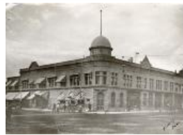
Canon Block, c. 1900 (F922.1)