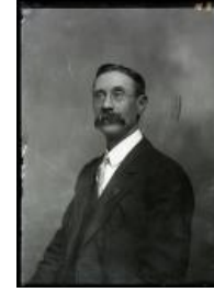
Portrait of an Unidentified Man (2023.40.40)