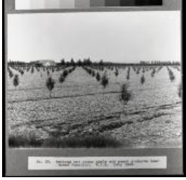
Apple and Peach Orchard (1980.115.25)