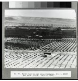
View of the Fruitlands (1980.115.22)