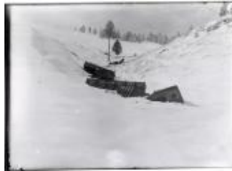
Uintah Train in Snow Wreck (1991.11.8)