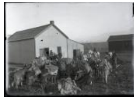
Pack of mules in Mack (2023.40.48)