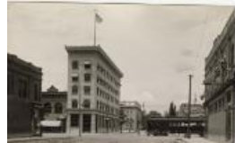
Main Street Postcard (1999.8.41)