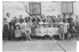
Star School (2009.52.3)