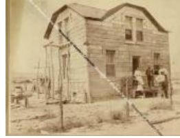
Purdy Hotel (1979.23.161)