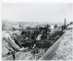
Gunnison Tunnel (2004.44.78)