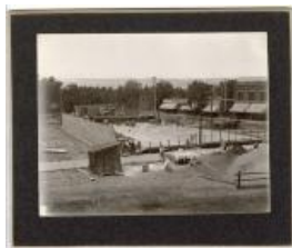
Fair Store Construction (1999.8.36)