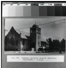
Methodist Church in Palisade (1980.115.47)