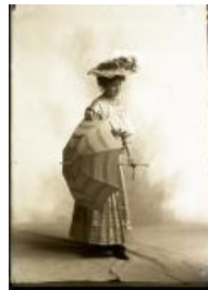
Photo of a young woman (2023.40.25)