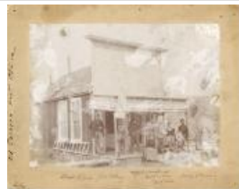
Old Collbran Post Office (F806.1)