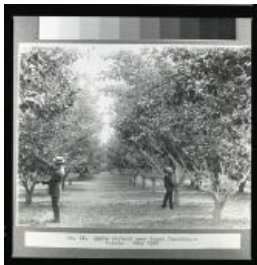
Men in an apple orchard (1980.115.18)