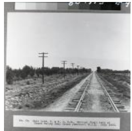
D&RG RR through the fruit belt (1980.115.29)