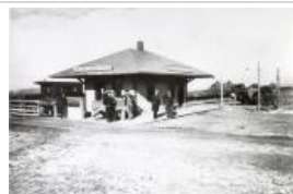
Group Photo Bookcliff Railroad Train Station (F515.6)