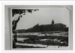
Sugar Beet Factory (F343.1)