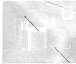
1011 N. Seventh St. Interior (1999.44.20)