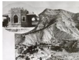
Carpenter Coal Mine (F382.1)