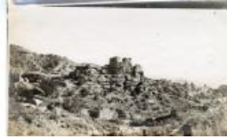
Bryan and Plateau Canyon (F912.20)