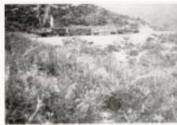
Train traveling between Columbine and McAndrews Lake (1987.39.14)