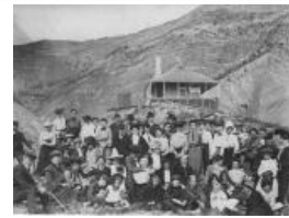
Bookcliff mine (2004.44.856)