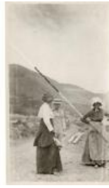
Women and a man outdoors (2007.74.11)