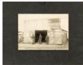
Dad's Blacksmith Shop (E144.5)