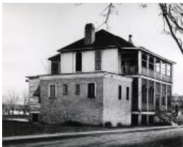
Teller Institute: Old Hospital (1979.66.2)