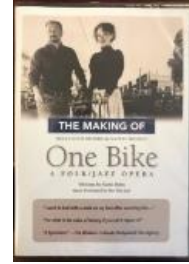
The Making of "One Bike" Opera (2021.22.1)