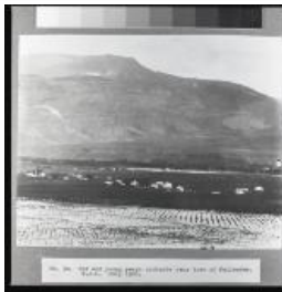
View of the orchards (1980.115.30)