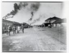
Grand Junction Railroad Station & Yards, 1900-1920 (F720.57)