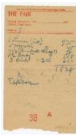
Fair Store Receipt (1999.8.126)