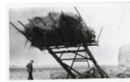
Wheat Stacker (1980.169.1)