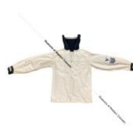
Navy Jacket (2023.42.83)