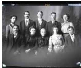
Portrait of a family (2023.40.12)