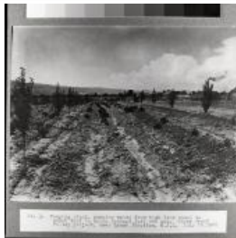
Pumping Plant and young orchard (1980.115.3)