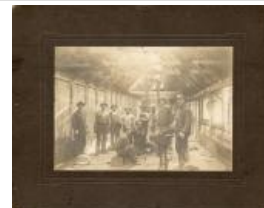
Inside of Carey Salt Plant (E144.7)