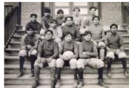
Teller Institute Boys Football Team (F627.2)