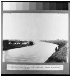
Grand River channel (Colorado River) (1980.115.1)