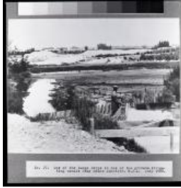
Irrigation canals (1980.115.27)