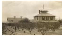
Cross Orchards House, Barn, and Orchards (1980.66.17)