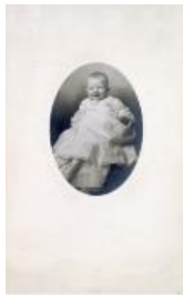
Portrait of a baby (2021.24.37)