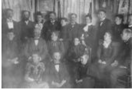
East End Whist Club (2004.44.831)