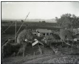
Farm Scene (2023.40.18)