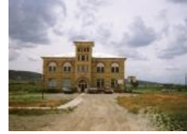
Loma School (2004.44.233)