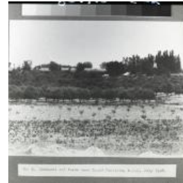
Farming country (1980.115.9)