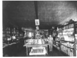
Progress Grocery Interior (2007.57.6)