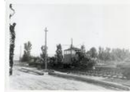
Photo of Fruit Belt Route interurban electric railway line (1990.10.48)