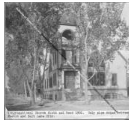
Congregational Church 1900 (2002.0.5)