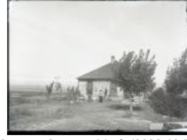
Stewart Cottage, Mack (2023.40.53)