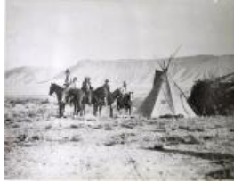
Ute Camping Trip (F347.1)