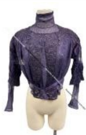
Lady's Blouse (B80)