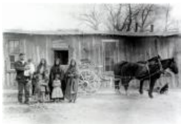
American Indian Family (F621.1)