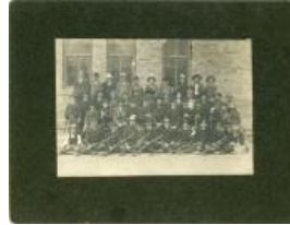
Cadets, Grand Junction High School (F527.1)