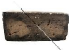
Brick from St. Joe Church (2019.65.1)