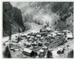
Construction Camp in Black Canyon (2004.44.76)