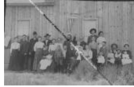
Dove family (1984.80.16)