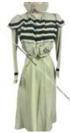
2 piece dress with detachable collar (1982.220.17)