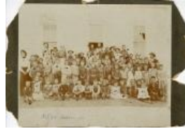
Mesa School, 1900 (F194.1)