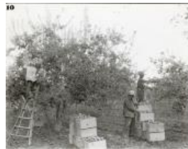
Picking and Packing Apples (F798.2)