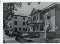
La Court Hotel, c. 1925 (F592.1)