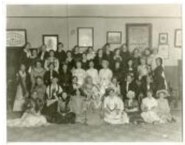
Independent Order of Odd Fellows (IOOF) Women's Group (F544.1)