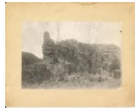
Scene in Unaweep Canyon (2019.16.2)