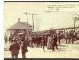
Iowa Potential Peach Land Buyers (1979.23.105)