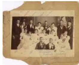
Washington Friends Academy (1982.202.9)