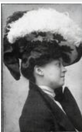
Negative of unidentified woman (F266.5)