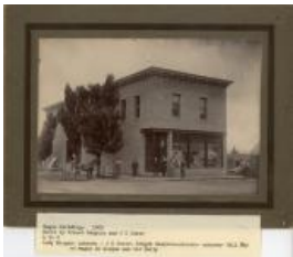
Photo of the Hugus Building in 1903 (1979.23.97)