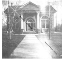
Carnegie Library (1999.44.3)