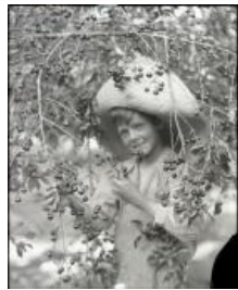
Boy with cherries at Knight's Orchard (2023.40.11)