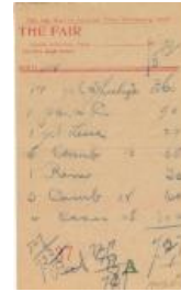
Fair Store Receipt (1999.8.124)