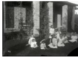
Group of young girls outside of URY office (2023.40.45)