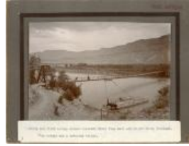
Photograph of a Ferry and the First Bridge Across the Colorado River in Palisade (1979.23.72)