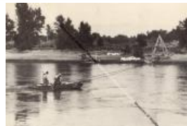
Ferrying Apatosaurus out of Colorado River (1981.115.733)