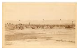
Early day Grand Junction (2004.44.5)