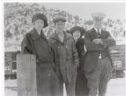
Two couples gathered at Atchee, Colorado. (1987.39.23)