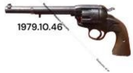
Buffalo Bill's Colt Pistol (1979.10.46)