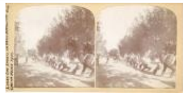
Grand Junction Labor Day Sports, 1902 Stereogram (F196.2)