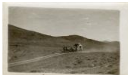
Stagecoach from Rifle to Meeker, 1908 (F912.17)