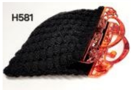
Black Crochet Purse (H581)