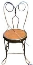
Dean Studio Child's Chair (2022.3.2)