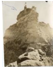
Rocky Spire with Woman Standing on Top (2023.42.39)