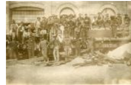
Colorado Sugar Mill Employees (2006.43.5)