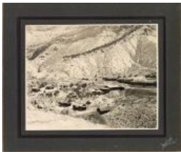
The town of Carpenter (2022.4.4)