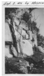
Calamity #11 (2007.151.3)