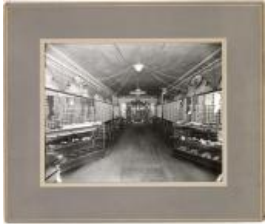
Benge's Shoe Store Interior (2021.24.7)