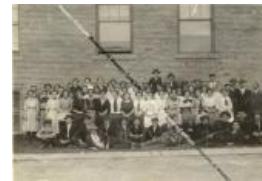
Palisade High School (1979.23.199)