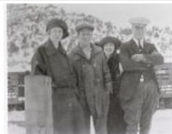
Two couples gathered at Atchee, Colorado. (1987.39.23)