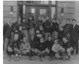
GJHS football team (2004.44.820)