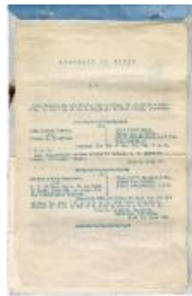
Abstract of Title (2001.49.1)