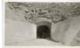
United States Reclamation Service Tunnel Opening, 1914 (F912.15)