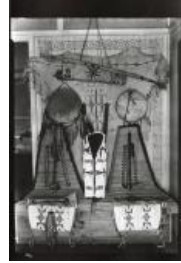
Native American Handmade Artifacts (C557.4)