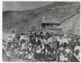
Carpenter excursion (F515.3)