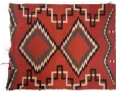
Navajo Rug (B614.1)