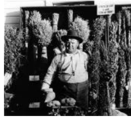
Corn Crop (2004.44.994)