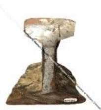
Trolley Tie (2019.65.2)