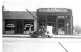
Progress Grocery (2007.57.3)