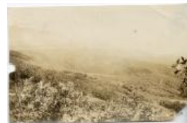
Mountain Valley with Building and Road (2023.42.40)