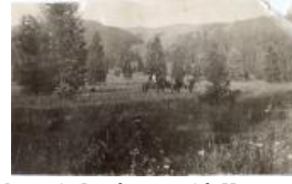
Mountain Landscape with Horses and Riders (2023.42.36)