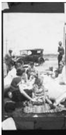
Family having picnic (2001.27.26)