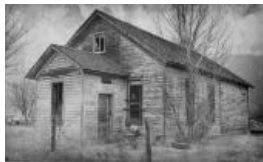
Cardiff School (2004.44.92)