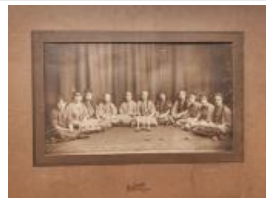
Photograph of Grand Junction Campfire Girls (2023.25.1)