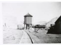
Engine #11 and water cars at Atchee. (1987.39.12)