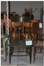
IOOF Chair (1983.162.4)