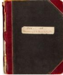
Proceedings of the Board of Health (1983.92.1)