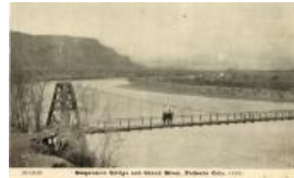
Photo of a Suspension Bridge and Grand River (1979.23.39)