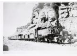
Mallet #51 north of Cooley (1987.39.11)