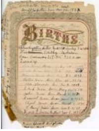
Births and Marriages page from the Butler Family Bible (2023.48.26)