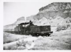
Uintah Railroad (1987.39.1)