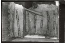
Decorated Hide (C557.2)