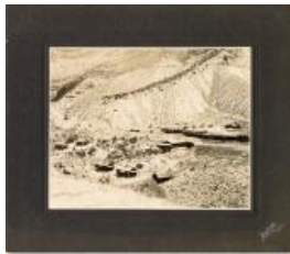
Carpenter, CO (2022.4.1)