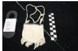
White Purse (X122)