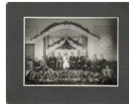
Eighth Grade Class of 1914, Mesa CO (1979.114.10)