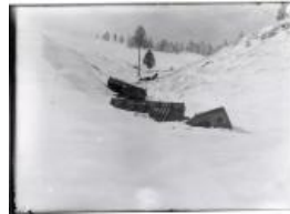
Uintah Train in Snow Wreck (1991.11.8)