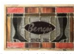
Benge's Stained Glass (2021.24.2)