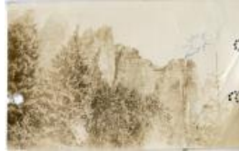
Mountain Landscape (2023.42.35)