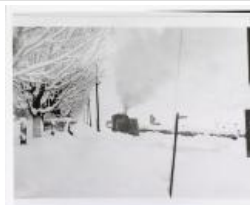
Uintah Train in the snow (1987.39.36)