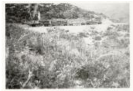
Train traveling between Columbine and McAndrews Lake (1987.39.14)