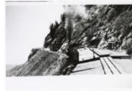
Uintah locomotive climbing 7.5% grade on Baxter Pass. (1987.39.5)