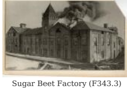
Sugar Beet Factory (F343.3)