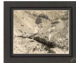
Little Book Cliff Railroad in Carpenter (2022.4.3)