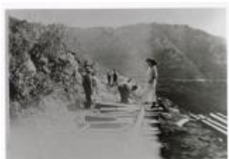
Rebuilding the Tracks (1987.39.24)