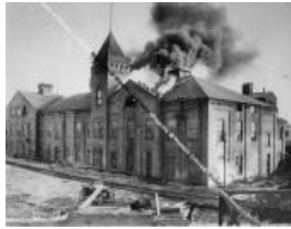
Sugar beet factory (2004.44.771)