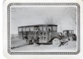
School Bus To Fruita Union High School (F879.8)