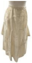
Ladies Skirt (A939.2)