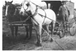
Progress Grocery (2007.57.1)