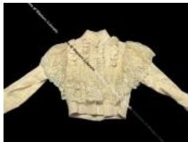
Lady's Blouse (B191)