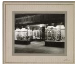
Exterior of Benge's Shoestore (2021.24.6)