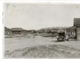
Photo of log structures with automobile (1990.8.21)