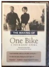
The Making of "One Bike" Opera (2021.22.1)