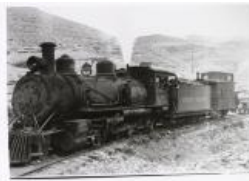
Engine #30 derailed at Rainbow Junction, Utah (1987.39.18)