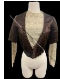
Lady's Blouse (B104)