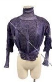
Lady's Blouse (B80)