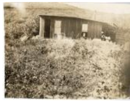
Meadow Landscape with Building (2023.42.38)