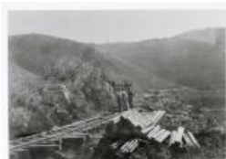
Rebuilding the tracks (1987.39.26)