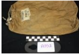
Duffel Bag (A352)