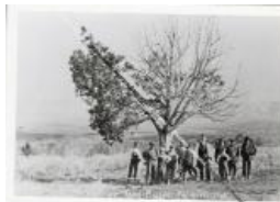
Ute Prisoner Surrender Tree (F230.2)