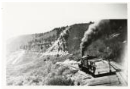
Train ascending Baxter Pass. (1987.39.10)