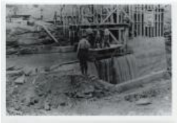
Highline Canal Construction (F242.1)