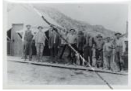
The Office Gang (F245.2)