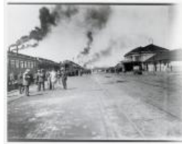
Grand Junction Railroad Station & Yards, 1900-1920 (F720.57)