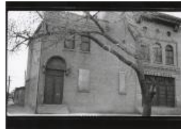
Park Opera House (1992.95.2)