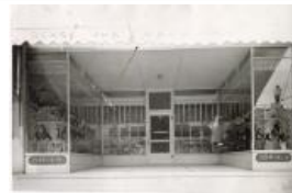
Exterior of the Benge's Shoe store (2021.24.11)