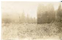
Mountain Meadow with Three Saddled Horses and Riders (2023.42.41)