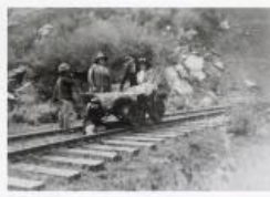
Riding on a hand car (1987.39.46)