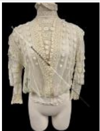
Lady's Blouse (B95L)