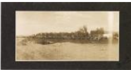
Train and boxcars at a town. (2022.4.10)