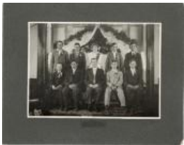
Eighth Grade Class of 1914, Mesa CO (1979.114.9)