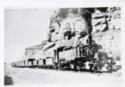
Uintah railroad locomotive (1987.39.2)