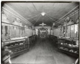
Benge Shoe Store (2HA289.4)