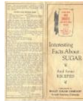
"Interesting Facts about Sugar" (2006.43.4)