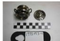
Gravy Boat Lid (1993.49.4)