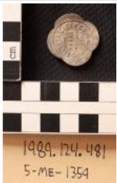
Metal Token. The Tibbs Cigar Co. Grand Junction Colo. (1989.124.481)