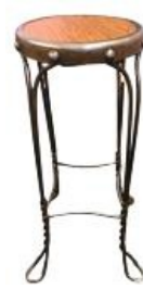
Dean Studio Table (2022.3.1)