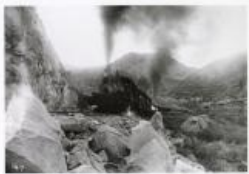
Train descending into Baxter Pass. (1987.39.8)