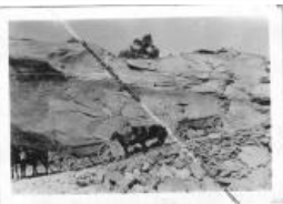
Serpent's Trail (2009.52.7)