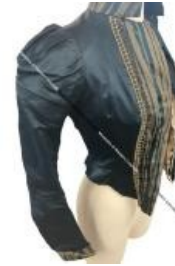
Lady's Bodice (B65)