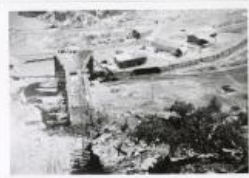
Dragon Mine near Dragon, Utah (1987.39.4)