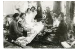
Picnic scene (1982.213.2)