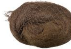
Switch of Hair (2023.42.94)