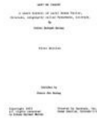
Lest We Forget: A Short History of Early Grand Valley, Colorado, Originally Called Parachute, Colorado

Independent Lumber Company Records (1982.101)