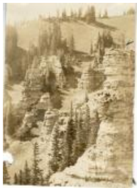
Mountain Landscape (2023.42.37)