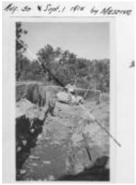
Calamity #13a (2007.151.5)