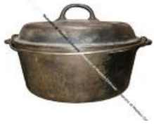
Cast Iron cooking pot (1980.107.2)