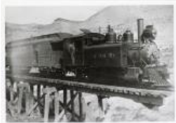
The Uintah Train (1987.39.19)