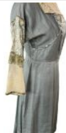
Petrol green dress (C363)