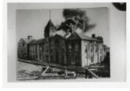
Sugar Beet Factory (F343.2)