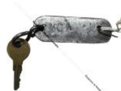
YMCA Keychain and Key (2018.17.1)