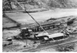
De Beque dam (2004.44.975)