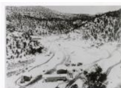
Dragon mine near Dragon, Utah. (1987.39.13)