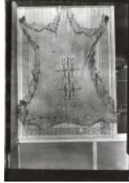
Decorated Hide (C557.3)