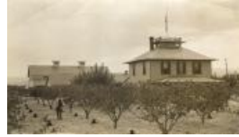
Cross Orchards House, Barn, and Orchards (1980.66.17)