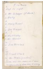
Photograph of Palisade Fire Department (1979.23.18)