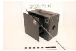
Cub Camera (2020.91.4)