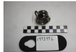
Sugar Bowl (1993.49.6)