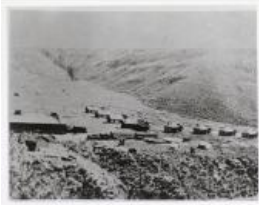
Scene of a town and train (1987.39.38)