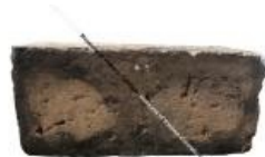
Brick from St. Joe Church (2019.65.1)