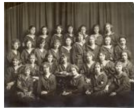
Portrait of a girl's group (2021.24.18)