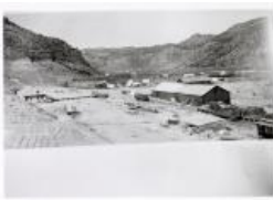
Dragon, Utah (1987.39.17)