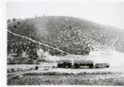
4th of July excursion train. (1987.39.9)