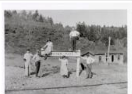
Travelers at Baxter Pass (1987.39.29)