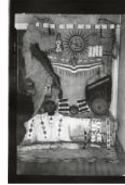
Native American Handmade Artifacts (C557.5)