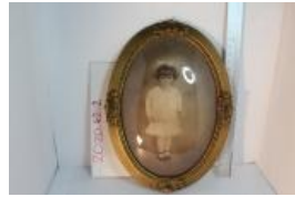
Portrait of a Child (2020.62.2)