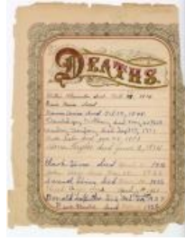
Deaths and Memoranda page from the Butler Family Bible (2023.48.27)