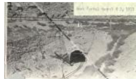
West Portal tunnel #3, 1913-1914 (1979.23.145)