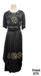
Front E75 Dress (E75)