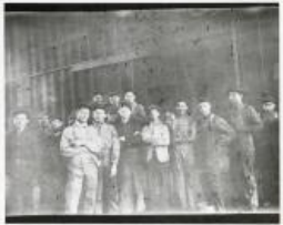
Photo of 16 unidentified individuals (1990.8.23)