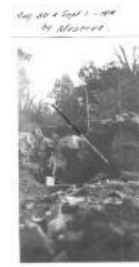
Calamity #12 (2007.151.4)