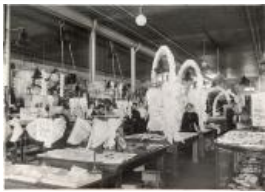
Photo and negative, Interior of the Fair Store (1999.8.34)