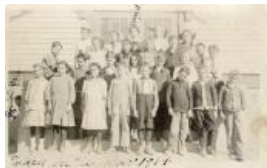
Clifton School Class Portrait, 1914 (1979.46.7)