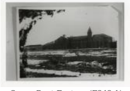
Sugar Beet Factory (F343.1)