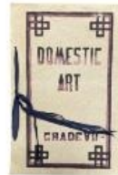
Domestic Art Booklet (2023.42.64)