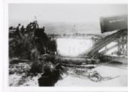
Wreck of engine #10 at bridge 2A. (1987.39.7)