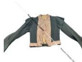
Lady's Blouse (B44)