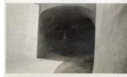
Tunnel Opening with Man Inside (F912.14)