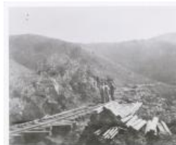
Bridge and building crew of three individuals on Pass. (1987.39.27)