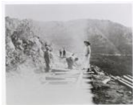
Bridge and building crew. (1987.39.25)