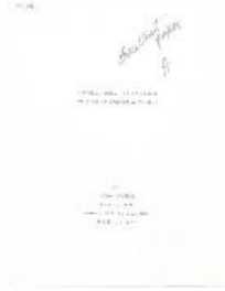
A Canyon, Coal, and A Railroad: The Story of Carpenter, Colorado (1985.114.1)