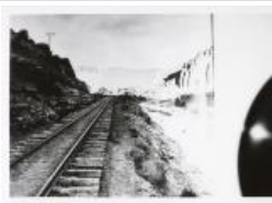
Uintah crossing bridge into Watson, Utah (1987.39.3)