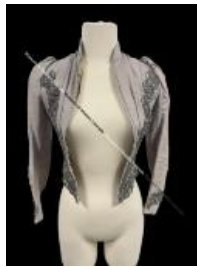
Lady's Blouse (B40)