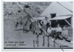
Highline Canal Workers and Office Staff (F245.1)