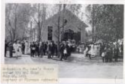
Photograph of the Dedication of St. Anne's Catholic Church (1979.23.20)