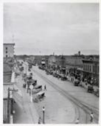
Photograph of Downtown Grand Junction (F827.2)