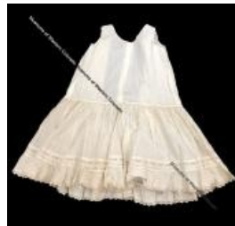
Baby Dress (2014.95.19)