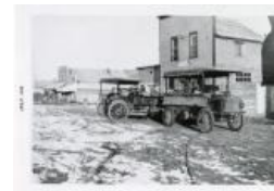
The first mail trucks (2021.24.69)