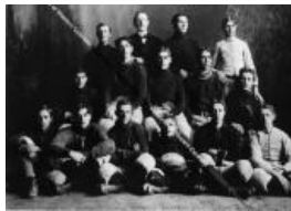
GJHS football team (2004.44.834)