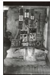
Native American Handmade Artifacts (C557.1)