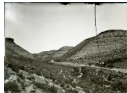
"Lonetree Motor" (2023.40.24)