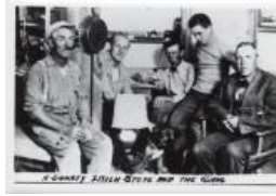
A Shanty Irish Stove and the Gang (F245.3)