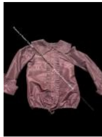
Child's Blouse (B369)