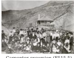
Carpenter excursion (F515.5)