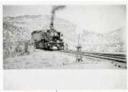
Mallet #51 crossing bridge into Atchee. (1987.39.15)