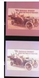
We Should Worry About The Price Of Gasoline (1980.155.7)