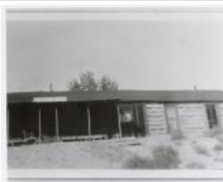
Watson Hotel at Watson, Utah (1987.39.28)