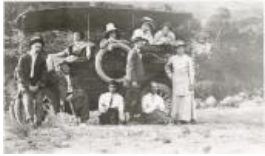
Travelers next to their vehicle (1983.77.52)