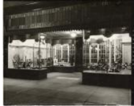
Exterior of Benge's Shoestore (2021.24.8)