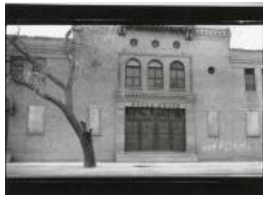
Park Opera House (1992.95.1)