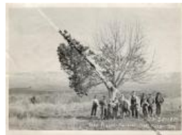
Ute Prisoner Surrender Tree (F230.1)