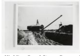
Highline Canal Steam Powered Dragline (F462.1)