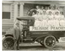
Photo of Palisade Peach Float (1979.23.79)