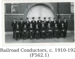
Railroad Conductors, c. 1910-1920 (F562.1)