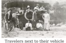
Travelers next to their vehicle (1983.77.52)