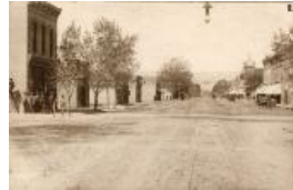
Main Street, 1890 (F483.3)