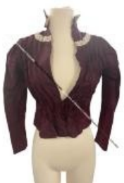
Maroon Blouse (A923)