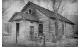
Cardiff School (2004.44.92)