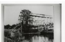
Wellington Water Wheel (F368.2)