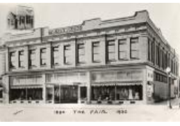
Fair Building (F392.1)