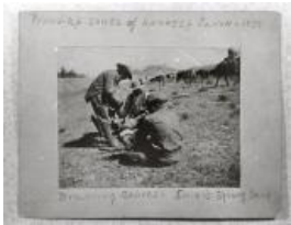
Branding Calves South of Unaweep Canyon (1980.93.2)