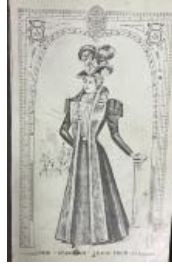
Standard Garment Cutter Instruction Book and Diploma (2006.79.1)