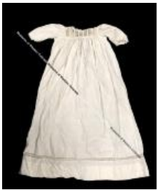
Christening Gown (2014.95.16)