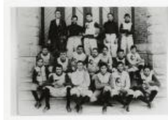
Grand Junction's First Football Team (F475.1)