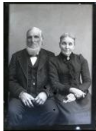
Portrait of older couple (2023.40.42)