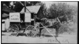
West Side Dairy (2004.44.938)