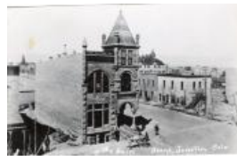
First National Bank (F381.1)