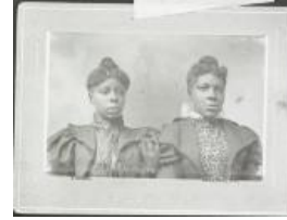
Portrait of Unidentified Women (2001.27.8)