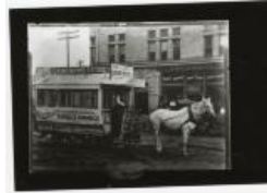
Horse Drawn Street Car (F225.2)