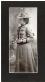
Unidentified Woman in Columbine Band Uniform (F720.39)