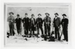
Grand Junction Rifle Club (F472.1)