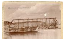
Gunnison River Bridge (2HA63.4)