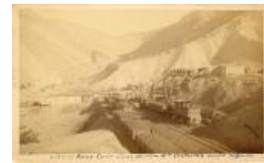
Little Book Cliff Coal Mine and Workers (F187.2)