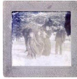
Hughes Family Outing (2019.8.1)