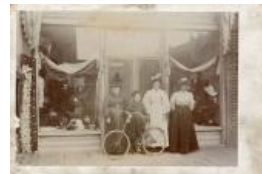
Ladies Millinery Storefront (2HA288.1)