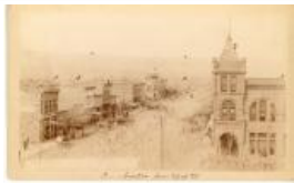
Main Street looking west from corner Fifth and Main street (2004.44.3)