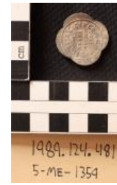
Metal Token. The Tibbs Cigar Co. Grand Junction Colo. (1989.124.481)