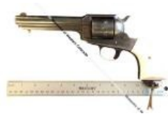
Remington Revolver Model 1890 (1988.93.1)