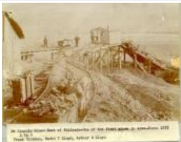
Mt. Lincoln Mine (1979.23.103)