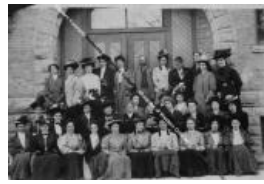
Early day teachers (2004.44.847)