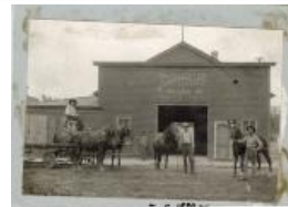
H.G. Bedwell Co. Livery Board and Transfer Stables (F797.1)