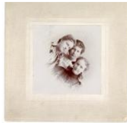
3 Women (1999.8.104)