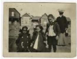
Photo of 3 children and a woman (2023.48.18)