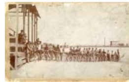
Bicycle Club at the Stockyards (F375.1)