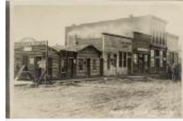
Fair Store 1890 (1999.8.50)