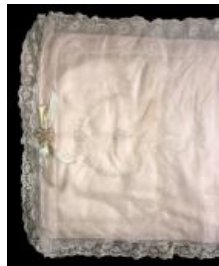
Baby Blanket (2014.95.32)