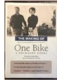
The Making of "One Bike" Opera (2021.22.1)