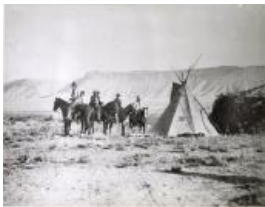
Ute Camping Trip (F347.1)