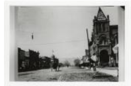
5th and Main (F483.1)