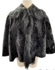
Short Cape (1982.97.21)