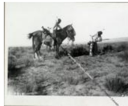
Ute Trailing (1980.13.83)