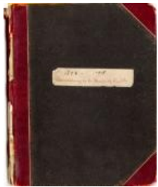
Proceedings of the Board of Health (1983.92.1)