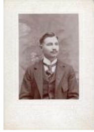
Unidentified Man with Mustache (F720.53)