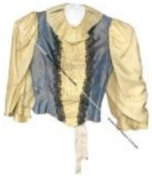
Two-Piece blue and yellow dress (1994.9.3)