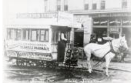
Horse Drawn Street Car (F225.1)