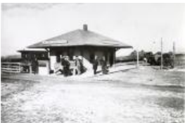
Group Photo Bookcliff Railroad Train Station (F515.6)