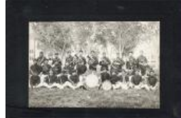
Teller Institute Band (F473.2)