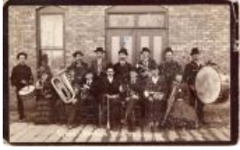
Great Western Band (F190.1)