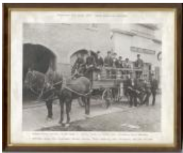
Volunteer Fire Department (2021.24.84)