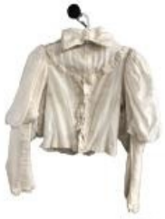
Blouse with Bow (B91)