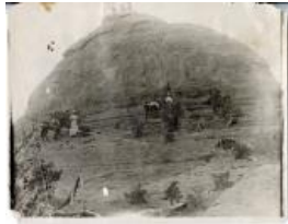
Liberty Cap (2020.16.1)