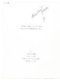
A Canyon, Coal, and A Railroad: The Story of Carpenter, Colorado (1985.114.1)

Marriage Records Mesa County, Colorado (1984.9.1)