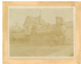
Colorado Midland Locomotive at Leadville Depot (F720.61)