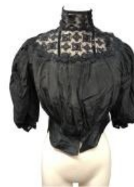
Black beaded and sequined bodice (2014.95.7)