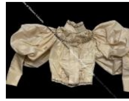
Two Piece Dress (D34.2)