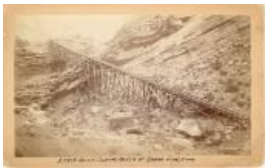
Little Bookcliff Trainway (F187.3)