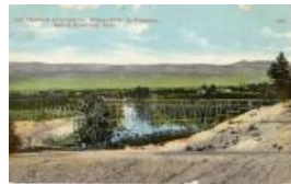
Wellington Water Wheel (F368.1)