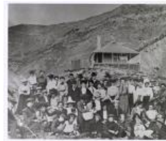
Carpenter excursion (F515.3)