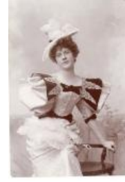
Portrait of a lady (2021.24.62)