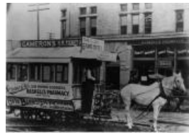
Grand Junction Trolley Car (2004.44.997)