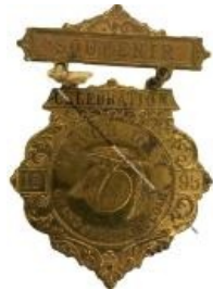
1895 Peach Day Medal (H629.3)