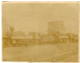
Denver and Rio-Grande Railroad Locomotives and Watertanks (F720.60)