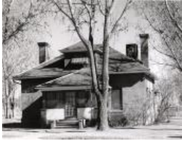
Teller Institute: East House (1979.66.6)