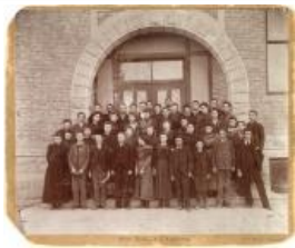
Grand Junction High School 1894 (1988.40.1)