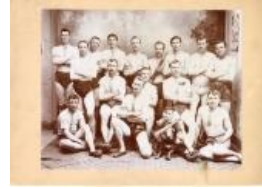
Picture of Grand Junction Hose Cart Team (1983.8.10)