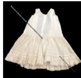
Baby Dress (2014.95.19)