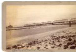
Grand River Bridge (F341.1)