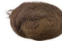
Switch of Hair (2023.42.94)