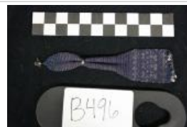
Reticule (coin purse) (B496.4)