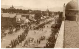
Hose Cart Races (F342.1)