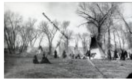
Ute Camp Near Ignacio (1980.13.81)