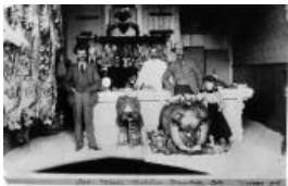
Montrose Meat Market (2004.44.957)