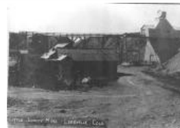
Little Johnny Mine (2004.44.954)