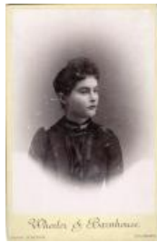
Unidentified Young Woman (F720.46)