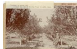
Photo of Orchard Scene in Palisade (1979.23.80)