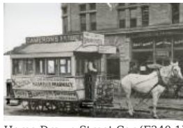
Horse Drawn Street Car (F340.1)