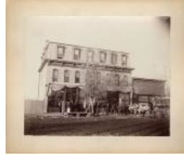
Brunswick Hotel (F720.56)