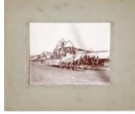
Black and White photo of early parade (1987.75.4)