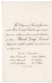
1897 "Peach Day" Invitation (1984.33.1)