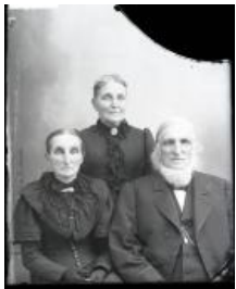
Portrait of 2 women and a man (2023.40.41)