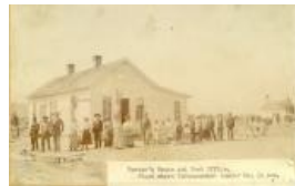
Parton's House and Post Office (1979.23.96)