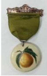
Peach Day Pin (1990.14.1)