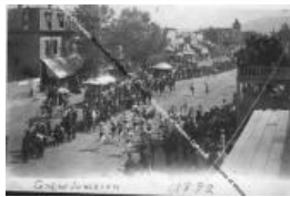
Hose Cart Team (2004.44.942)