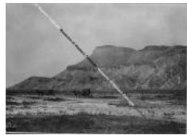
Mt. Garfield (2004.44.941)