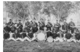
Teller Indian School Band (2006.0076)