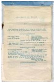
Abstract of Title (2001.49.1)