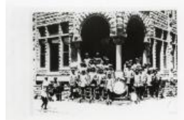
Teller Institute Band in Doorway of Grand Valley National Bank (F473.1)