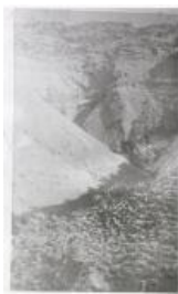
Book Cliff Coal Mine (copy) (F187.5)