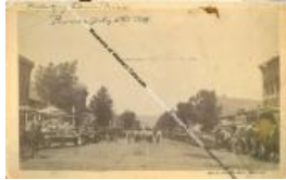
Waiting to Join Parade (F198.6)