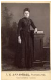
Unidentified Young Woman (F720.45)