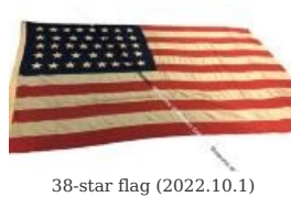
38-star flag (2022.10.1)