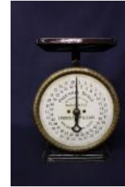
Columbia Spring Scale (1993.35.1)