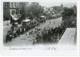
Photo of Grand Junction Fire Department horse cart races (1990.10.49)