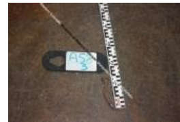
Railroad Spike (Hagerman Tunnel) (A583)