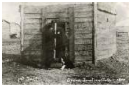
First Jail in Grand Junction, c. 1890 (F799.1)