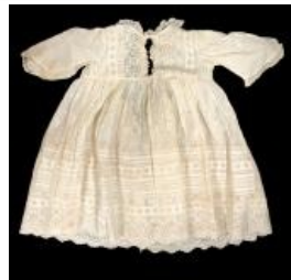
Child's Dress (2014.95.18)