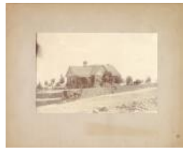
Photo of a house (2021.24.25)