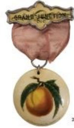
Commemorative Peach Day Pin 1895 (1990.14.2)