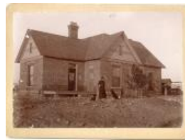
Lady, pets, and brick house (2021.24.27)