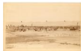
Early day Grand Junction (2004.44.5)