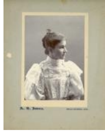
Portrait of a young lady (2021.24.52)