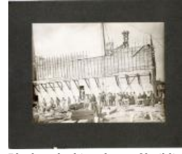
Black and white photo of building construction (1987.75.5)