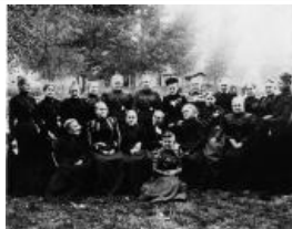
Birthday Party (2004.44.836)