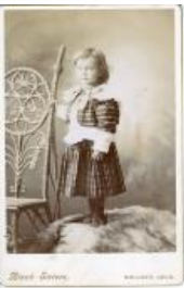
Unidentified Female Child (E96.2)