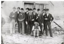
Denver and Rio Grand Baseball Team (F316.1)