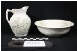
Wash Pitcher (A226.1)