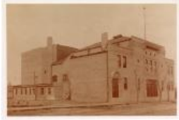
Park Opera House (1983.7)