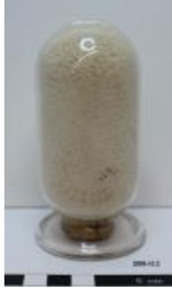
First Sugar manufactured in Colorado (2006.43.2)