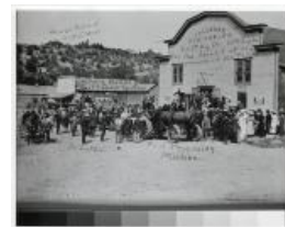
Collbran Main Street (F810.2)