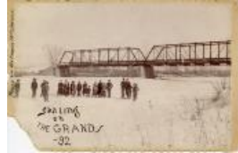
Ice Skating on the Grand River (F834.1)