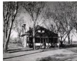
Teller Institute: West House (1979.66.5)