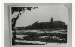
Sugar Beet Factory (F343.1)