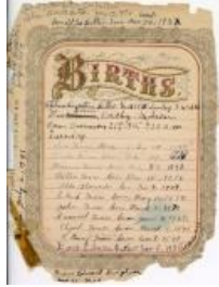
Births and Marriages page from the Butler Family Bible (2023.48.26)