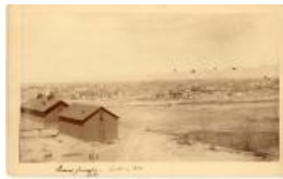
Grand Junction looking Northwest (2004.44.4)