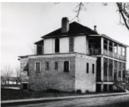
Teller Institute: Old Hospital (1979.66.2)