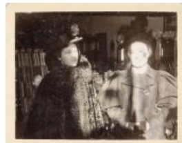
Two Unidentified Women (F720.42)