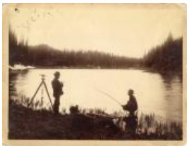
Surveying the Grand Mesa (F96.1)