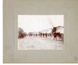
Black and white photo of early parade (1987.75.3)