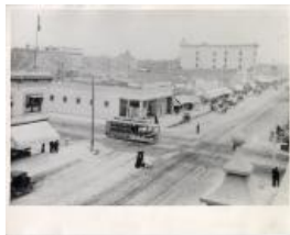
Main Street (2021.24.23)