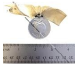
1984 Peach Day Ribbon (1981.55.20)