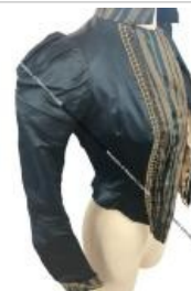
Lady's Bodice (B65)