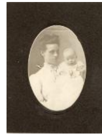
Unidentified Young Mother and Child (F720.44)