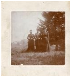
Three Unidentified Women (F255.1)