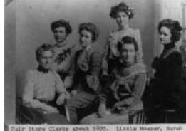
The Fair Store clerks (2004.44.926)