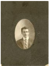
Unidentified Man (F257.1)