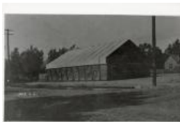
Peach Day Exhibit Tent (2HA63.7)