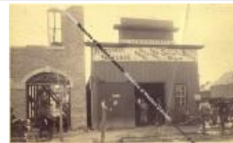
Mitchell Wagons (1979.23.153)