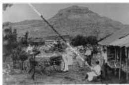
Crawford Orchard & Vineyard (2004.44.998)