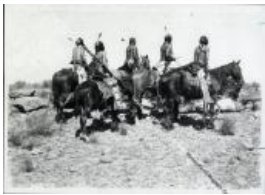
Ute War Party (1980.13.80)