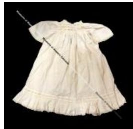
Baby gown (2014.95.17)