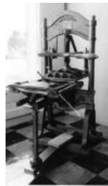
The Daily Sentinel Printing Press (2004.44.648)