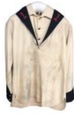
Fireman's Shirt (1891) (C667.1)