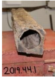
Pipe, Irrigation (2019.44.1)