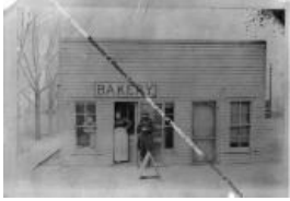
Picture of the Sitter Bakery (2004.44.892)