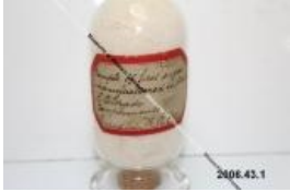
First Sugar manufactured in Colorado (2006.43.1)