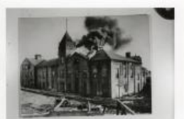
Sugar Beet Factory (F343.2)