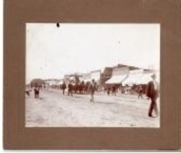
Black and white photo of early parade (1987.75.2)