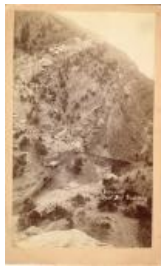
Little Bookcliff Tramway (F187.4)