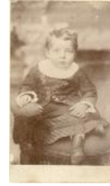
Unidentified Female Child (E96.1)