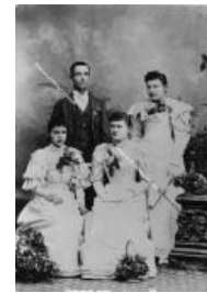
GJHS graduation (2004.44.840)