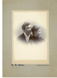
Portrait of a couple (2021.24.53)