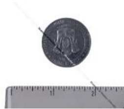
Commemorative Coin (2023.30.20)