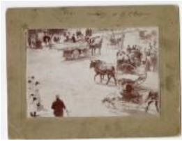
Horse-drawn Hose Cart in Downtown Grand Junction (1990.58.8)