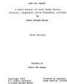
Lest We Forget: A Short History of Early Grand Valley, Colorado, Originally Called Parachute, Colorado