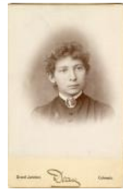
Unidentified Young Woman (F720.43)