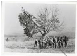
Ute Prisoner Surrender Tree (F230.2)