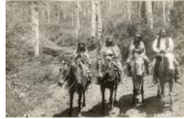
Postcard of Captain Jinks and Three Women on Horseback (F836.5)