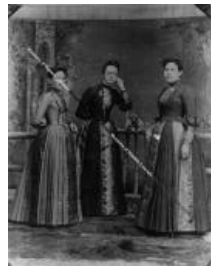
Three Women (2004.44.1136)