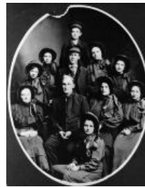
Salvation Army (2004.44.838)