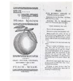
Rules and Regulations Governing the Hose Races (F664.1)