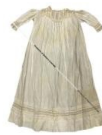
Baby Dress (D566)