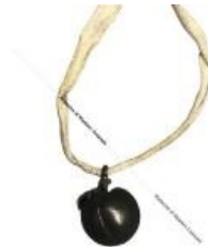
Charm, Peach (A417)