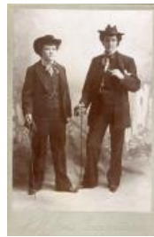
Unidentified Women in Men's Clothing (F720.47)