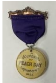
Peach Day Pin (D565)