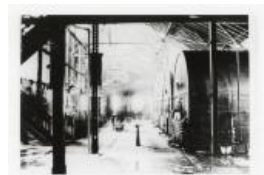
Interior of Sugar Beet Factory (F522.2)