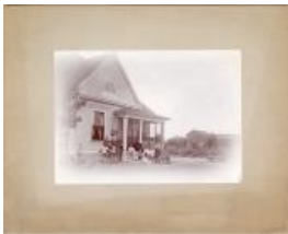
Family out on porch (2021.24.13)