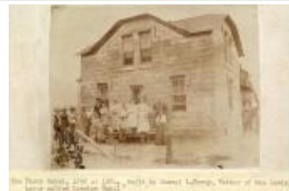
The Purdy Hotel (1979.23.104)