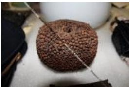
Preserved Peach in Cloves (D406)