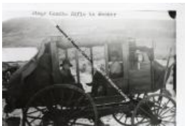
Stage Coach Rifle to Meeker (F379)