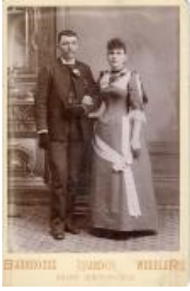
Unidentified Couple in Wedding Photo (F720.50)