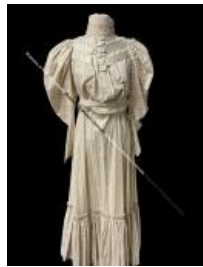
Two-piece dress (D52)