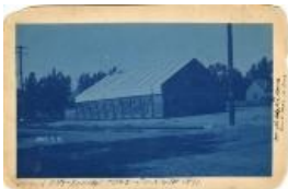
Peach Day Exhibit Tent (2HA63.1)