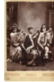
Operetta at Opera House or Armory (F95.1)