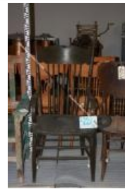
IOOF Chair (1983.162.4)