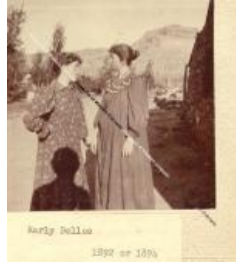
Early Belles (1979.23.167)