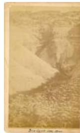
Bookcliff Coal Mine (F187.1)