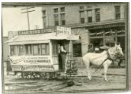
Horse Car Transport (F225.3)