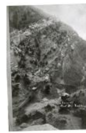
Little Bookcliff Tramway (F187.6)