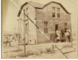
Purdy Hotel (1979.23.161)