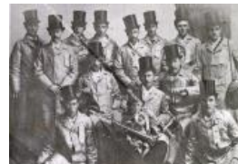
Grand Junction Hose Team c. 1895 (F465.1)