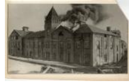
Sugar Beet Factory (F343.3)