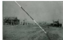
Main Street (2004.44.789)