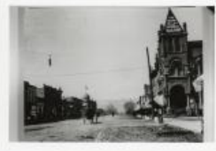
5th and Main (F483.1)