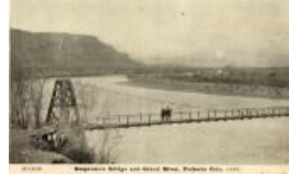
Photo of a Suspension Bridge and Grand River (1979.23.39)