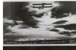
First "Flying Machine" over Grand Junction (F531.1)