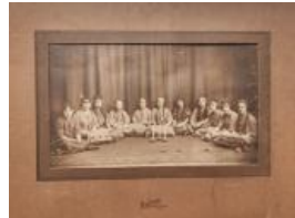
Photograph of Grand Junction Campfire Girls (2023.25.1)