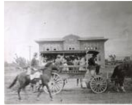
Appleton School Wagon (F385.3)