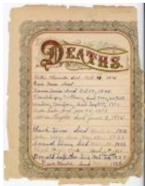
Deaths and Memoranda page from the Butler Family Bible (2023.48.27)