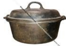
Cast Iron cooking pot (1980.107.2)