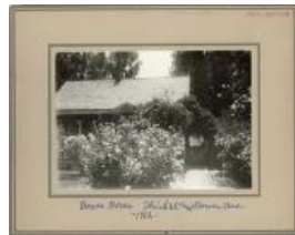
Photo of the Bower Home (1979.23.67)