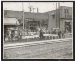
Postal Workers, Grand Junction (F199.1)