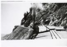
Uintah locomotive climbing 7.5% grade on Baxter Pass. (1987.39.5)