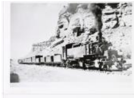
Mallet #51 north of Cooley (1987.39.11)