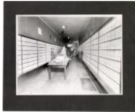
Benge the Shoeman Store (2021.24.10)