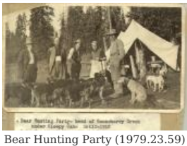
Bear Hunting Party (1979.23.59)