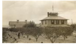
Cross Orchards House, Barn, and Orchards (1980.66.17)