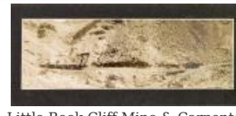
Little Book Cliff Mine & Carpenter (2022.4.8)