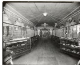
Benge Shoe Store (2HA289.4)