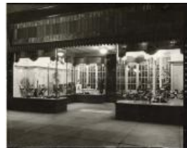
Exterior of Benge's Shoestore (2021.24.8)