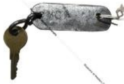
YMCA Keychain and Key (2018.17.1)