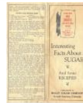
"Interesting Facts about Sugar" (2006.43.4)