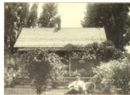
C. Bower Home (1979.23.190)