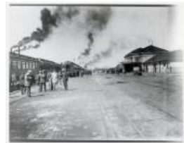
Grand Junction Railroad Station & Yards, 1900-1920 (F720.57)