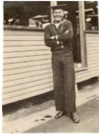
Photo of Sailor (2023.42.43)