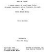
Lest We Forget: A Short History of Early Grand Valley, Colorado, Originally Called Parachute, Colorado

Independent Lumber Company Records (1982.101)