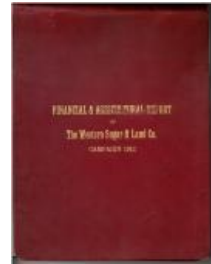
Financial and Agricultural Report of Western Sugar and Land Co., 1912 (F600.1)