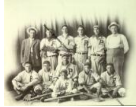
Palisade baseball team (1979.23.217)