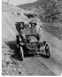
Early day car (2004.44.966)