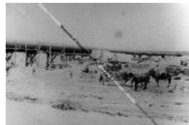
Siphon Highline Canal (2004.44.224)