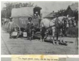
Ice Wagon (1979.23.86)