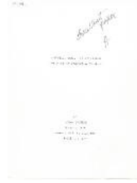
A Canyon, Coal, and A Railroad: The Story of Carpenter, Colorado (1985.114.1)