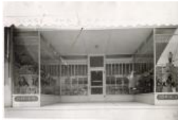
Exterior of the Benge's Shoe store (2021.24.11)