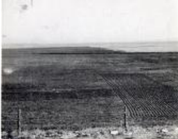
Photo of wheat crop in Utah (1988.40.38)