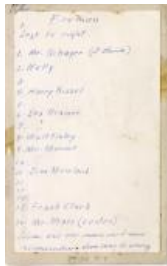
Photograph of Palisade Fire Department (1979.23.18)