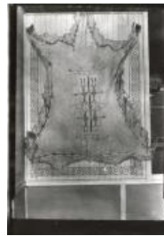
Decorated Hide (C557.3)