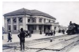
Photo of Union Depot (1999.8.20)