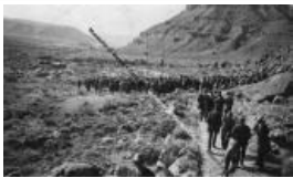
Highline canal (2004.44.218)