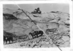
Serpent's Trail (2009.52.7)