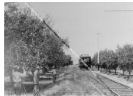
Interurban in orchard (1995.82.13)