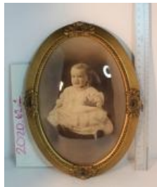
Baby Portrait (2020.62.1)