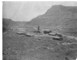
Highline Camp (2004.44.221)