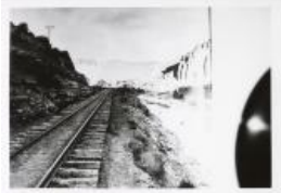
Uintah crossing bridge into Watson, Utah (1987.39.3)