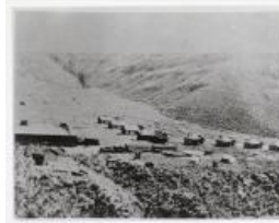
Scene of a town and train (1987.39.38)