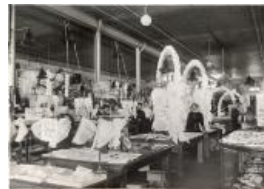
Photo and negative, Interior of the Fair Store (1999.8.34)