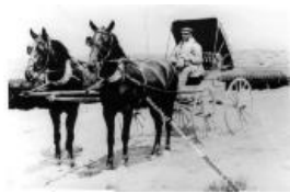
Highline canal overseer (2004.44.223)