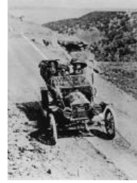
Ladies in a Car (2004.44.817)