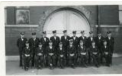
Railroad Conductors, c. 1910-1920 (F562.1)