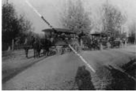
Fruitaville School Busses (2004.44.136)