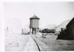
Engine #11 and water cars at Atchee. (1987.39.12)