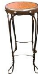
Dean Studio Table (2022.3.1)