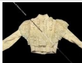
Lady's Blouse (B191)