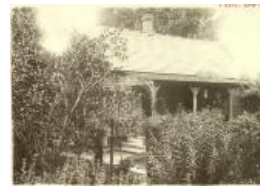
Bower House (1979.23.194)