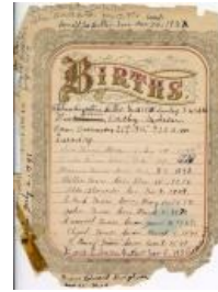
Births and Marriages page from the Butler Family Bible (2023.48.26)