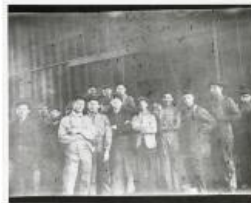
Photo of 16 unidentified individuals (1990.8.23)