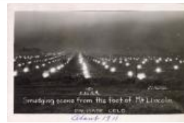
Photo of Smudging Scene (1979.23.1)