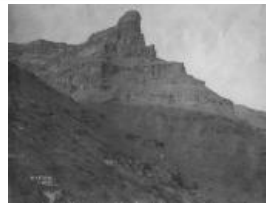
Mt. Fisher (2004.44.219)