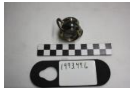
Sugar Bowl (1993.49.6)