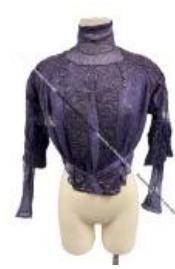
Lady's Blouse (B80)