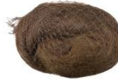
Switch of Hair (2023.42.94)