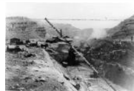
Steam shovel at canal (2004.44.222)