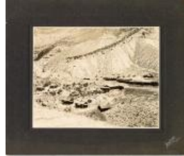
Carpenter, CO (2022.4.1)