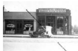
Progress Grocery (2007.57.3)