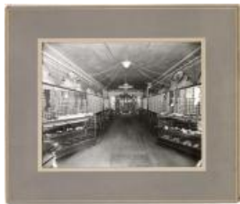
Benge's Shoe Store Interior (2021.24.7)