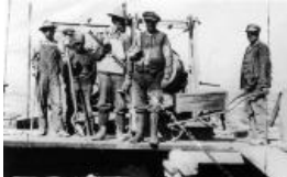
Highline canal workmen (2004.44.989)