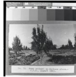
Pear orchards (1980.115.50)