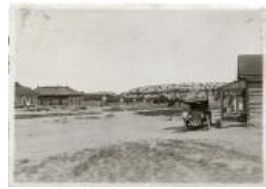
Photo of log structures with automobile (1990.8.21)