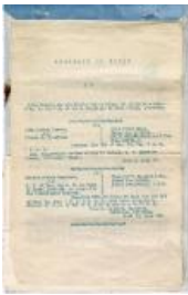
Abstract of Title (2001.49.1)