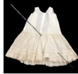
Baby Dress (2014.95.19)