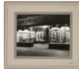
Exterior of Benge's Shoestore (2021.24.6)