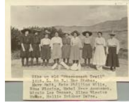
Hike up old "Stagecoach Trail" (1979.23.50)