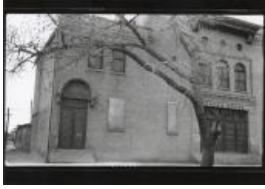
Park Opera House (1992.95.2)