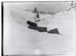
Uintah Train in Snow Wreck (1991.11.8)