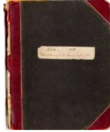
Proceedings of the Board of Health (1983.92.1)