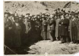
First Shovel Of Dirt Moved On Grand Valley Project (F732.4)