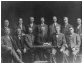
Mesa County Grand Jury (2004.44.818)