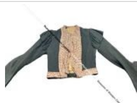
Lady's Blouse (B44)