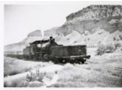
Uintah Railroad (1987.39.1)