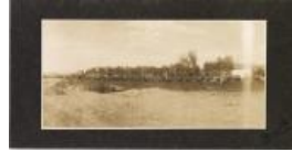
Train and boxcars at a town. (2022.4.10)