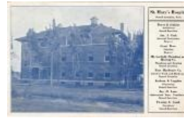
St. Mary's Hospital (F394.1)