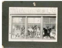
Photo of J. W. Hugus and Co.'s 1912 Window Display (1979.23.74)