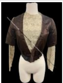
Lady's Blouse (B104)