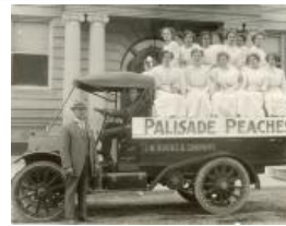
Photo of Palisade Peach Float (1979.23.79)