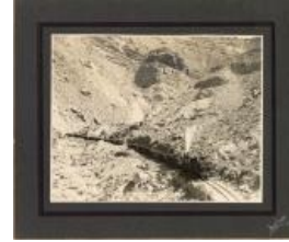
Little Book Cliff Railroad in Carpenter (2022.4.3)