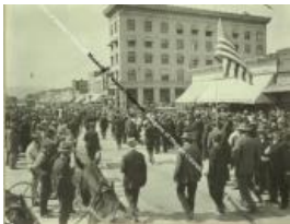
Palisade Day (1979.23.129)