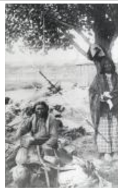
Monk Shavano and Chipeta (1980.13.74)