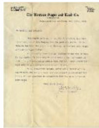
Letter of Recommendation (2006.43.3)