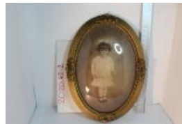
Portrait of a Child (2020.62.2)