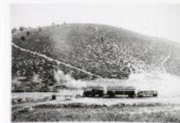
4th of July excursion train. (1987.39.9)