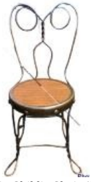
Dean Studio Child's Chair (2022.3.2)