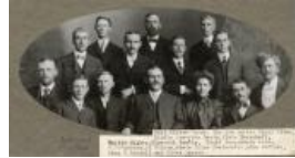
Post Office Force (F838.3)