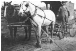
Progress Grocery (2007.57.1)