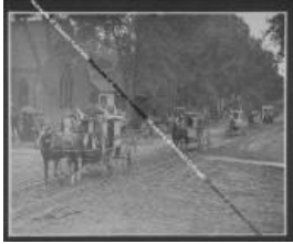
Rural Carriers in Parade, July 4, 1912 (2008.1.1)