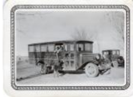
School Bus To Fruita Union High School (F879.8)