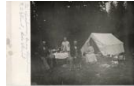
Two couples camping (2HA71.1)