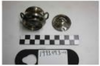
Gravy Boat Lid (1993.49.4)