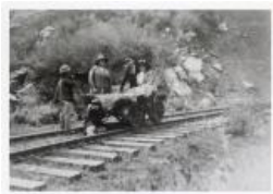
Riding on a hand car (1987.39.46)