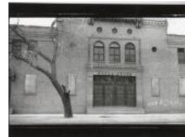
Park Opera House (1992.95.1)