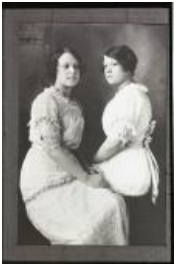
Photograph of Two Women (1986.26.23)