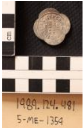
Metal Token. The Tibbs Cigar Co. Grand Junction Colo. (1989.124.481)