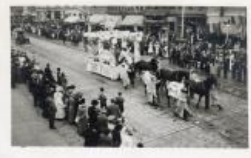
Fair Store Float (1999.8.57)