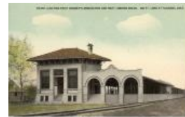
Grand Junction Fruit Grower's Association (1999.8.49)