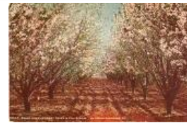
cherry trees (1999.44.18)