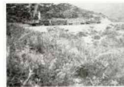
Train traveling between Columbine and McAndrews Lake (1987.39.14)