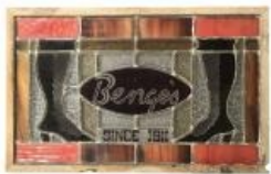
Benge's Stained Glass (2021.24.2)