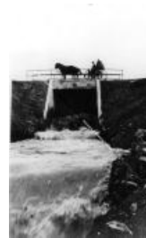
Spillway Camp (2004.44.226)