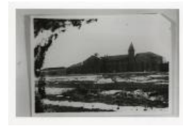
Sugar Beet Factory (F343.1)