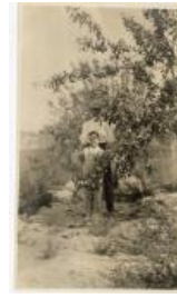
Copeco Hay (1999.8.66)