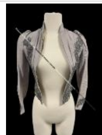
Lady's Blouse (B40)