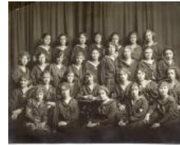
Portrait of a girl's group (2021.24.18)