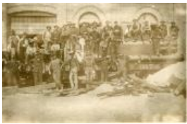
Colorado Sugar Mill Employees (2006.43.5)