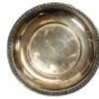
Sauceboat Tray (1993.49.2)