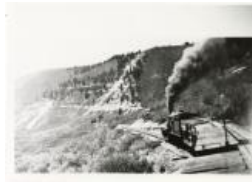
Train ascending Baxter Pass. (1987.39.10)