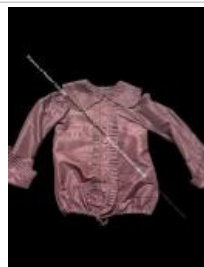
Child's Blouse (B369)