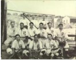
Palisade Baseball team (1979.23.216)