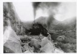
Train descending into Baxter Pass. (1987.39.8)