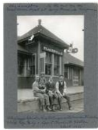
Photo of Placerville citizens at telegraph office (1987.26.11)