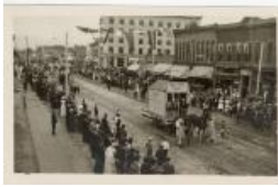
Fair Store Float (1999.8.58)