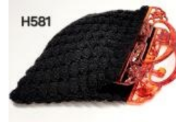
Black Crochet Purse (H581)