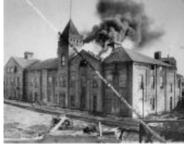
Sugar beet factory (2004.44.771)