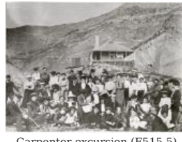
Carpenter excursion (F515.5)