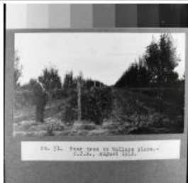
Pear orchards (1980.115.51)