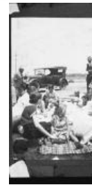
Family having picnic (2001.27.26)