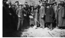
First Shovel at Highline Canal (2004.44.217)