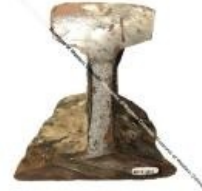
Trolley Tie (2019.65.2)