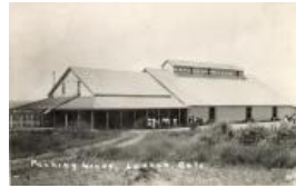
Postcard of Packing House in Lazear, Colorado (2023.42.8)