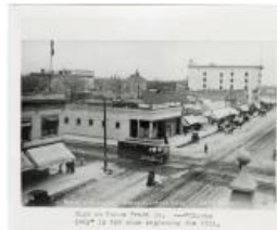
Photo of Downtown Grand Junction (1990.10.46)