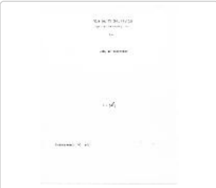
Oral History Alcoholic's Life Memoir (367.1980)