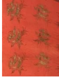
Red Shawl (2014.95.33)