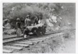
Riding on a hand car (1987.39.46)