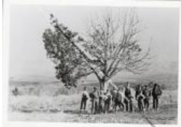
Ute Prisoner Surrender Tree (F230.2)