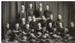
Grand Junction High School Football Team 1919 (F826.12)