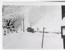
Uintah Train in the snow (1987.39.36)