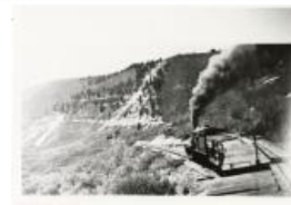
Train ascending Baxter Pass. (1987.39.10)