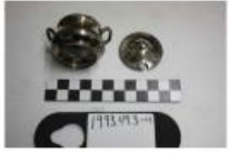
Gravy Boat Lid (1993.49.4)