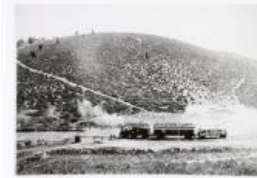
4th of July excursion train. (1987.39.9)