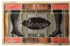
Benge's Stained Glass (2021.24.2)