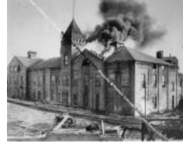
Sugar beet factory (2004.44.771)