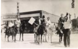
"Women have the right to vote" Advocates (F826.7)