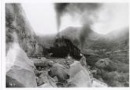
Train descending into Baxter Pass. (1987.39.8)