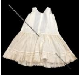
Baby Dress (2014.95.19)