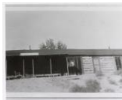
Watson Hotel at Watson, Utah (1987.39.28)