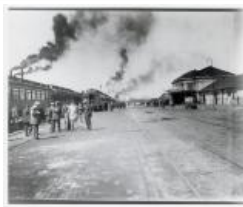
Grand Junction Railroad Station & Yards, 1900-1920 (F720.57)