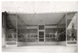
Exterior of the Benge's Shoe store (2021.24.11)