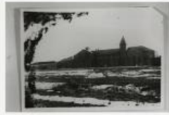
Sugar Beet Factory (F343.1)