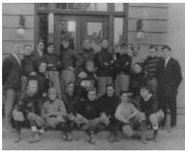
GJHS football team (2004.44.820)