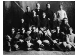
GJHS football team (2004.44.834)