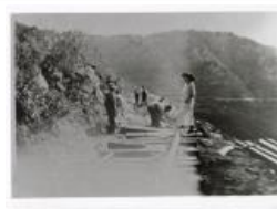
Rebuilding the Tracks (1987.39.24)