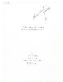
A Canyon, Coal, and A Railroad: The Story of Carpenter, Colorado (1985.114.1)