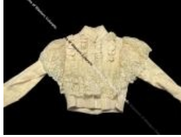
Lady's Blouse (B191)