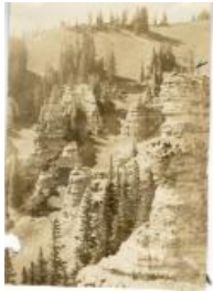
Mountain Landscape (2023.42.37)