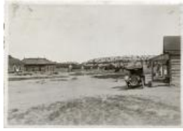
Photo of log structures with automobile (1990.8.21)