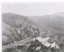
Bridge and building crew of three individuals on Pass. (1987.39.27)