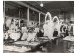
Photo and negative, Interior of the Fair Store (1999.8.34)