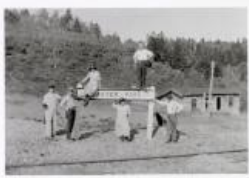
Travelers at Baxter Pass (1987.39.29)