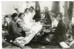
Picnic scene (1982.213.2)