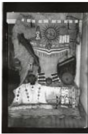
Native American Handmade Artifacts (C557.5)