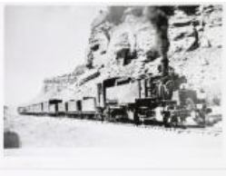
Mallet #51 north of Cooley (1987.39.11)