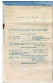
Abstract of Title (2001.49.1)