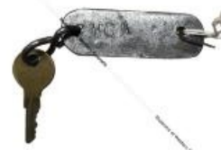
YMCA Keychain and Key (2018.17.1)