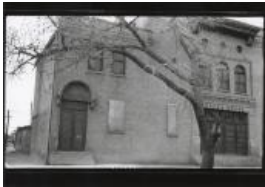
Park Opera House (1992.95.2)