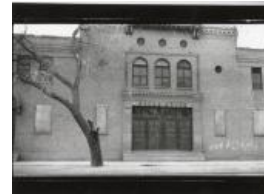
Park Opera House (1992.95.1)