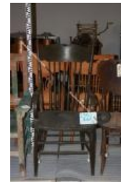
IOOF Chair (1983.162.4)