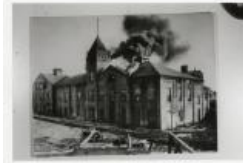
Sugar Beet Factory (F343.2)