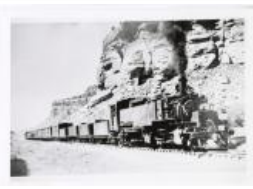
Uintah railroad locomotive (1987.39.2)