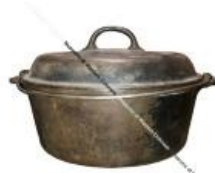
Cast Iron cooking pot (1980.107.2)