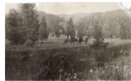
Mountain Landscape with Horses and Riders (2023.42.36)