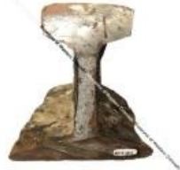
Trolley Tie (2019.65.2)