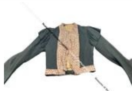
Lady's Blouse (B44)