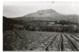
Photo of Smith farm and the Grand Mesa (2019.2.17)