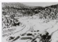
Dragon mine near Dragon, Utah. (1987.39.13)