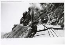
Uintah locomotive climbing 7.5% grade on Baxter Pass. (1987.39.5)