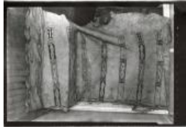
Decorated Hide (C557.2)