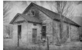
Cardiff School (2004.44.92)