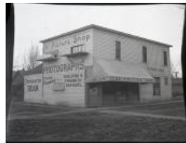
Frank Dean Studio (2023.40.4)