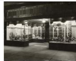
Exterior of Benge's Shoestore (2021.24.8)