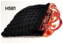
Black Crochet Purse (H581)