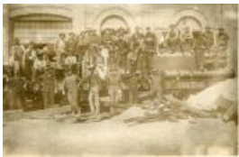
Colorado Sugar Mill Employees (2006.43.5)