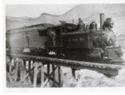
The Uintah Train (1987.39.19)