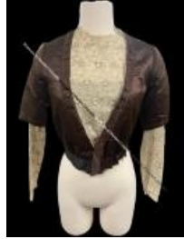
Lady's Blouse (B104)