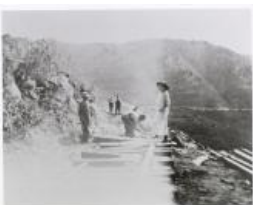
Bridge and building crew. (1987.39.25)