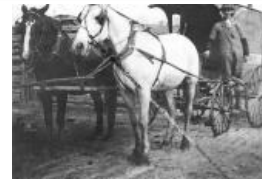
Progress Grocery (2007.57.1)