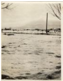
Moonlight Time Exposure on Gunnison River (F732.2)