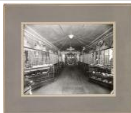
Benge's Shoe Store Interior (2021.24.7)