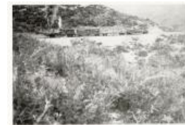
Train traveling between Columbine and McAndrews Lake (1987.39.14)