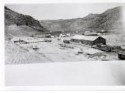
Dragon, Utah (1987.39.17)