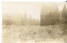
Mountain Meadow with Three Saddled Horses and Riders (2023.42.41)