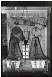
Native American Handmade Artifacts (C557.4)