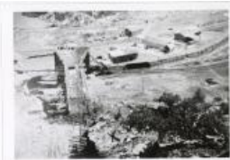
Dragon Mine near Dragon, Utah (1987.39.4)