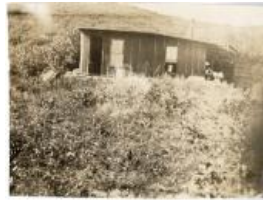
Meadow Landscape with Building (2023.42.38)