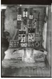
Native American Handmade Artifacts (C557.1)