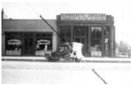
Progress Grocery (2007.57.3)