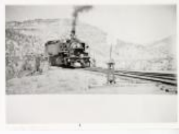
Mallet #51 crossing bridge into Atchee. (1987.39.15)