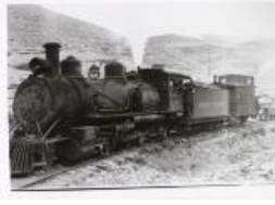
Engine #30 derailed at Rainbow Junction, Utah (1987.39.18)