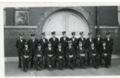
Railroad Conductors, c. 1910-1920 (F562.1)