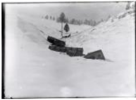
Uintah Train in Snow Wreck (1991.11.8)