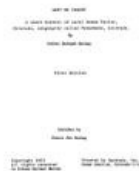
Lest We Forget: A Short History of Early Grand Valley, Colorado, Originally Called Parachute, Colorado