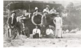
Travelers next to their vehicle (1983.77.52)