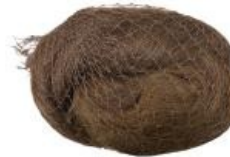
Switch of Hair (2023.42.94)