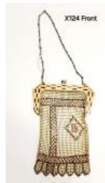
Metal Mesh Purse (X124)