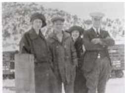
Two couples gathered at Atchee, Colorado. (1987.39.23)