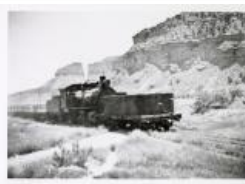
Uintah Railroad (1987.39.1)