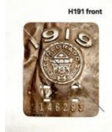
1919 License Plate Tag (H191)