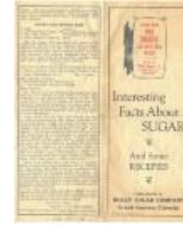
"Interesting Facts about Sugar" (2006.43.4)