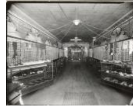
Bengel Shoe Store (2HA289.4)