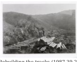
Rebuilding the tracks (1987.39.26)