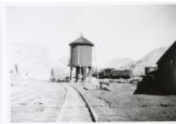
Engine #11 and water cars at Atchee. (1987.39.12)