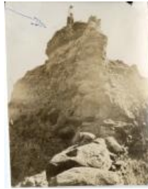
Rocky Spire with Woman Standing on Top (2023.42.39)