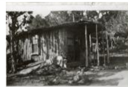
Photo of Smith cabin (2019.2.21)