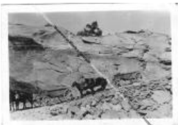
Serpent's Trail (2009.52.7)