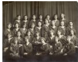
Portrait of a girl's group (2021.24.18)