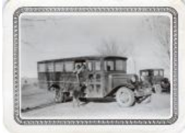
School Bus To Fruita Union High School (F879.8)