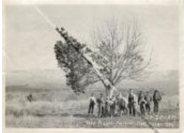
Ute Prisoner Surrender Tree (F230.1)