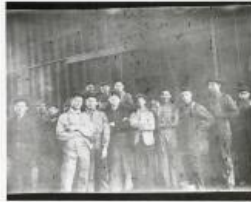
Photo of 16 unidentified individuals (1990.8.23)