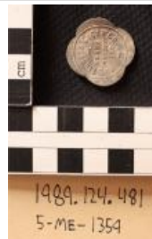
Metal Token. The Tibbs Cigar Co. Grand Junction Colo. (1989.124.481)