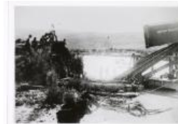
Wreck of engine #10 at bridge 2A. (1987.39.7)