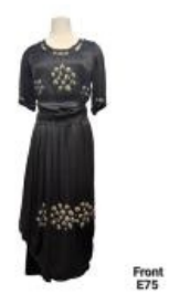
Front E75 Dress (E75)