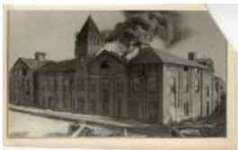
Sugar Beet Factory (F343.3)