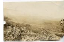
Mountain Valley with Building and Road (2023.42.40)