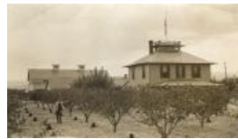
Cross Orchards House, Barn, and Orchards (1980.66.17)