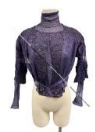
Lady's Blouse (B80)