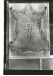
Decorated Hide (C557.3)