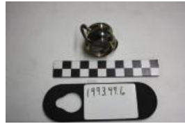
Sugar Bowl (1993.49.6)