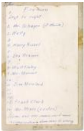
Photograph of Palisade Fire Department (1979.23.18)