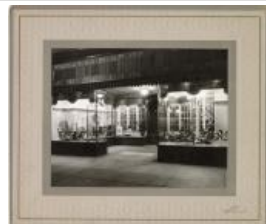
Exterior of Benge's Shoestore (2021.24.6)