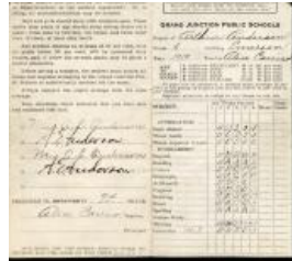
GJ Public Schools Report Card (2021.23.10)