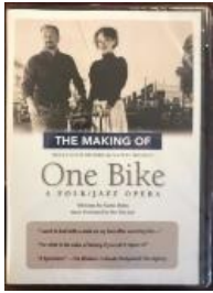
The Making of "One Bike" Opera (2021.22.1)