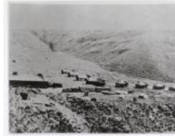
Scene of a town and train (1987.39.38)