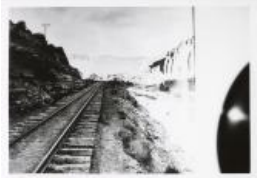
Uintah crossing bridge into Watson, Utah (1987.39.3)