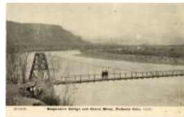
Photo of a Suspension Bridge and Grand River (1979.23.39)