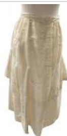
Ladies Skirt (A939.2)