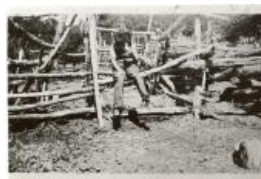
Photo of Smith corral with unidentified individual (2019.2.19)