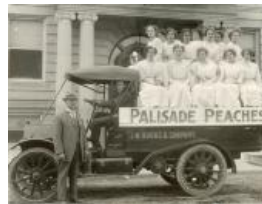
Photo of Palisade Peach Float (1979.23.79)