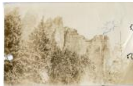
Mountain Landscape (2023.42.35)