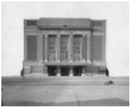
Avalon theatre (2004.44.887)