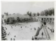
Swimming at Moyer Natatorium (1992.93.50)