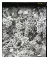
Grape scene (2023.40.16)