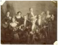
Grand Junction Mandolin Club (F831.1)