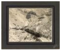
Little Book Cliff Railroad in Carpenter (2022.4.3)