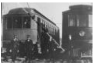
Grand River Valley Railway (1995.82.8)