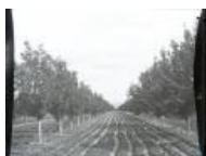
Orchard Scene (2023.40.15)