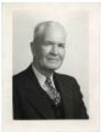
Portrait of Unidentified man (2HA17.4)