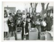
Soupeaters Children (2004.44.61)