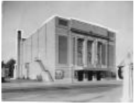
Avalon Theatre (2004.44.886)