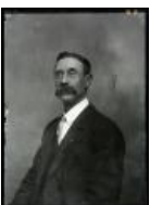
Portrait of an Unidentified Man (2023.40.40)