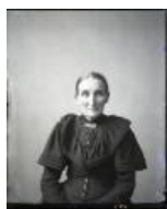
Portrait of unidentified woman (2023.40.1)