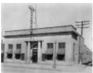
The Daily Sentinel (2004.44.900)