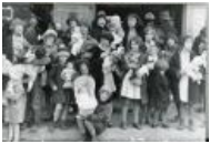
Soup Eaters Children (2004.44.56)