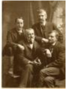
The Four Horseman Portrait (2HA17.3)