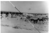
Siphon Highline Canal (2004.44.224)