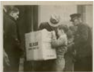
Soup Eaters (2004.44.49)