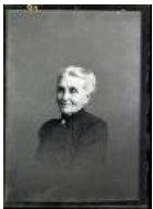
Portrait of an older woman (2023.40.30)