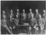
Mesa County Grand Jury (2004.44.818)