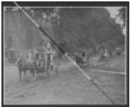
Rural Carriers in Parade, July 4, 1912 (2008.1.1)