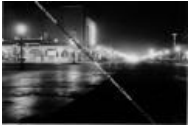
Main Street Night Scene (2004.44.885)