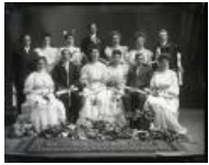
Graduating class of 1905 (GJHS) (2023.40.3)