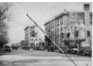
Fifth Street (2004.44.749)