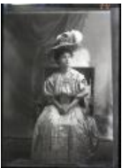
Portrait of a young woman (2023.40.32)