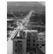
Fifth Street (2004.44.752)