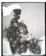
Photo of a girl and her apples (2023.40.10)