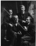
Four Horsemen (2004.44.1033)