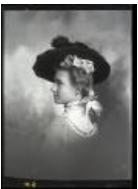
Portrait of a young woman (2023.40.31)