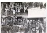
Soupeaters Collage (2004.44.62)