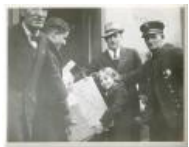
Soup Eaters (2004.44.59)