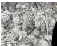
Grape Scene (2023.40.23)