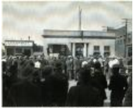
World Series (2004.44.1118)