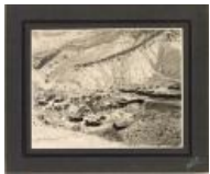
The town of Carpenter (2022.4.4)