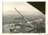
Early GJ aerial, Colorado River (1981.115.173)