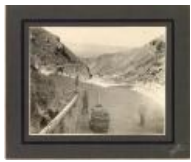
View from the Book Cliff Mine (2022.4.2)