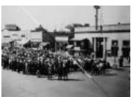
World Series (2004.44.64.1)