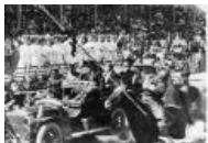
President William Howard Taft (2004.44.1042)