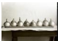
Onions from the Mile High Seed Co. (2023.40.26)