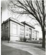
Grand Junction High School, 1920 (F397.1)