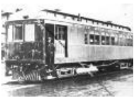
Grand River Valley Railway (1995.82.2)