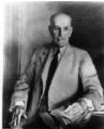
Rep. Edward T. Taylor (2004.44.1041)