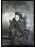
Portrait of an Older Woman (2023.40.29)