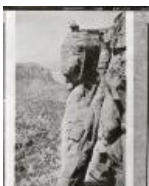
Cold Shivers Point (F602.15)