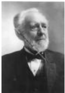
Sen. Henry M. Teller (2004.44.1040)