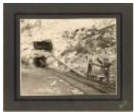
Book Cliff Mine Entrance (2022.4.5)