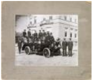
Grand Junction Fire Department with Fire Engine (1990.58.24)