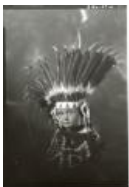
Child in Indian Headdress (F602.13)