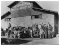
American Crate & Basket Co. (1998.18.1)