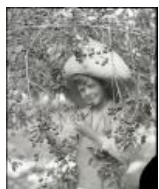
Boy with cherries at Knight's Orchard (2023.40.11)