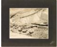
Carpenter, CO (2022.4.1)