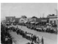
World Series (2004.44.64.8)