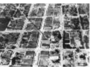
aerial view of downtown GJ (2004.44.776)