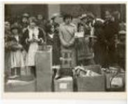
Soup Eaters (2004.44.48)