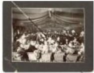
Lincoln Park Barn (2007.74.16)