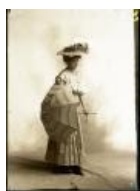
Photo of a young woman (2023.40.25)