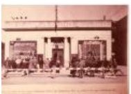
Post Election Day 1936 (2004.44.63)