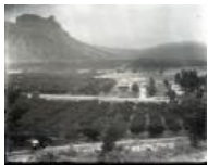
Agriculture Scene of Valley (2023.40.5)