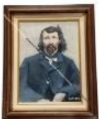
"Alfred Packer" by Jack Murray (2002.5.4)