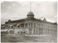
Canon Block, c. 1900 (F922.1)