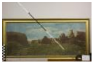
Hand Tinted Photo of Independence Monument (B807)