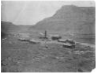
Highline Camp (2004.44.221)