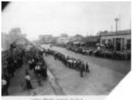
World Series (2004.44.901)