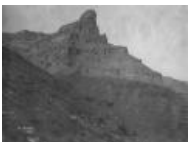
Mt. Fisher (2004.44.219)