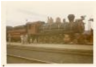
Photo and negative of Rio Grande Western Ry train No. 75 (1990.10.76)