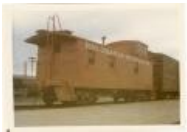
Photo and negative of Denver & Rio Grande Western Ry caboose (1990.10.75)