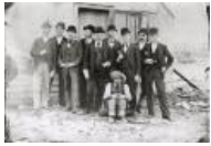
Denver and Rio Grand Baseball Team (F316.1)