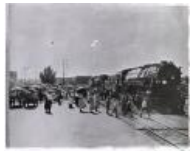
D&RG New Locomotive (F936.1)