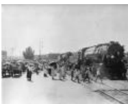
new D&RG locomotive (2004.44.871)