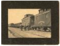
Rio Grande Western Caboose #12 (F220.1)