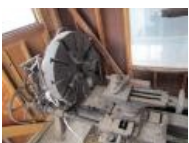
Industrial Metal Lathe D&RGW (CU 1992.40)