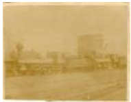
Denver and Rio-Grande Railroad Locomotives and Watertanks (F720.60)