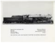
Informative Print from the D&RGW Railroad Co. on engine no.1600 (1990.10.31)