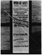
Rio Grande Ad (2004.44.951)