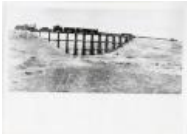
Photo of D&RG work train. Notes say The train could be on the North Fork branch near Hotchkiss, CO. (1990.10.45)