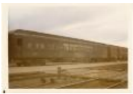
Photo and negative of Denver & Rio Grande Western Ry baggage car and C&S coach (1990.10.74)