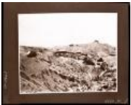
Negative of Carpenter, Colorado (1990.10.16)