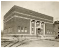
Photo of Masonic Lodge, Grand Junction (1990.8.16)