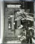
Negative of a family of four. (2002.21.69)