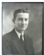
Negative of young man in suit (2002.21.244)