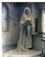
Negative of women in wedding dress (2002.21.236)