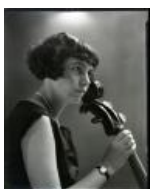
Negative of young lady with Cello (2002.21.246)