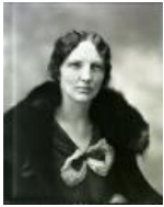
Negative of mom only (2002.21.67)