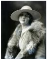
Negative of Lady with Hat (2002.21.118)