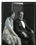
Negative of man and woman sitting (2002.21.162)