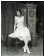
Negative of Young girl in dress with curl on forehead (2002.21.259)