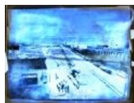
Negative of Big Scenes of the 1970's (2002.21.3)