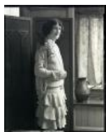
Negative of women standing (2002.21.238)