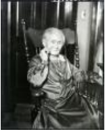
Negative of older woman in chair in a dress (2002.21.179)