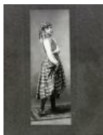
Unidentified woman (2001.27.1)