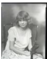
Negative of Young lady with ruffled dress (2002.21.262)