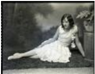
Negative of young girl in dress with curl on forehead (2002.21.258)