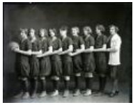
Negative of 1925 Women's YMCA team (2002.21.248)