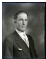
Negative of young man in suit (2002.21.245)