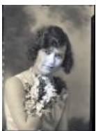
Negative of young lady in dress (2002.21.254)