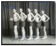
Negative of 1925 YMCA Men's champions (2002.21.247)