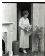
Negative of a member of the Jones family (2002.21.109)