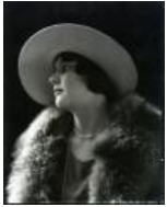
Negative of Lady with Hat. (2002.21.119)