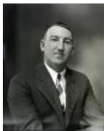
Negative of a man in a striped suit (2002.21.160)