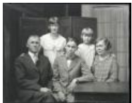
Negative of a family of 5 (Mom, Dad, two girls, one boy) (2002.21.73)