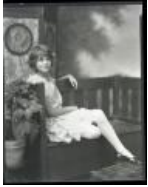
Negative of Young Lady with ruffled dress (2002.21.263)