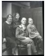
Negative of a family of four (Mom, Dad, Girl, Boy) (2002.21.70)