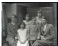
Negative of a family (Mom, Dad, Son, Three girls) (2002.21.66)