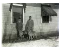
Negative of a man his son and two dogs (2002.21.169)