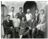
Negative of a family of 7 (2002.21.75)