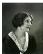
Negative of a Mother (2002.21.168)