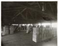
Shipping Dock (1980.169.4)