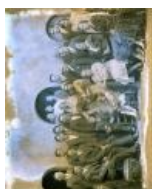
Negative of wedding party (2002.21.235)