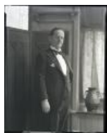
Negative of a man standing (2002.21.163)