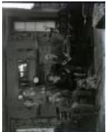
Negative of a family of four (2002.21.71)