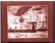
Negative of coal mines at Carpenter, Colorado (1990.10.17)