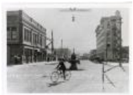
Photo of Downtown Grand Junction with fountain (1990.10.4)