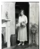
Negative of a family member of the Jones family (2002.21.108)