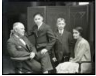
Negative of a family of four (Mom, Dad, Two boys) (2002.21.68)