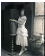
Negative of Young girl in dress with curl on forehead (2002.21.260)