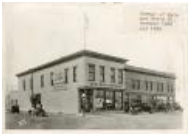
Photo of the Corner of Main and Third St., Palisade (1979.23.100)