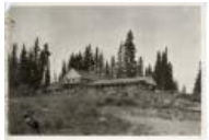
Photo of Morses Hotel, Grand Mesa (1990.8.27)