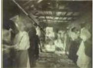
Peach packing shed and packers (1979.23.131)