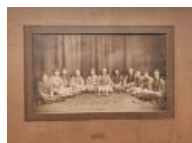
Photograph of Grand Junction Campfire Girls (2023.25.1)