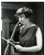
Negative of young lady with Cello (2002.21.252)