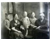
Negative of a family of 5 (2002.21.74)