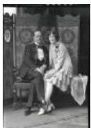
Negative of a man and woman sitting (2002.21.161)