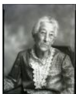
Negative of Older woman in print dress (2002.21.166)