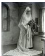
Negative of women in wedding dress (2002.21.237)