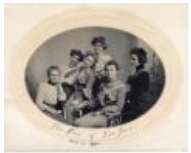
The Fair of the Fair (1999.8.105)