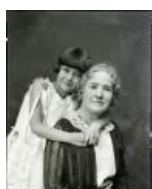
Negative of a mother and daughter (2002.21.167)