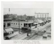
Photo of Downtown Grand Junction (1990.10.46)