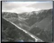
Mountain with Oil Shale (2002.21.180)