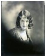
Negative of young girl in dress with curl on forehead (2002.21.261)