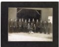
Grand Junction Fire Department in front of Firehouse (1990.58.17)