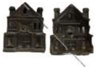
Childs Bank (H542)