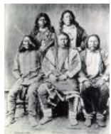
Five chiefs of the Uncompahgre Utes (1980.13.71)