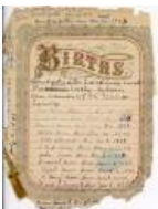
Births and Marriages page from the Butler Family Bible (2023.48.26)