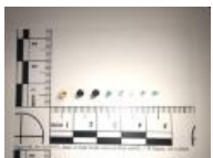
8 Beads (D2022.1.3)