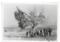
Ute Prisoner Surrender Tree (F230.2)