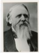
Gov. John Evans between 1814-1897 (2004.44.27)