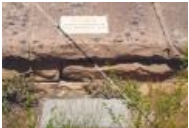
Kent-Mcclintock tombstones (2008.70.3)