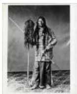
White River Ute Medicine Man (1980.13.96)