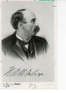
Horace Tabor (2004.44.28)