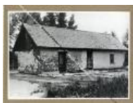
Chipeta and Ouray's Home (1980.13.75)