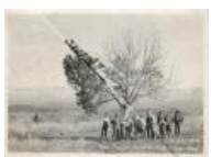
Ute Prisoner Surrender Tree (F230.1)