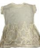
Baby Dress (E3)