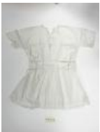
Child's White Cotton Dress (1994.7.47)