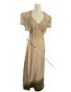
Lace gown (1982.79.20)