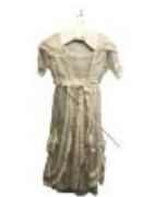
Off-White Organza Dress (D934)