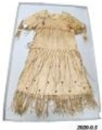
Beaded Leather Dress (2022.0.5)