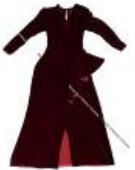
Red Velvet Dress (C898.1)