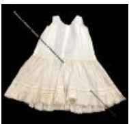
Baby Dress (2014.95.19)