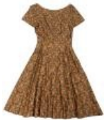
Brown Dress with orange accents (1999.55.13)