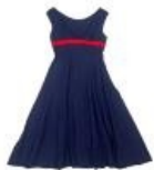
Navy Dress and Shawl, with red accents (1999.55.18)