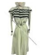
2 piece dress with detachable collar (1982.220.17)