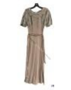
Wedding Dress (1982.220.1)