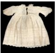
Child's Dress (2014.95.18)