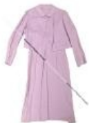
Light Purple Dress and Jacket (1999.55.14)