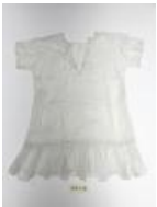
Child's White Dress (1994.7.48)