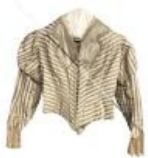
Lucy Drake Ela Wedding Dress (H545)