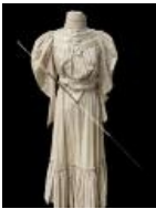
Two-piece dress (D52)