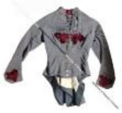
Red/Gray Wedding Dress (1993.74.1-2)