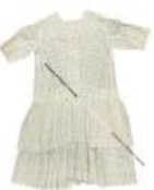
Childs White Dress (D932)