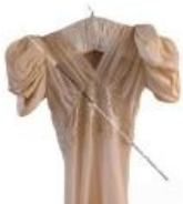
Chiffon dress (2H375)