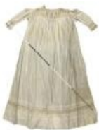
Baby Dress (D566)