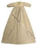
Infant Dress (C794)